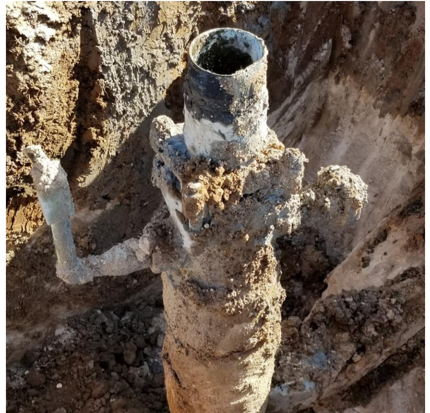
5 1/2" casing