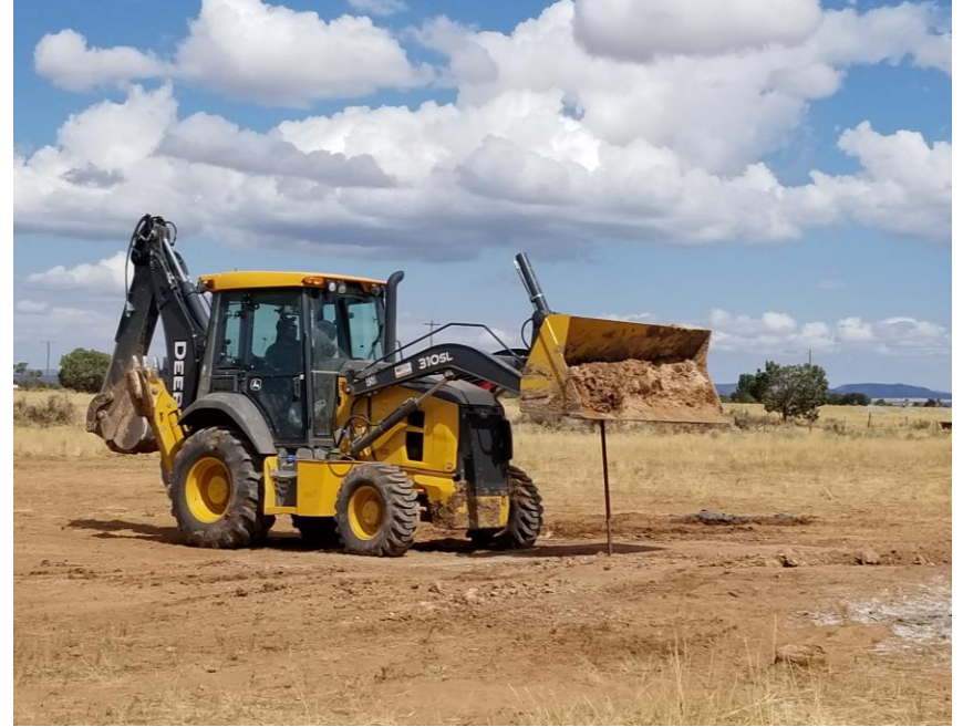
Placing post over location of PA well.