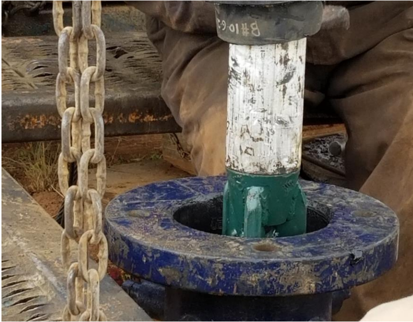
Starting to drill surface plug