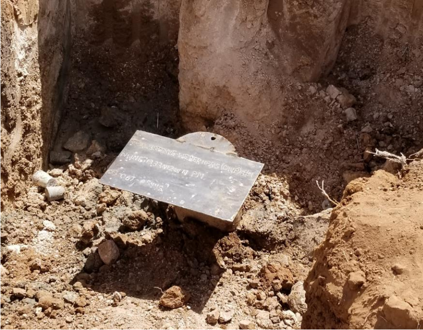
Wellhead cut and plated