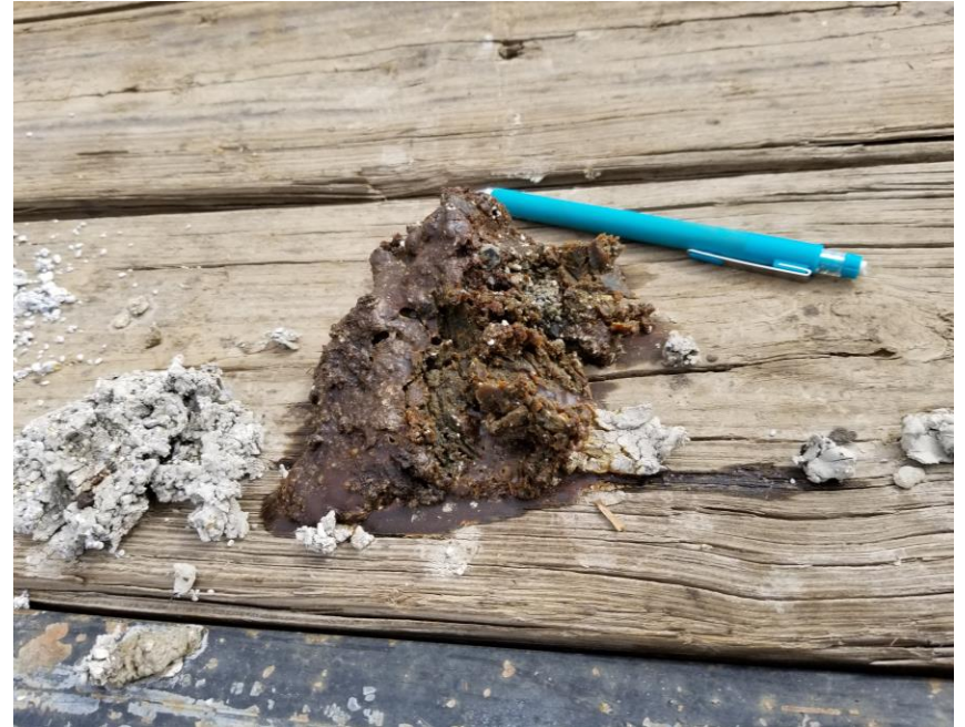
Circulated out parafin.