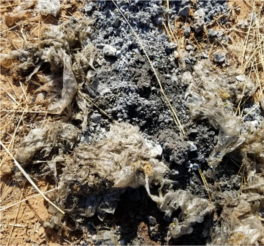
Bits of plastic circulating out with drill cuttings.