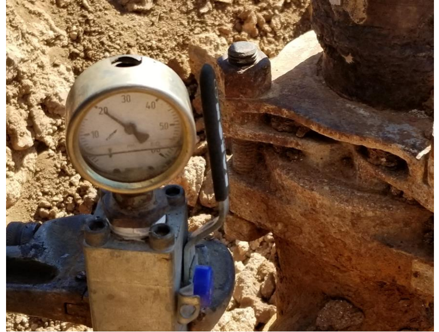
20 PSI on Bradenhead