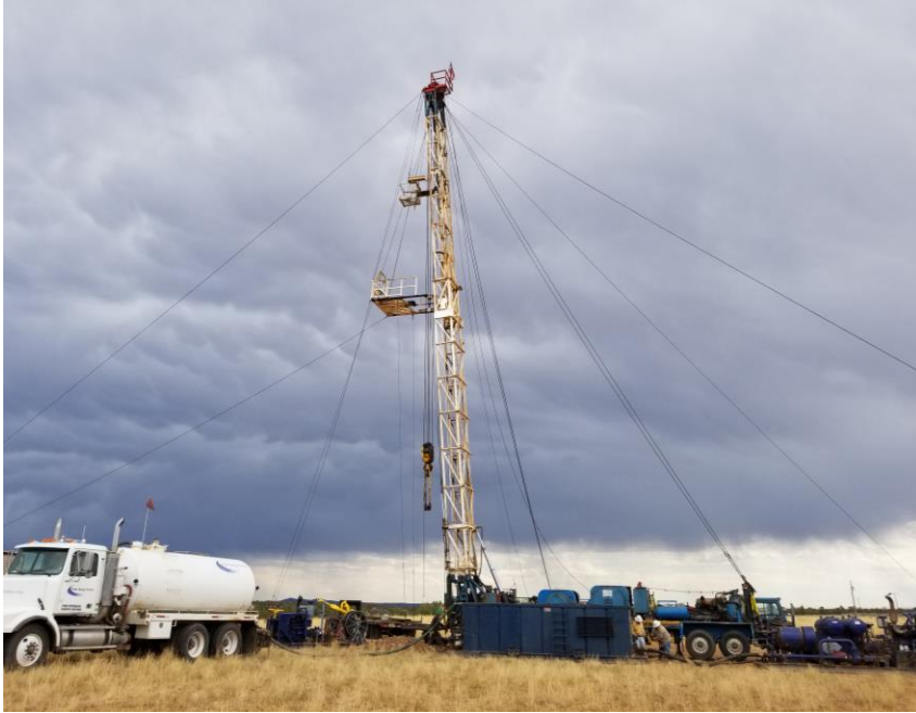
Borderline Inc Rig #19 on site