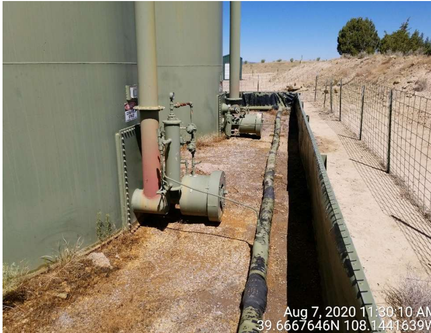
Impacted material within the tank battery secondary containment structure.