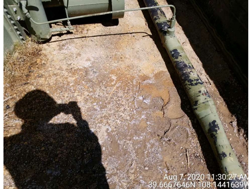
Impacted material within the tank battery secondary containment structure.