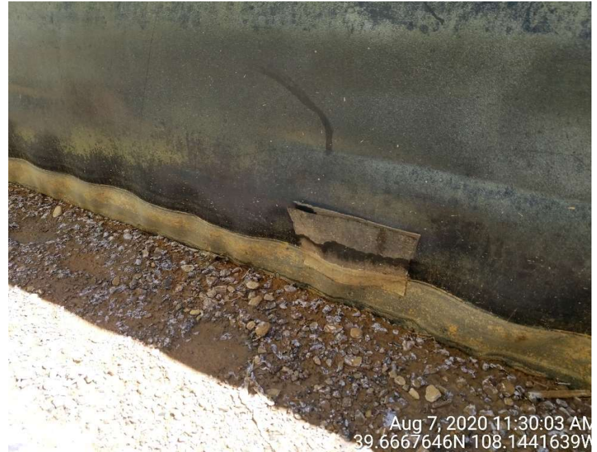
Residual staining ring and patch peeling off the synthetic liner.