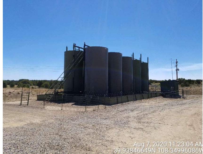
Tank battery looking southeast.