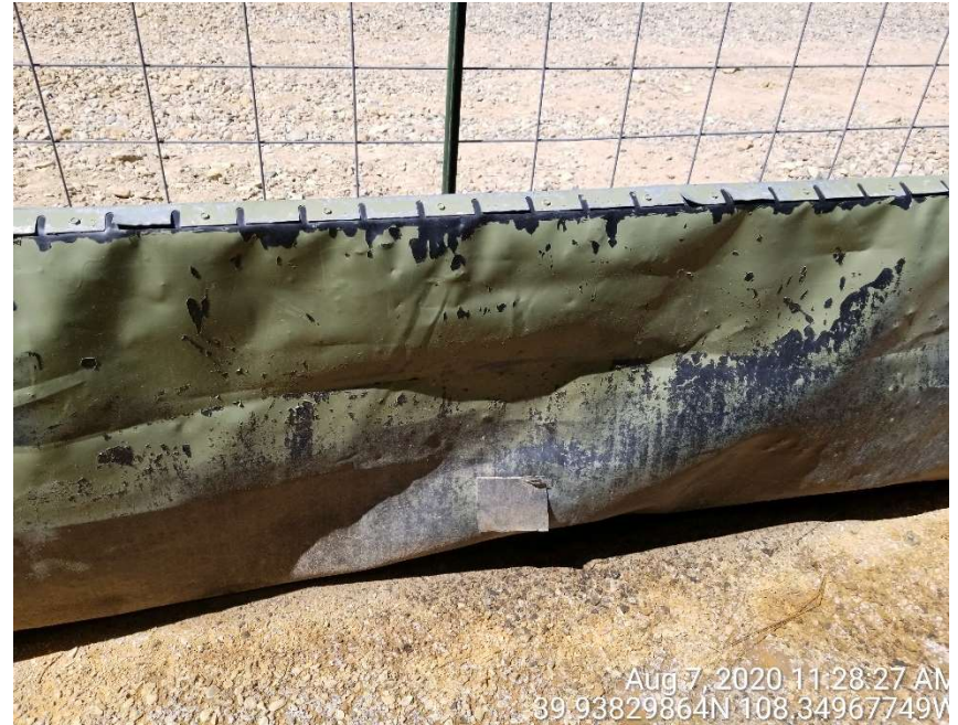
Patch peeling off the synthetic liner.