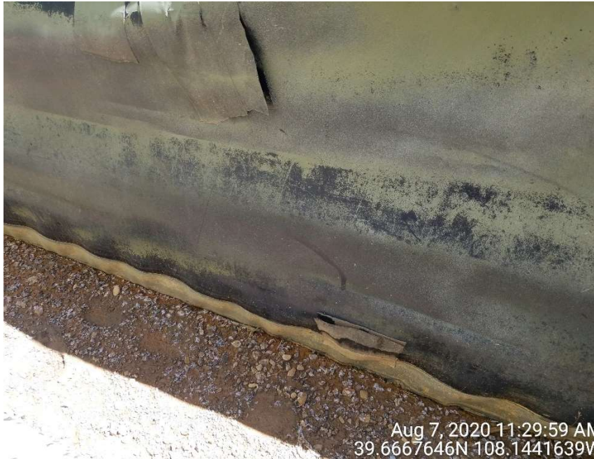
Residual staining ring and patches peeling off the synthetic liner.