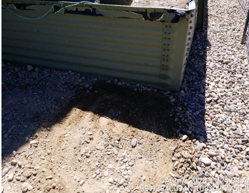
Impacted material located on the exterior of the tank battery.