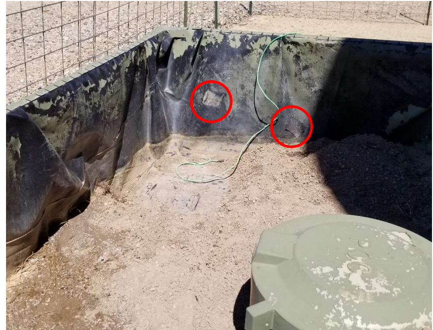
Northwest corner of the tank battery, note the patch peeling off and the missing patch (red area).