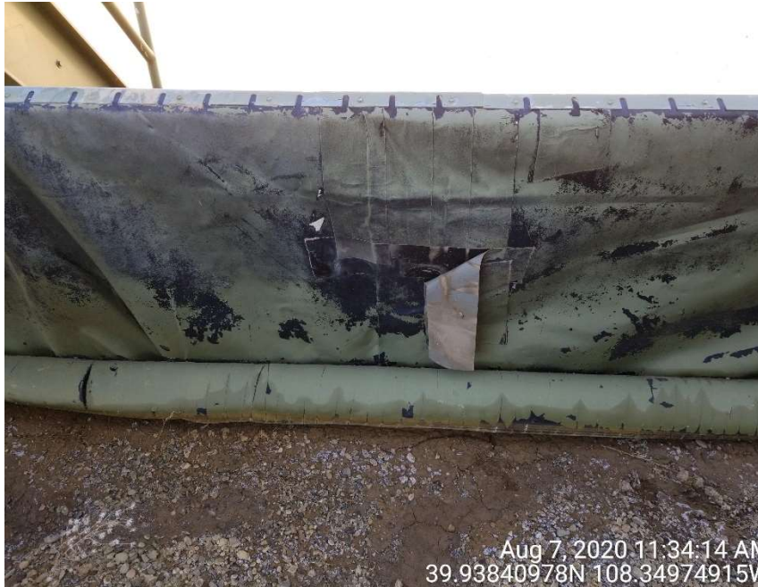
Patch peeling off the synthetic liner.