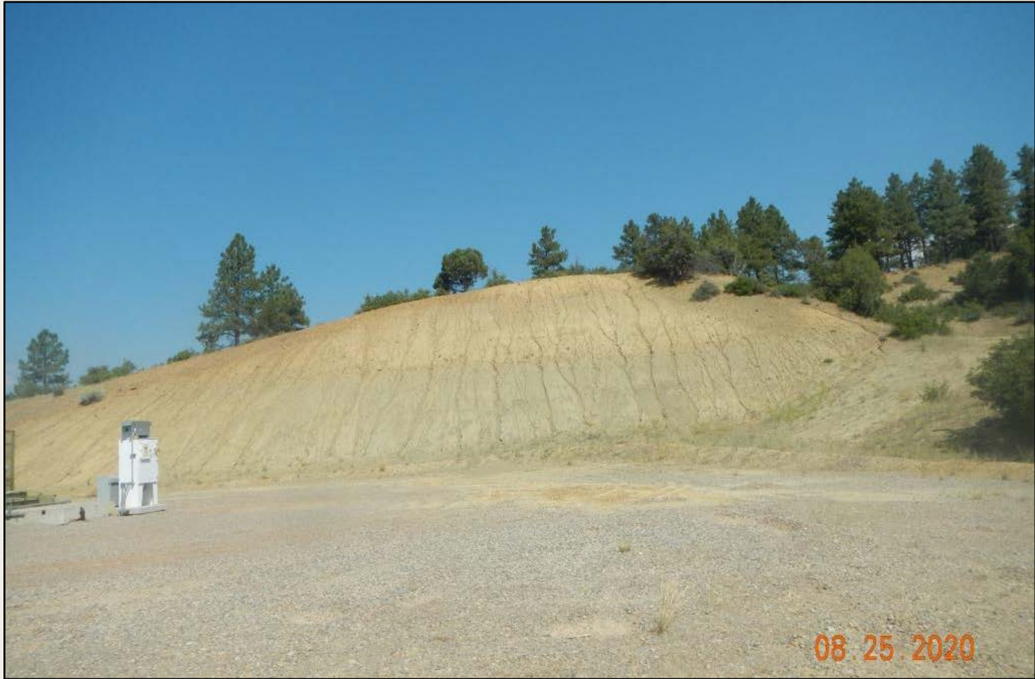
Photo 2. View of exposed and eroding soils on the northern cut-slope.