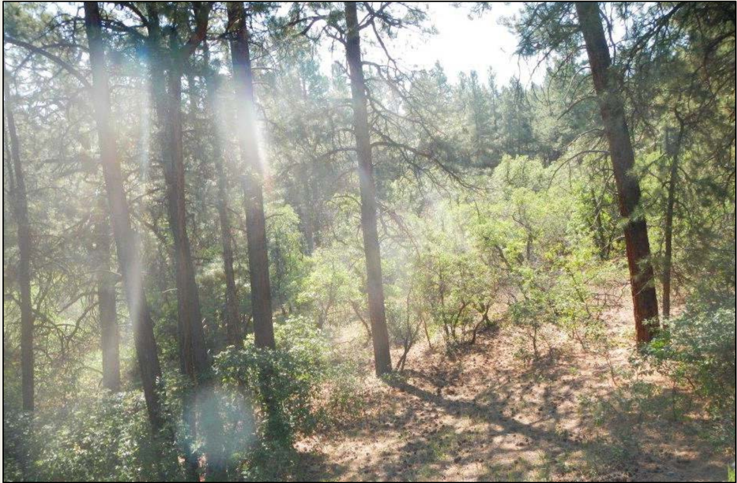
Photo 5. View of reference area comprised of ponderosa pine woodland with understory of gambel oak, Sandberg bluegrass, and forbs such as purple aster.