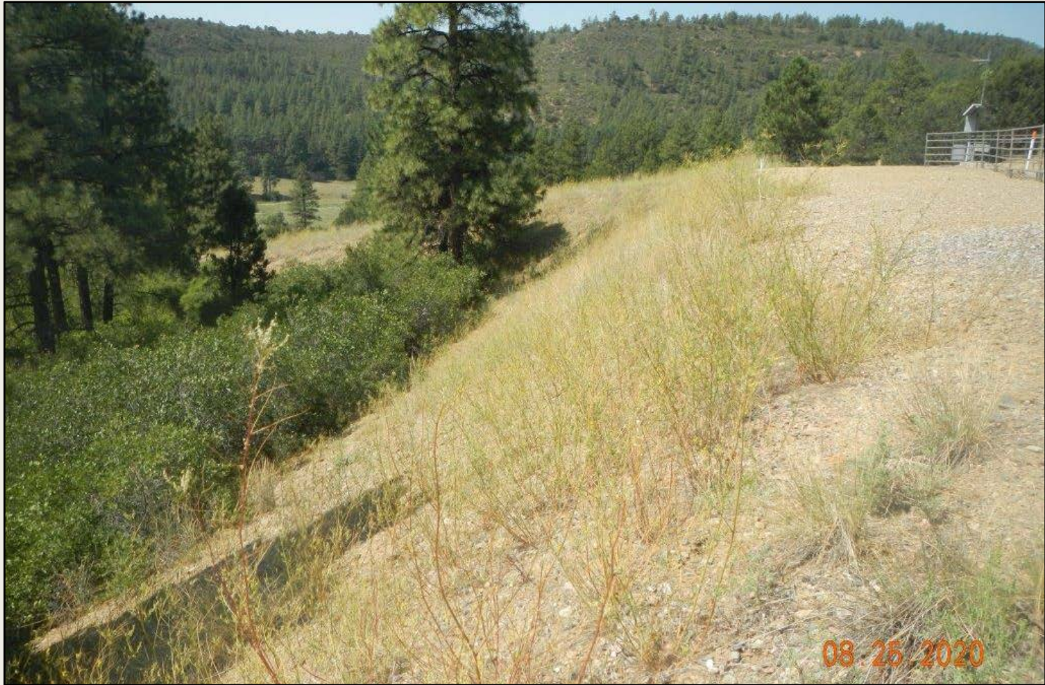
Photo 4. View of the southern fill slope, facing eastward. Revegetation is progressing with western wheatgrass and yellow sweetclover.