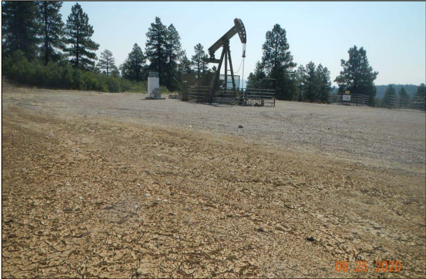
Photo 1. View of the project area from the northwestern corner facing center.