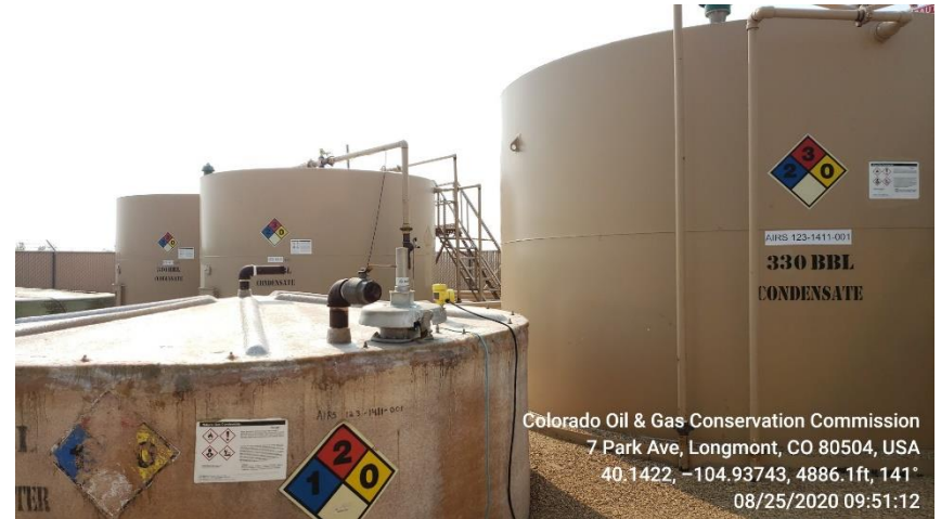
Photo 3 TB sign