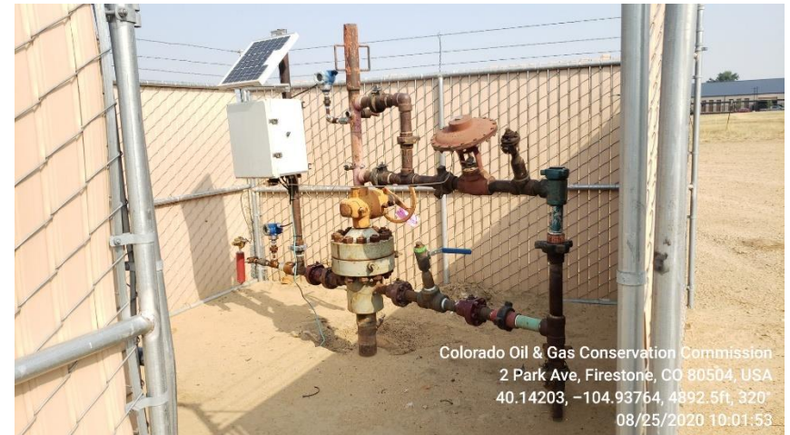
Photo 1 WH sign