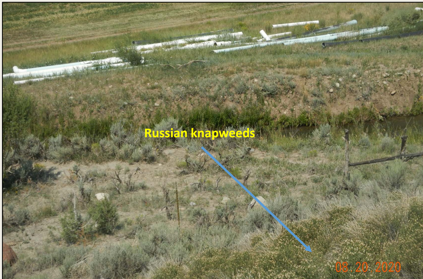
Photo 4. View of dense Russian knapweeds growing on the northwestern fill slope. Approximately 2000 individuals observed.