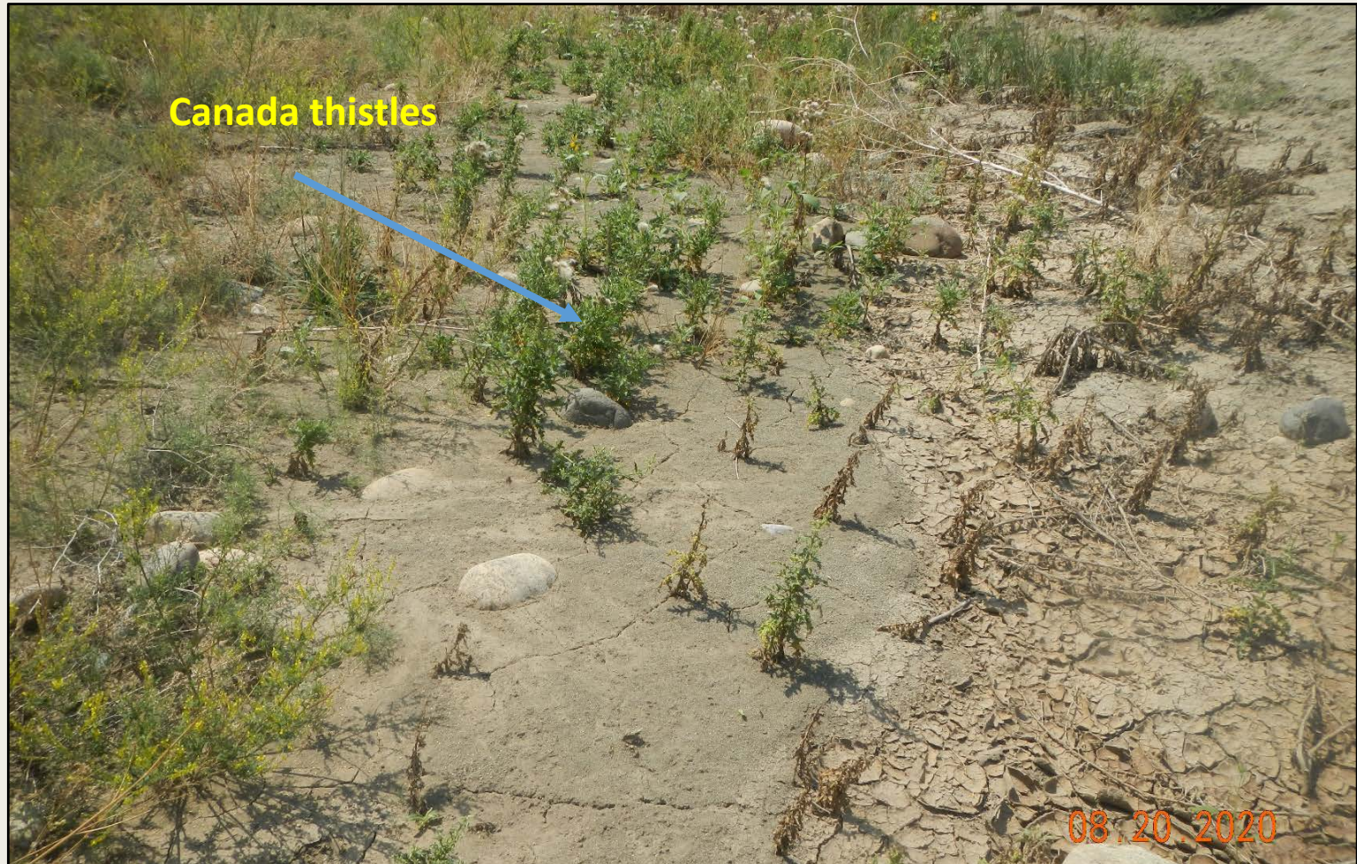
Photo 5. View of Canada thistles within the eastern fill slope. Approximately 300 Canada and Scotch thistles observed here.