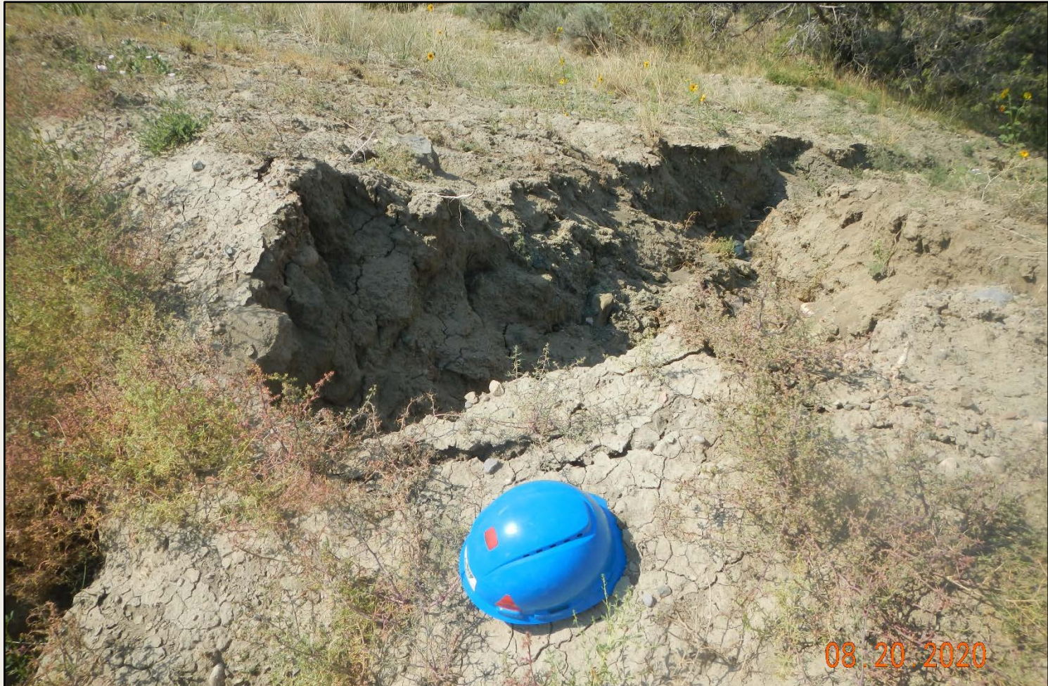
Photo 6. View of erosional gully in the western fill slope, approximately 3-4 feet wide and deep (facing down-slope from top of slope). Hard hat in place for scale.