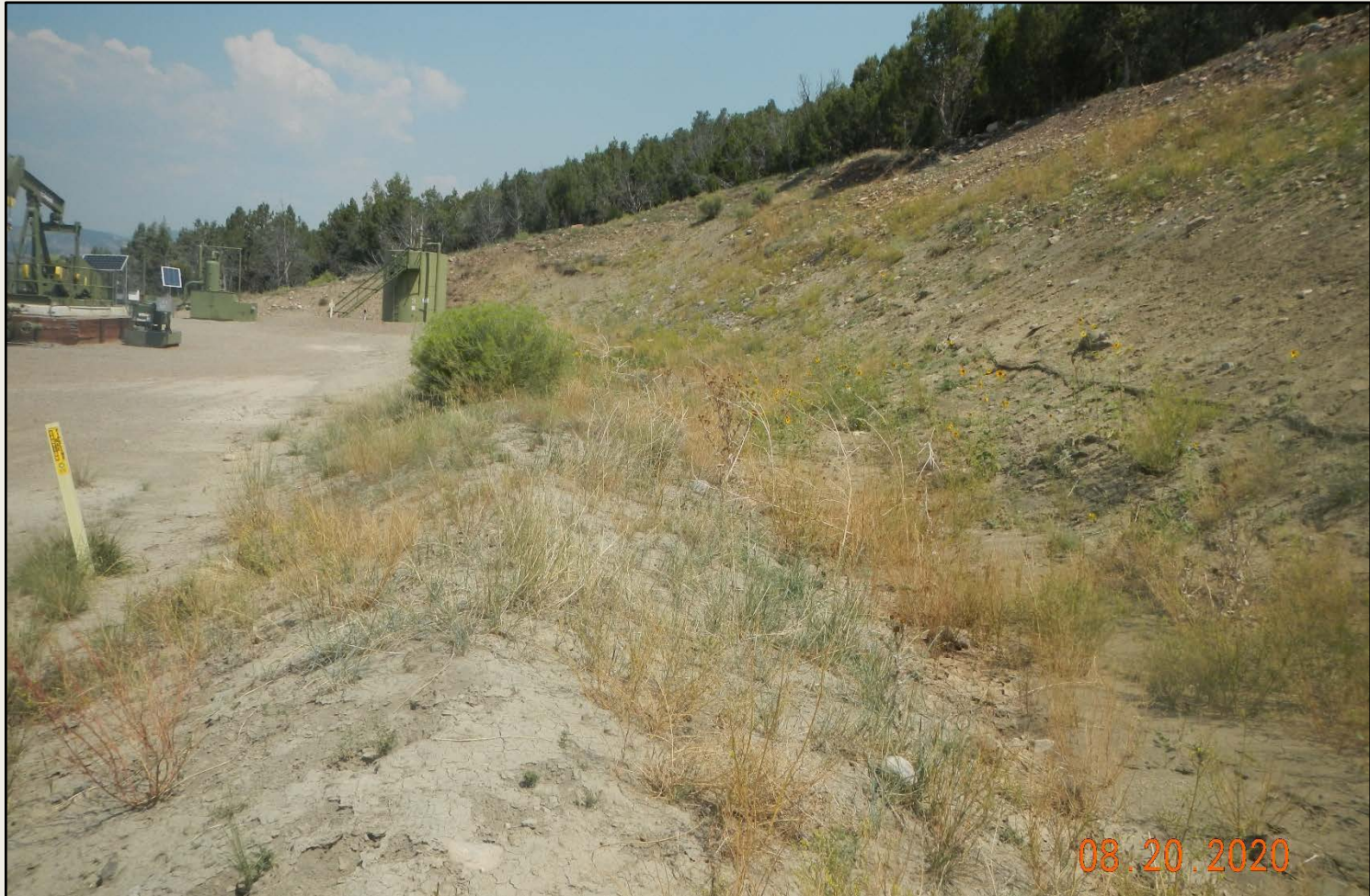
Photo 2. View of the eastern project area facing northward. Revegetation is progressing in portions of the interim reclamation area with grasses and shrubs such as western wheatgrass and rubber rabbitbrush.