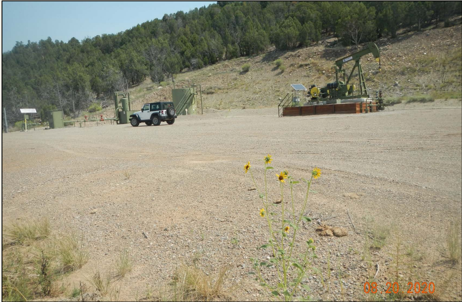
Photo 1. View of the BP well from the southeastern corner facing center.