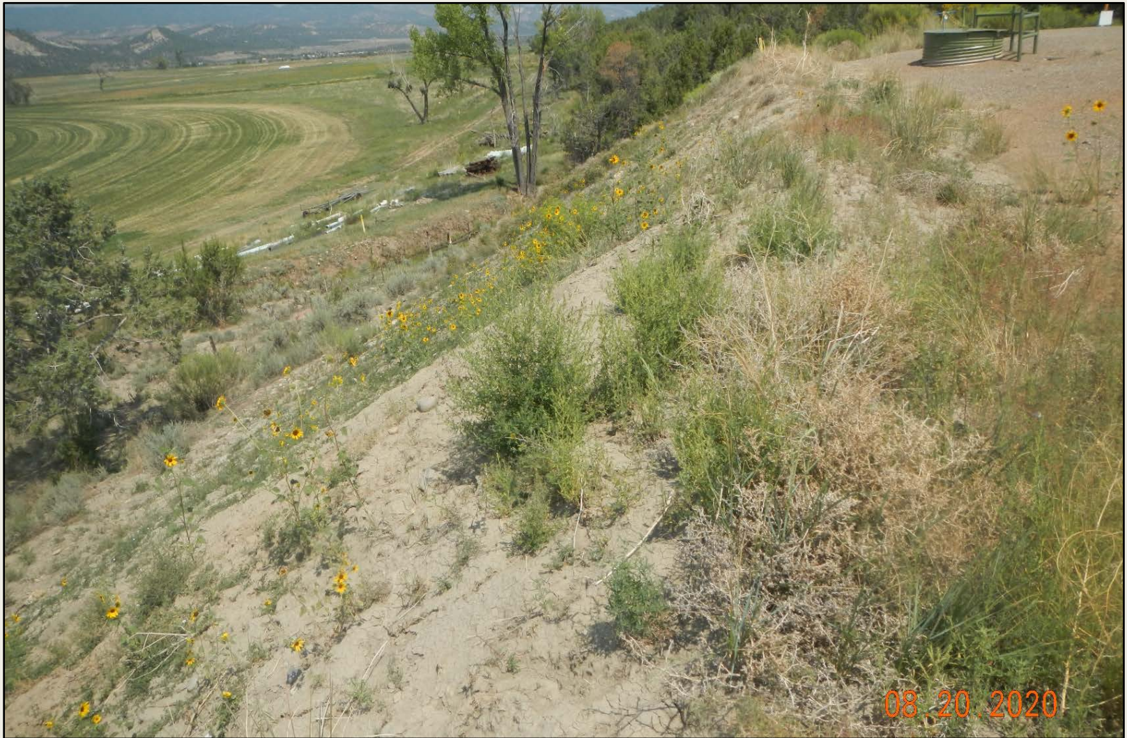
Photo 8. View of the well pad fill slope facing northward. Scattered desirable vegetation such as western wheatgrass and Indian ricegrass present, but the majority of the slope remains unstabilized with bare soils or weeds such as Russian thistle.