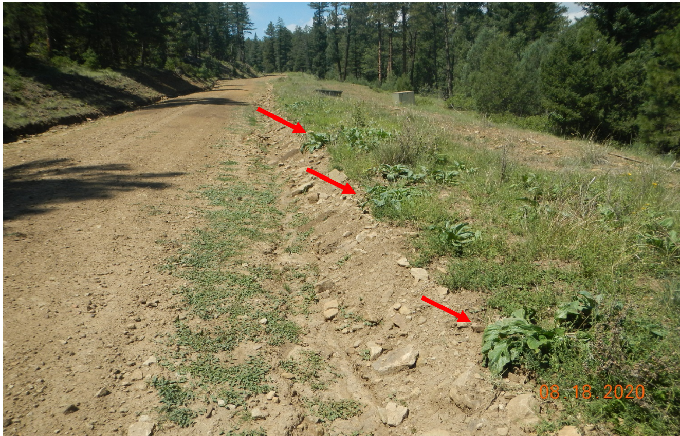
Photo 3. Facing west along the road ascending the hill. There are noxious weeds which have not been controlled along the roadway. Red arrow points to List B noxious weed Hounds tongue.