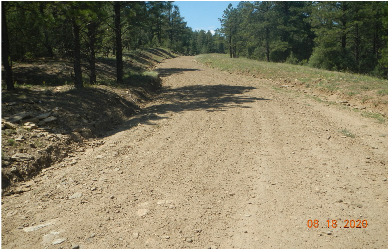
Photo 2. Facing west along the road ascending the hill. The road appears to be stabilized and maintained.