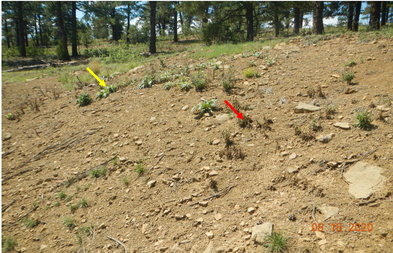
Photo 6. It appears the Canada thistle noxious weeds have been controlled this season along the cut slope however, the Hounds tongue has not been controlled.