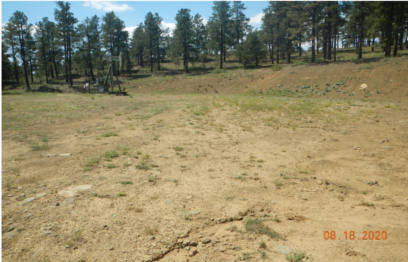
Photo 4. Facing southwest toward the location.