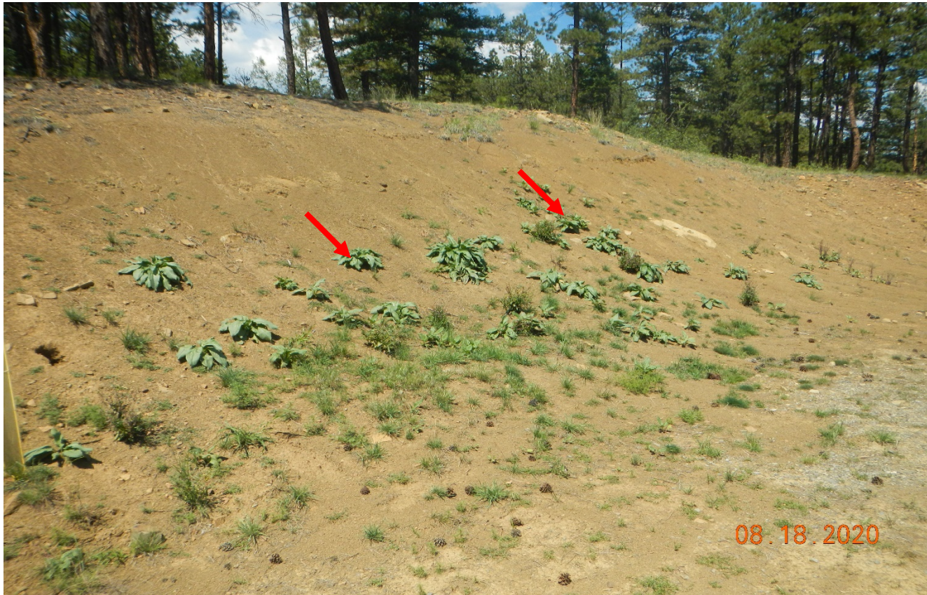
Photo 5. There are numerous noxious weeds along the cut slope that have not been controlled.