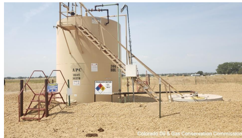
Photo 3 TB sign