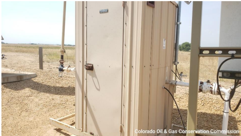
Photo 7 Gas Meter Run