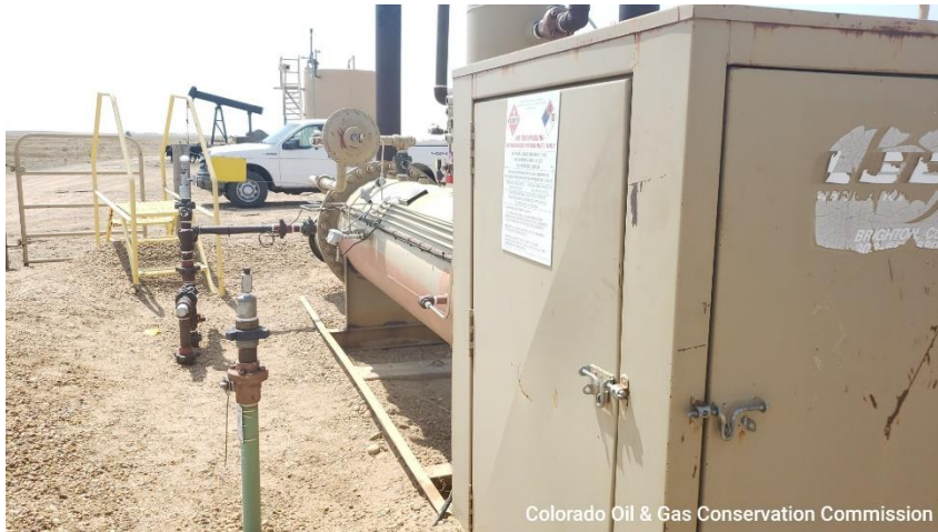
Photo 5 Horizontal Heated Separator