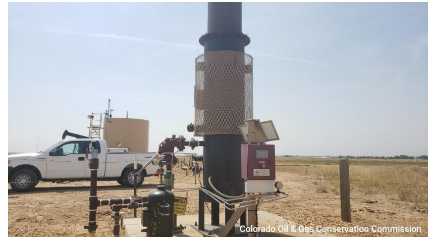
Photo 6 ECD