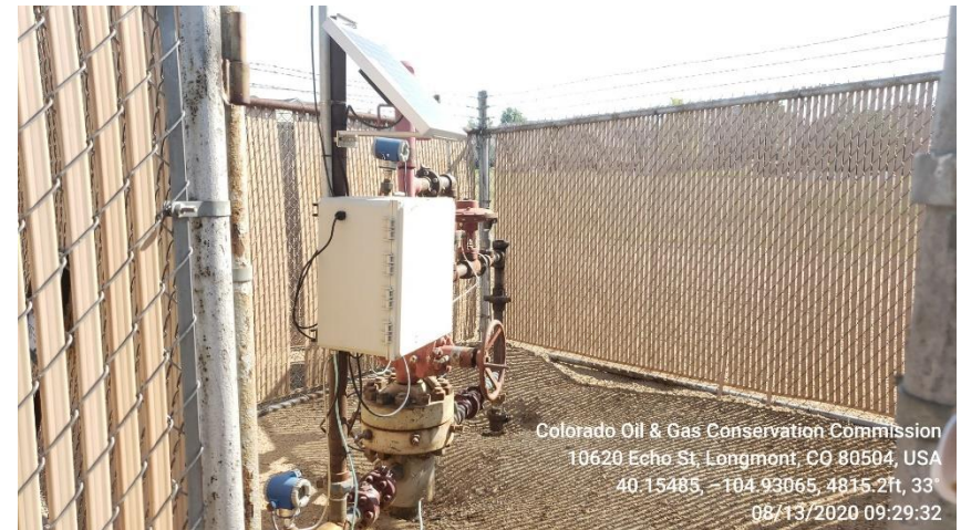
Photo 2 WH