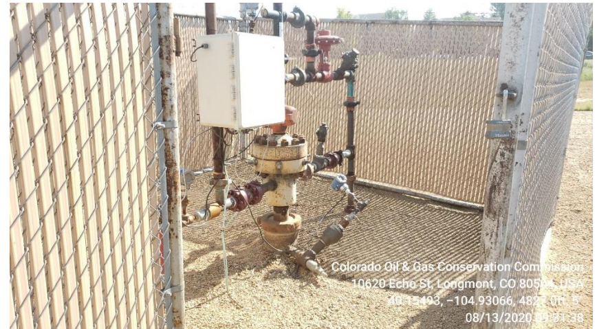
Photo 5 WH sign