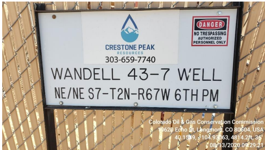
Photo 1 WH sign