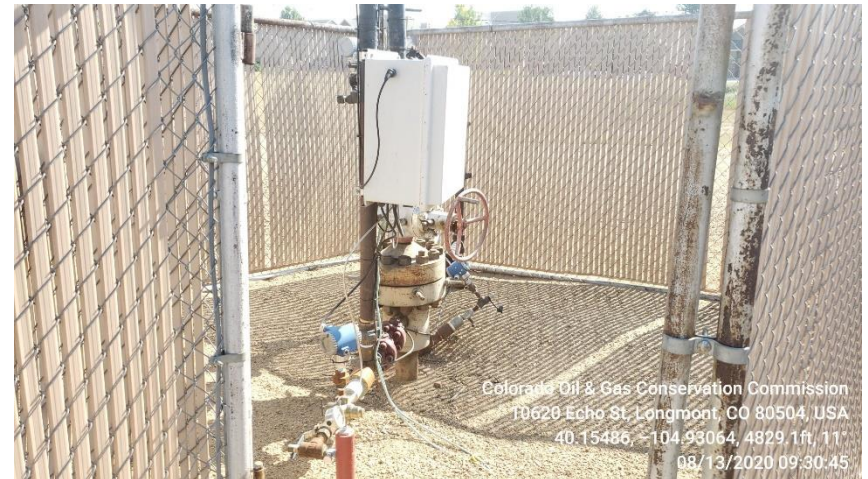
Photo 4 WH