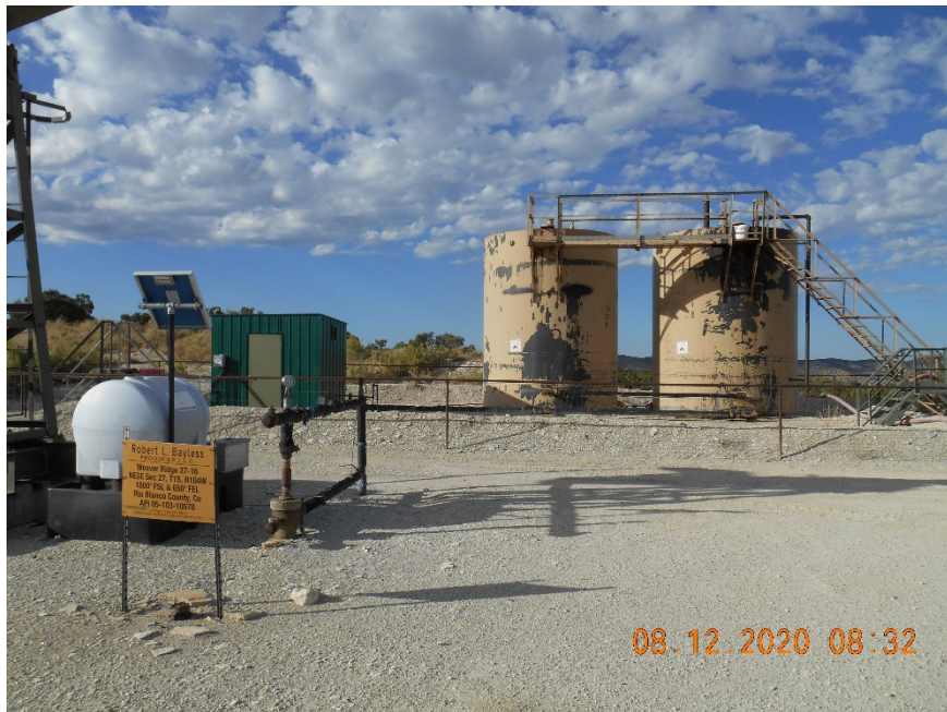
Injection wellhead with sign. Pump housing and tank battery