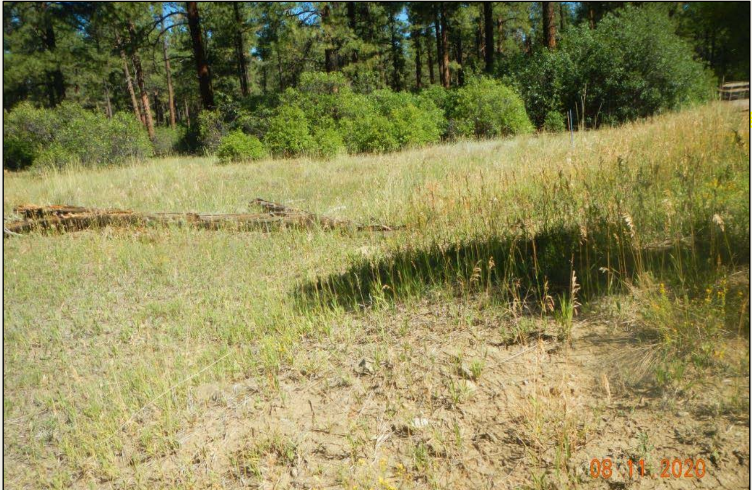
Photo 2. View of the western portion of the project area from the southwestern corner facing northward. Revegetation is progressing with western wheatgrass, and smooth brome.