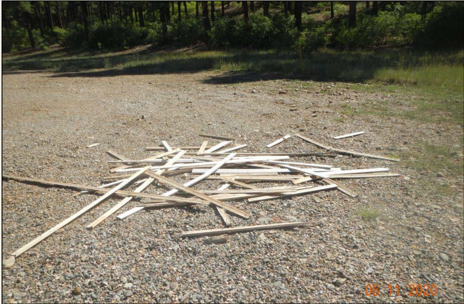
Photo 5. View of wood debris on the southern portion of the well pad.