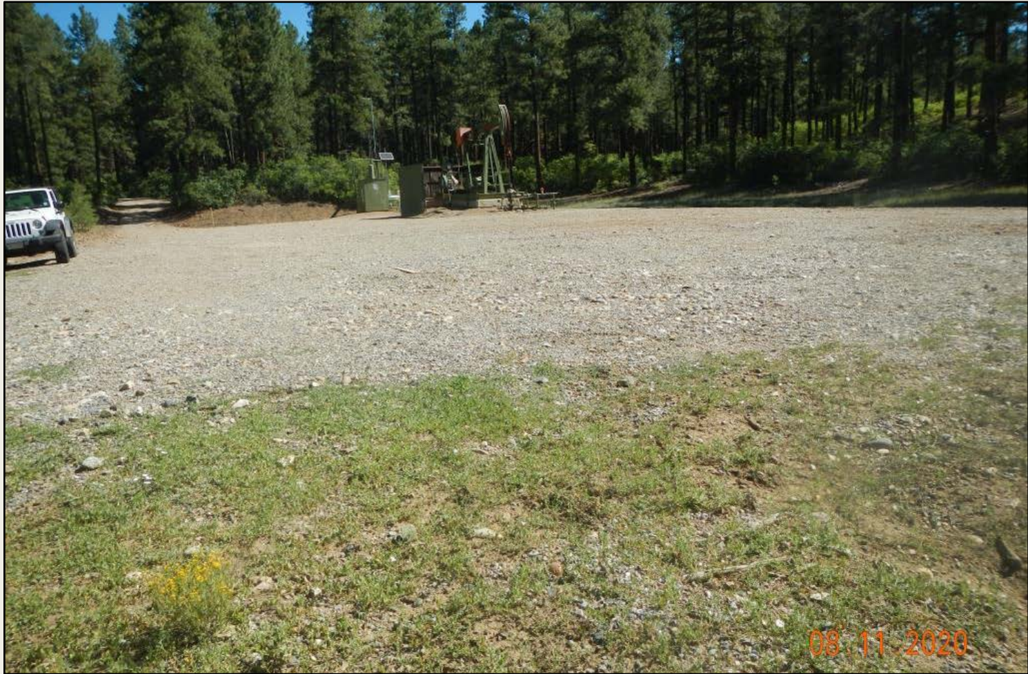
Photo 1. View of the project area from the southwestern corner facing center.