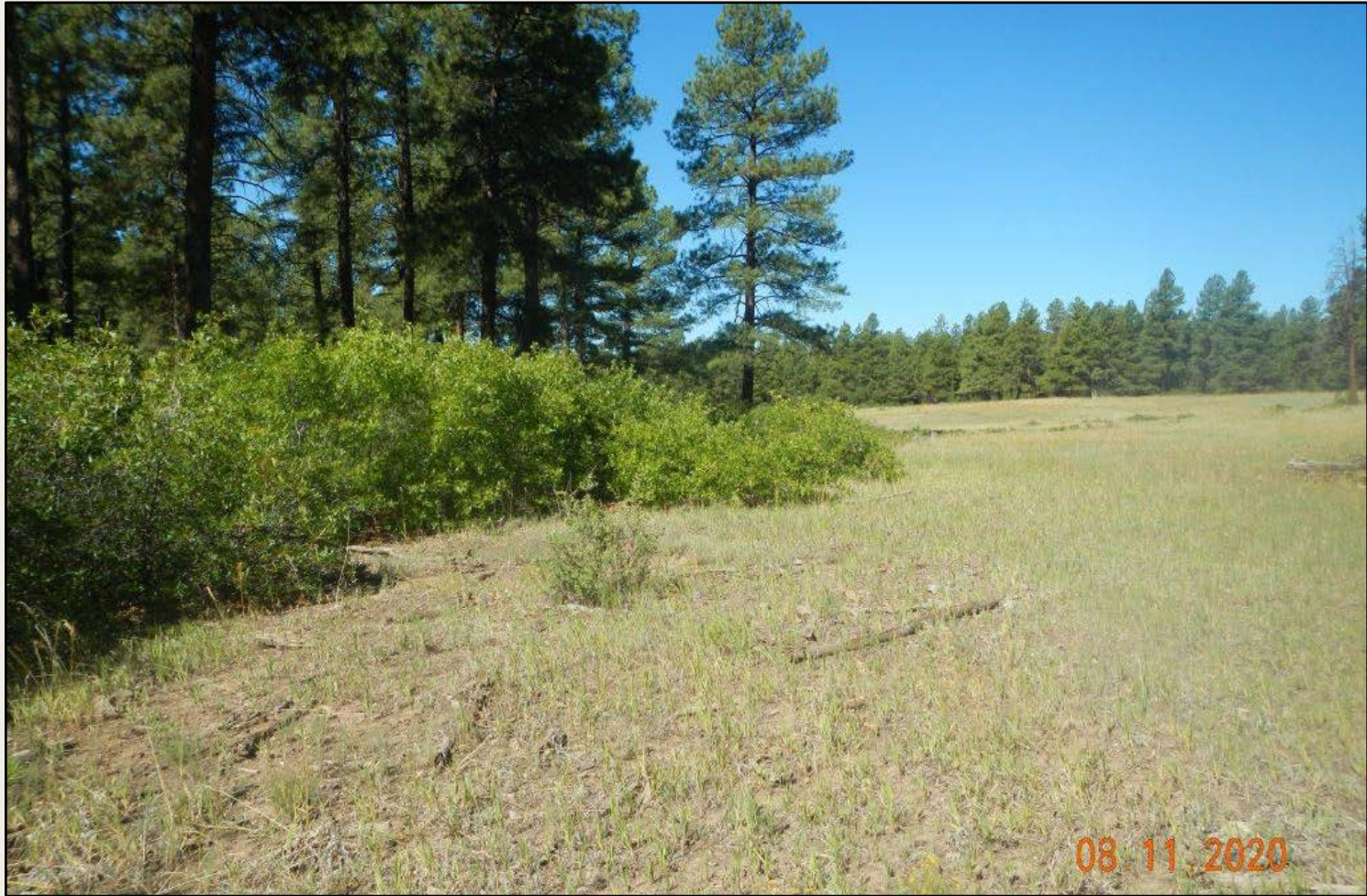
Photo 6. View of reference area comprised of ponderosa pine woodland with gambel oak understory, with a mosaic of open grassland largely comprised of smooth brome and western wheatgrass.