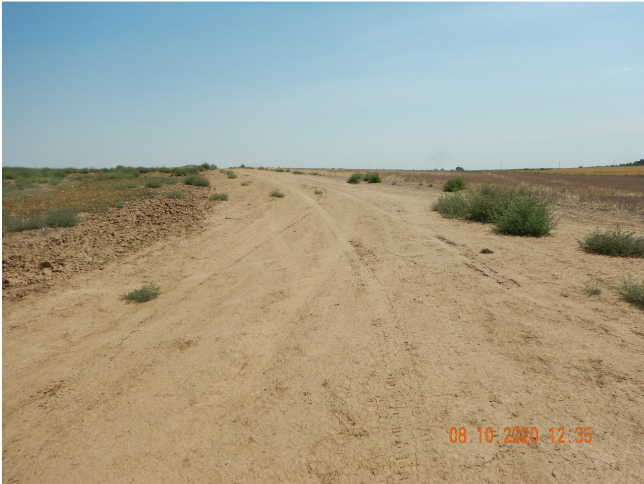
Photo 2. Photo taken from the southern location, facing East. Photo illustrates a portion of the access road may have been decompacted. Operator will remain responsible for complying with Rule 1004 for all disturbance areas - refer to Photo 3.