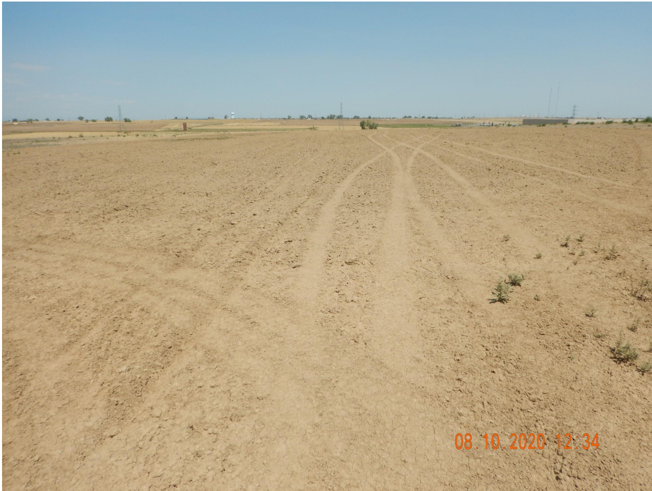
Photo 1. Photo taken from the southern location, facing North. Photo illustrates all equipment has been removed and it appears seedbed prep has been performed.