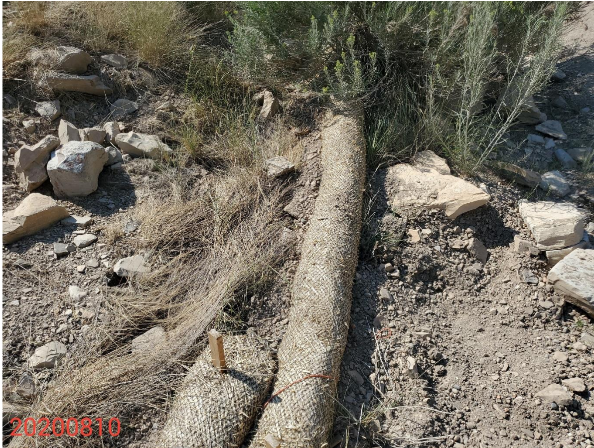
Photo 4: Photo taken from the perimeter interim areas of the Location. Photo shows wattle BMPs have been maintained in proper functioning condition.