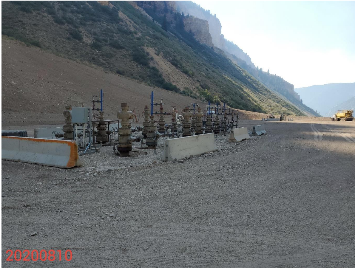
Photo 1: Photo taken from the north end of the Location, facing south. Photo shows wells on Location.