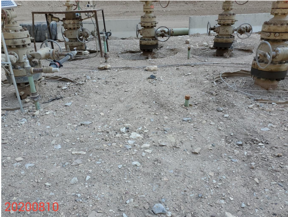
Photo 2: Photo shows riser remaining in the GPS position of the PA'd NPR H15 25C-10 596 well