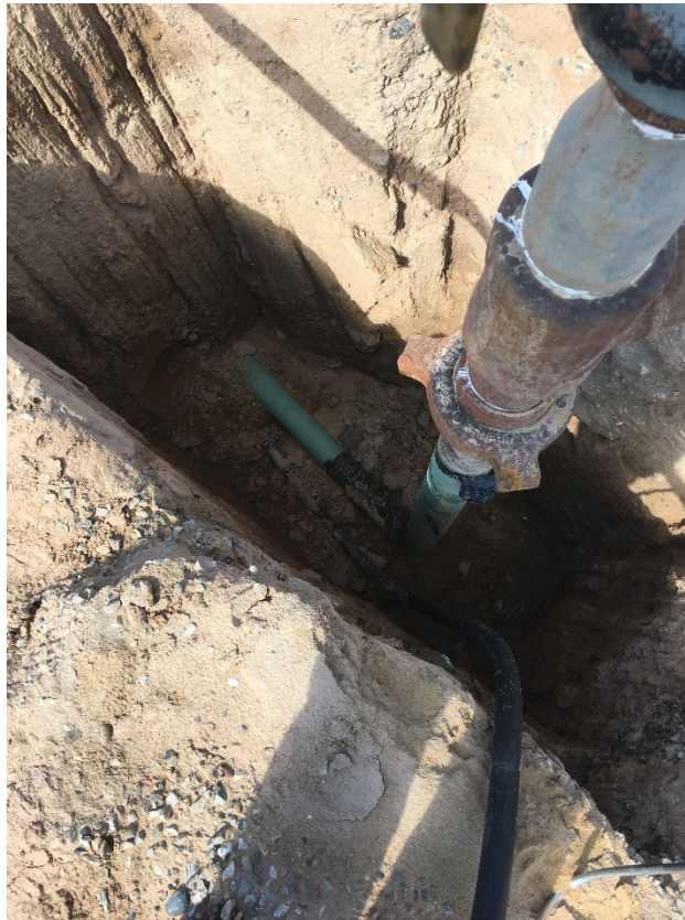
Well KEINATH 4-6 (OF4). Release point