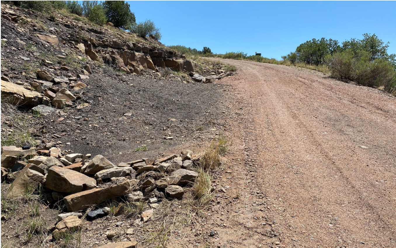
Photo 3. Facing southeast along the access road. Rock check dams have been installed along the road.