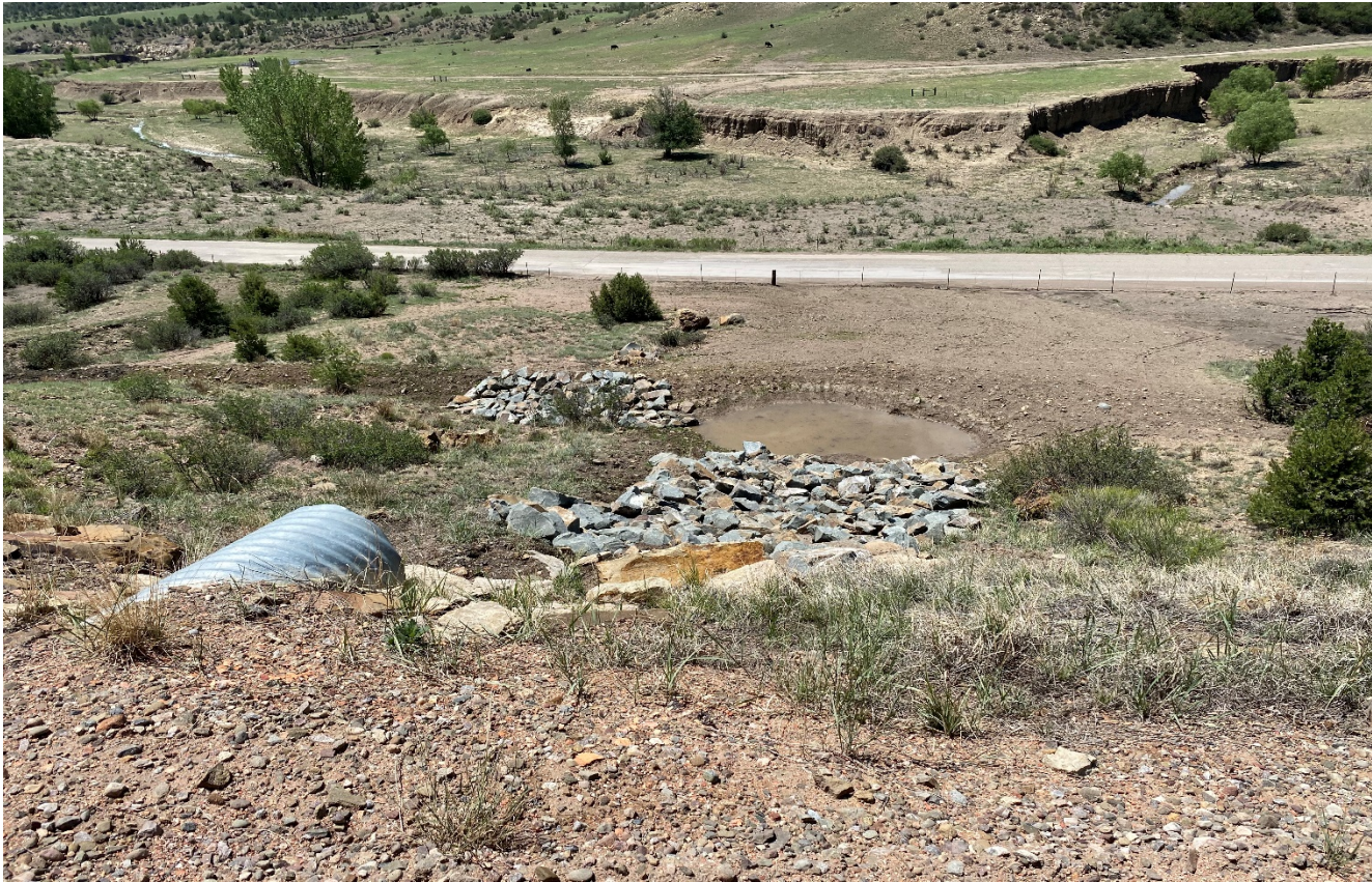
Photo 4. Facing toward the culvert outlet. The erosion from the culvert has been repaired. A sediment trap has been installed and culvert outlet protection.