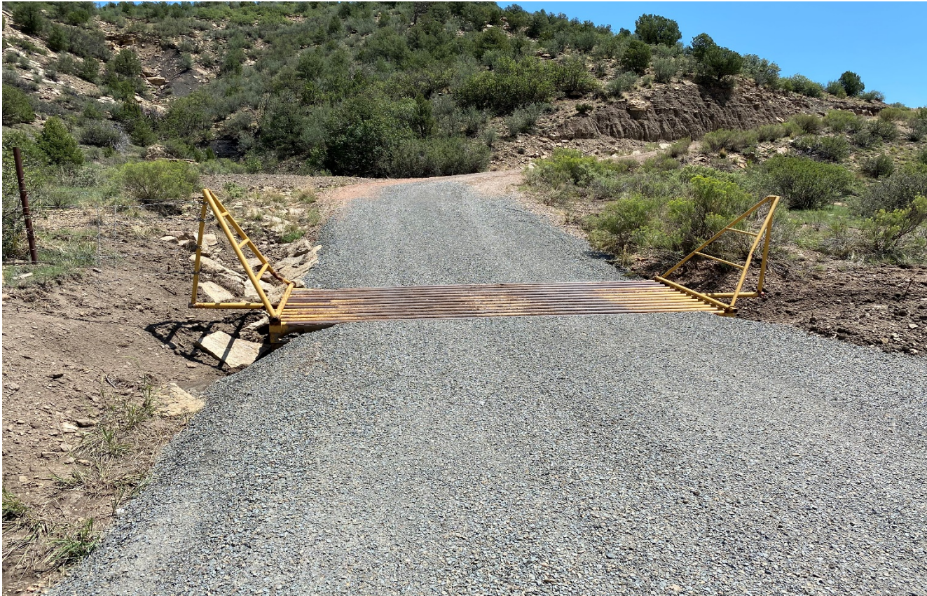
Photo 2. Facing toward the beginning of the access road. The cattle guard has been cleaned out and repaired.