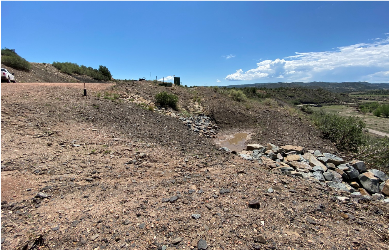
Photo 5. Facing southeast toward the location. The sediment trap has been cleaned out and maintained and rip/rap has been installed.