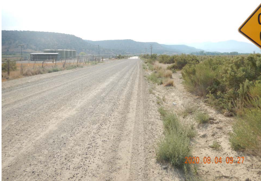
Photo #3 – View of stormwater ditch on south side of S. Dry Fork Rd, looking east.