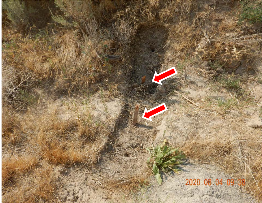
Photo #5 – Wooden stakes remaining at former hay bale installation in drainage north of S. Dry Fork Rd.