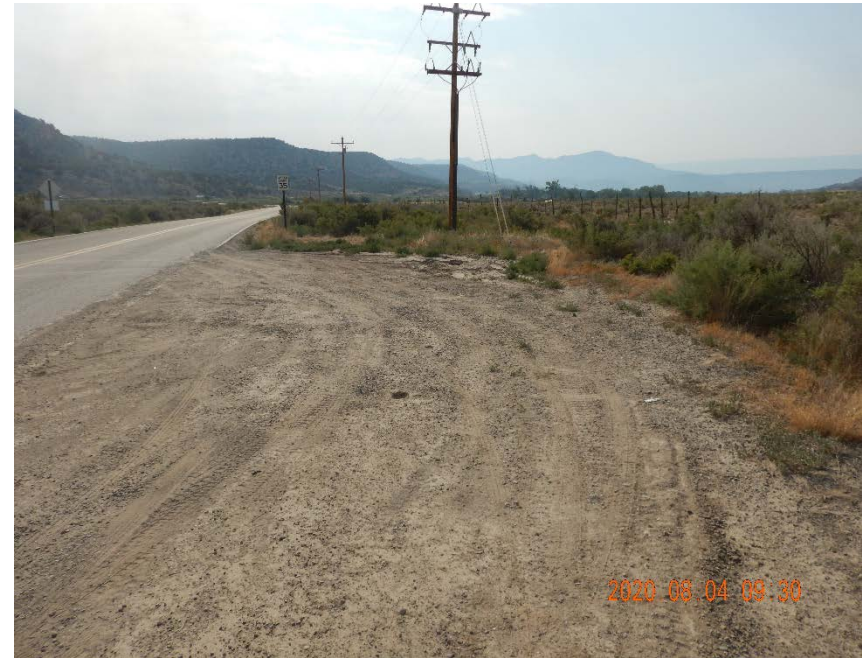
Photo #4 – View of turn-out parking area on south side of S. Dry Fork Rd, looking southeast.