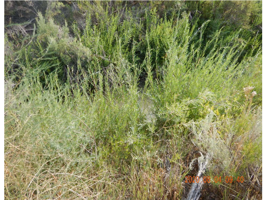
Photo #6 – Vegetation growth and flowing water in natural drainage located approximately 1000' east of valve can.