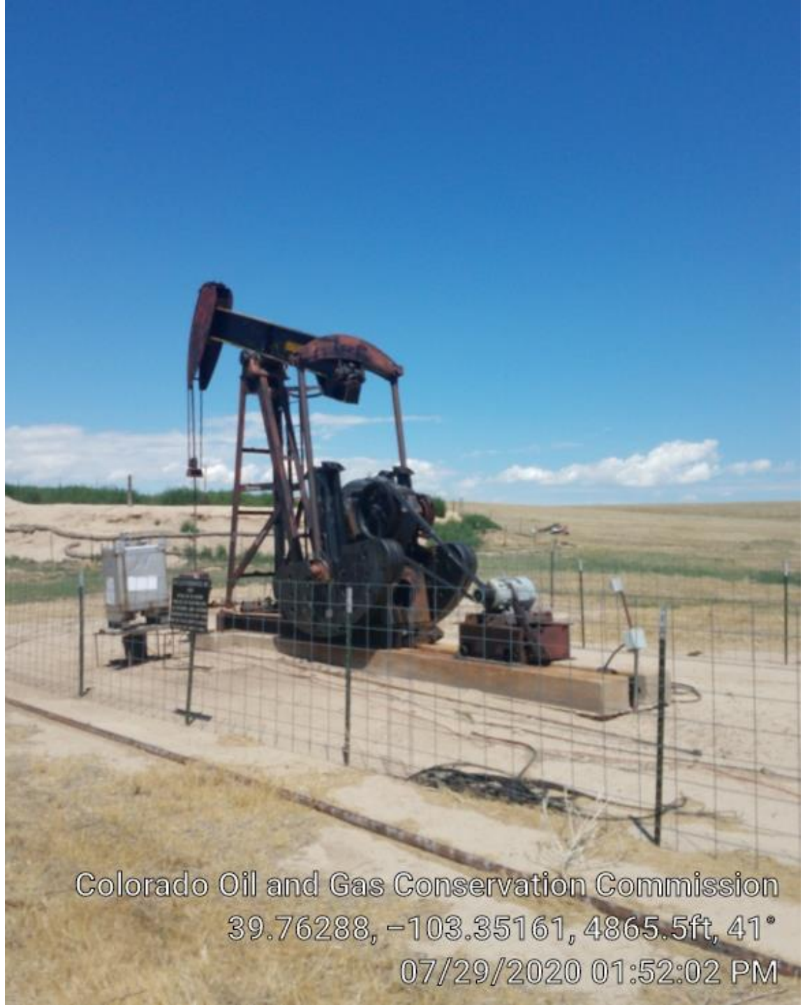
Colorado Oil and Gas Conservation Commission 39.76288, -103.35161, 4865.5ft, 41° 07/29/2020 01:52:02 PM