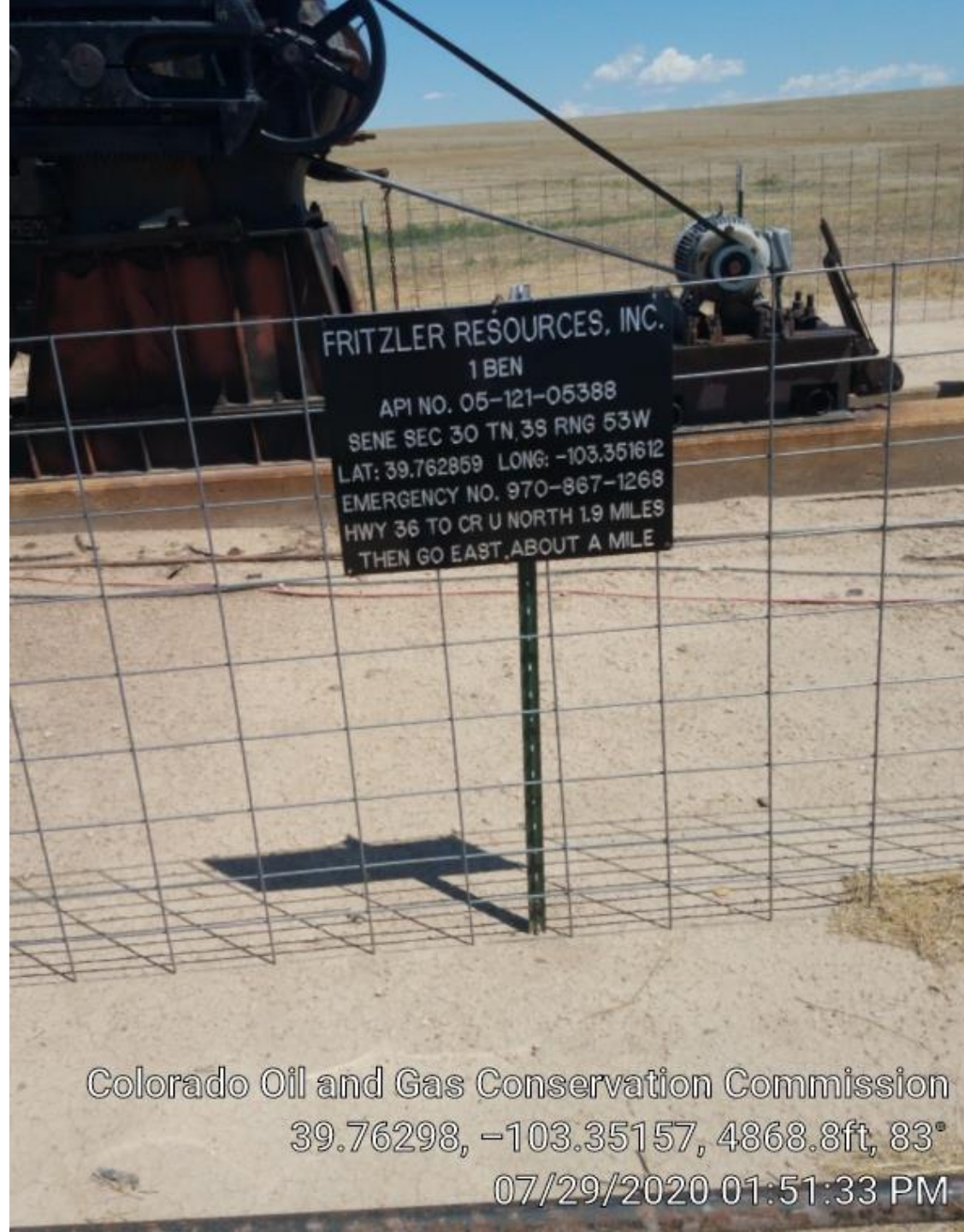
Colorado Oil and Gas Conservation Commission 39.76298, -103.35157, 4868.8ft, 83° 07/29/2020 01:51:33 PM