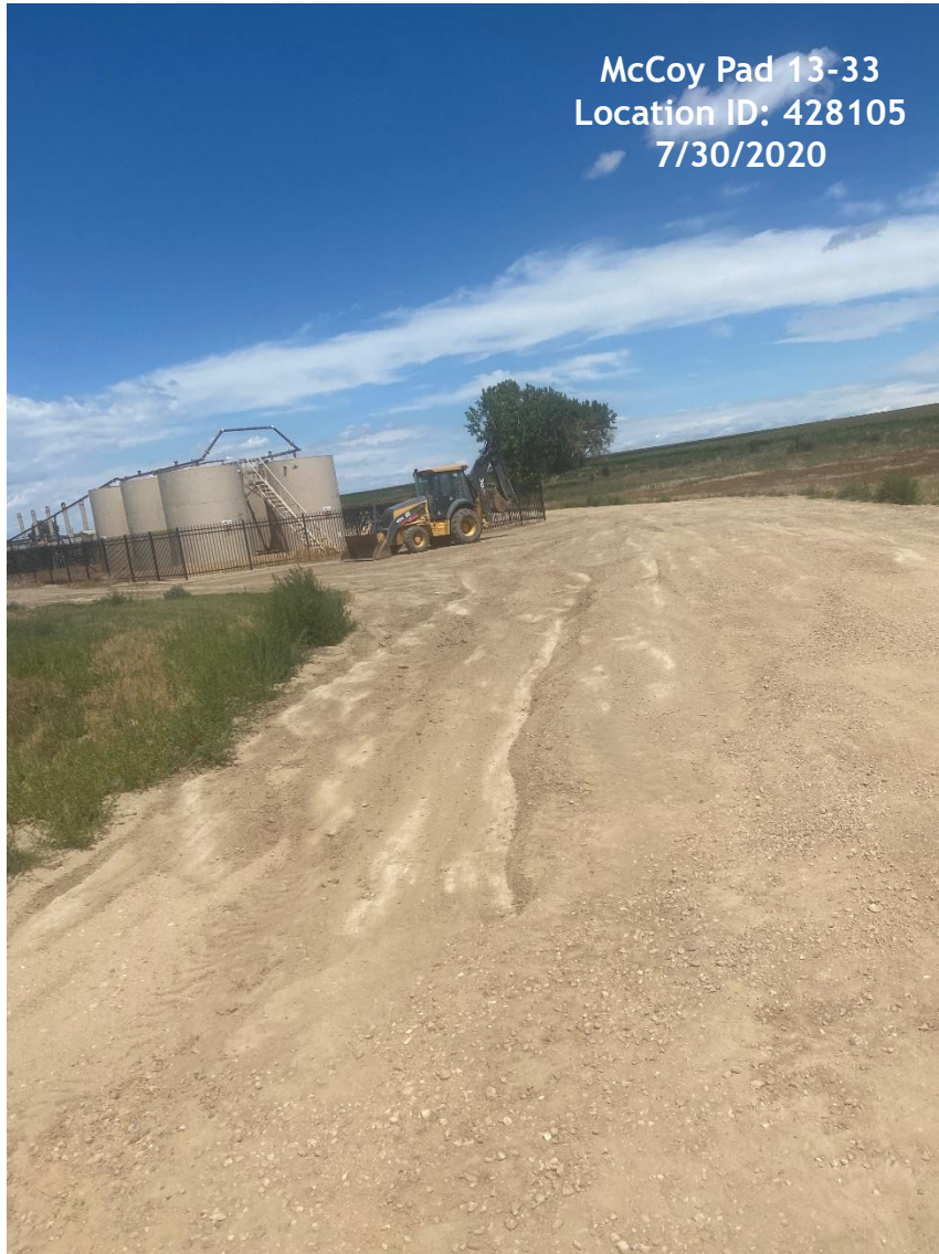
Lease road coming on to McCoy Pad 13-33 pad (looking northeast)

McCoy Pad 13-33 Location ID: 428105 7/30/2020