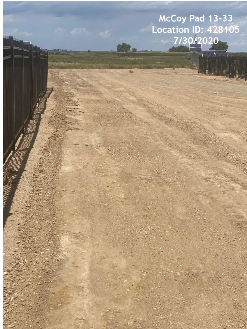
Pad area between wellheads and separators (looking north)

McCoy Pad 13-33 Location ID: 428105 7/30/2020