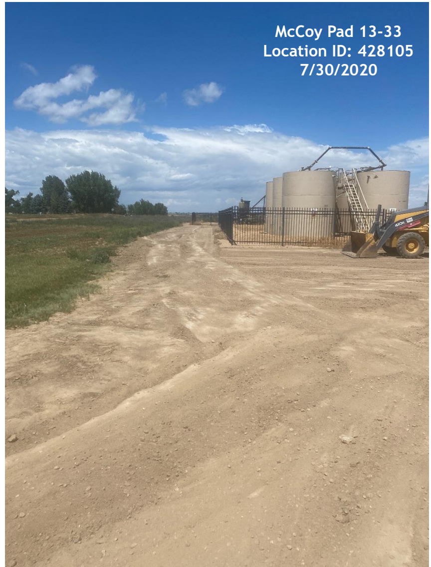
Graded drive west of tank battery (looking north)

McCoy Pad 13-33 Location ID: 428105 7/30/2020