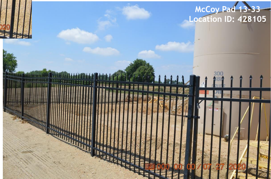
McCoy Pad 13-33 Location ID: 428105

Mountain West Vegetation Management Inc. sprayed location weeds on June 10, 2020