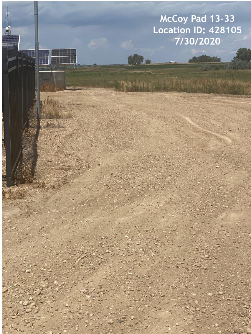
Pad area east of wellheads (looking north)

McCoy Pad 13-33 Location ID: 428105 7/30/2020