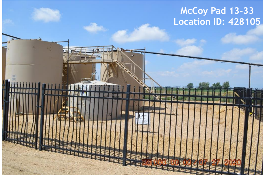
McCoy Pad 13-33 Location ID: 428105

Mountain West Vegetation Management Inc. sprayed location weeds on June 10, 2020