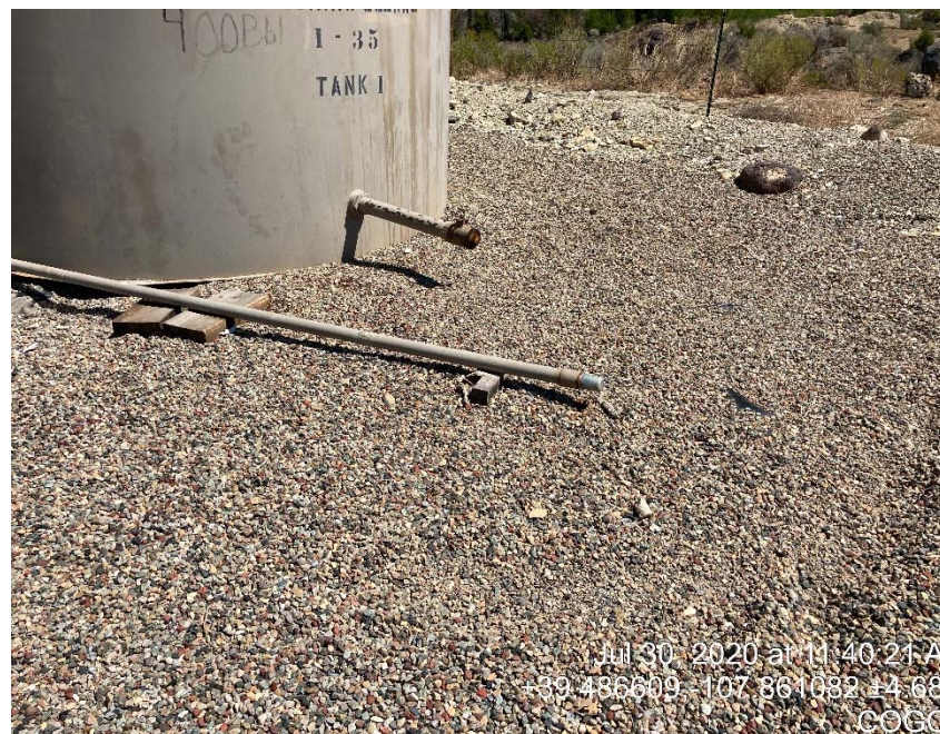
Follow up inspection