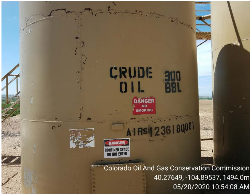
Crude oil tank placards on 5/20/2020