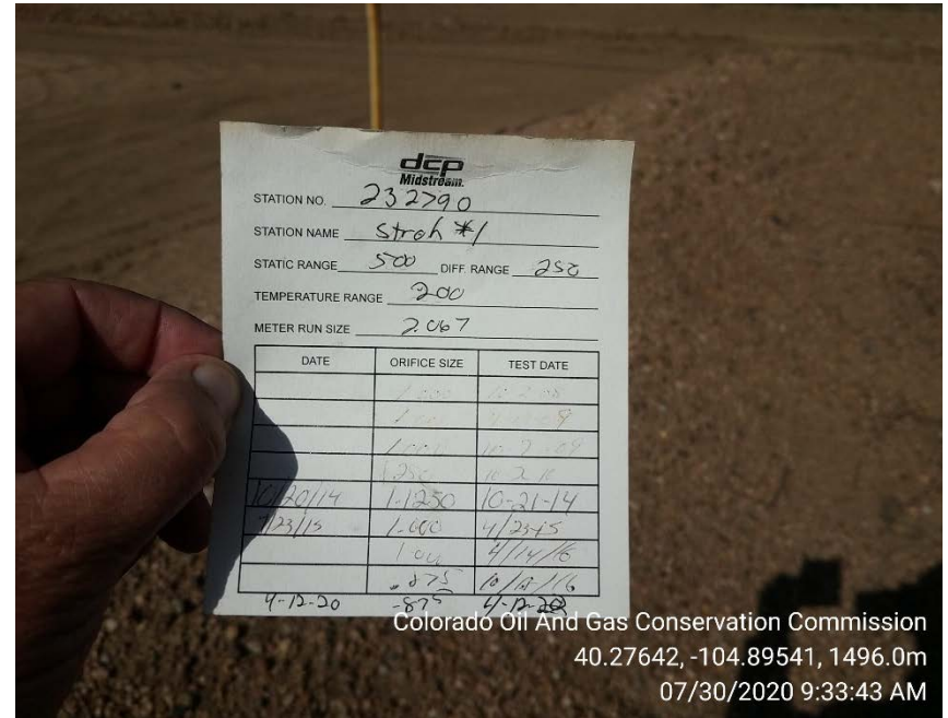
Calibration card on 7/30/2020