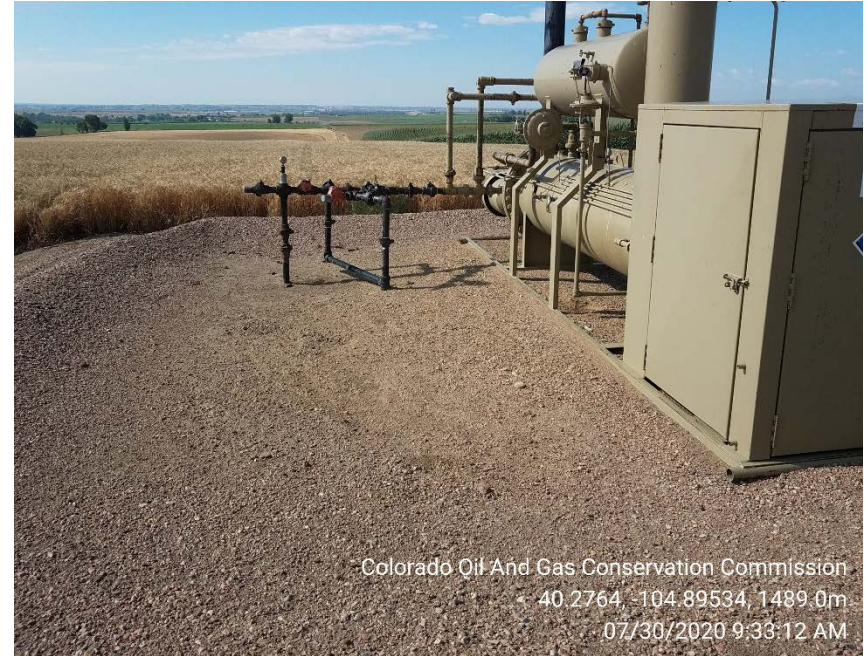
Trash on 7/30/2020