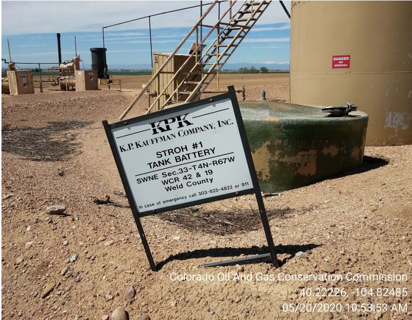
Colorado Oil And Gas Conservation Commission 40.22226, -104.82485 05/20/2020 10:53:53 AM