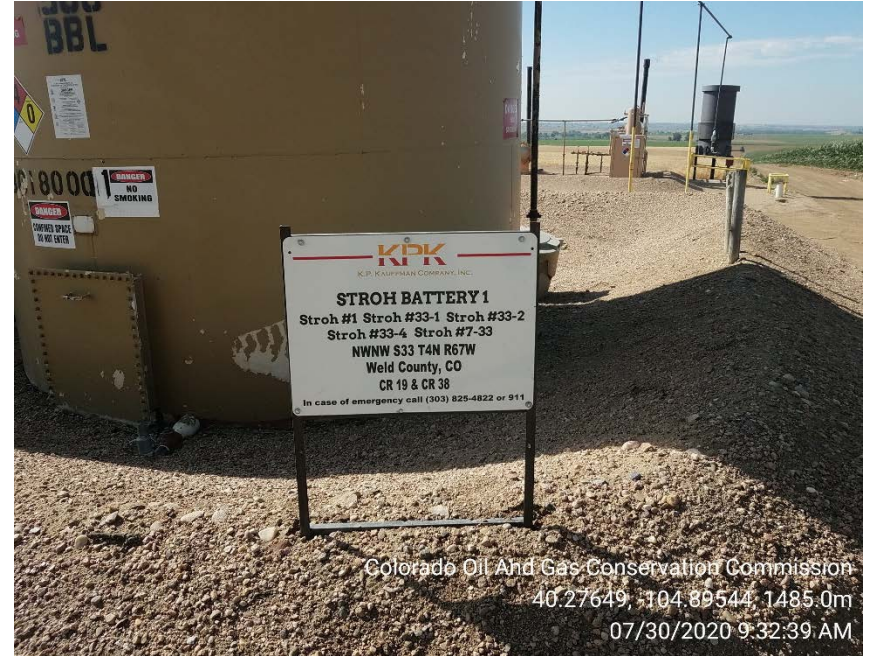
Colorado Oil And Gas Conservation Commission 40.27649, -104.89544, 1485.0m 07/30/2020 9:32:39 AM