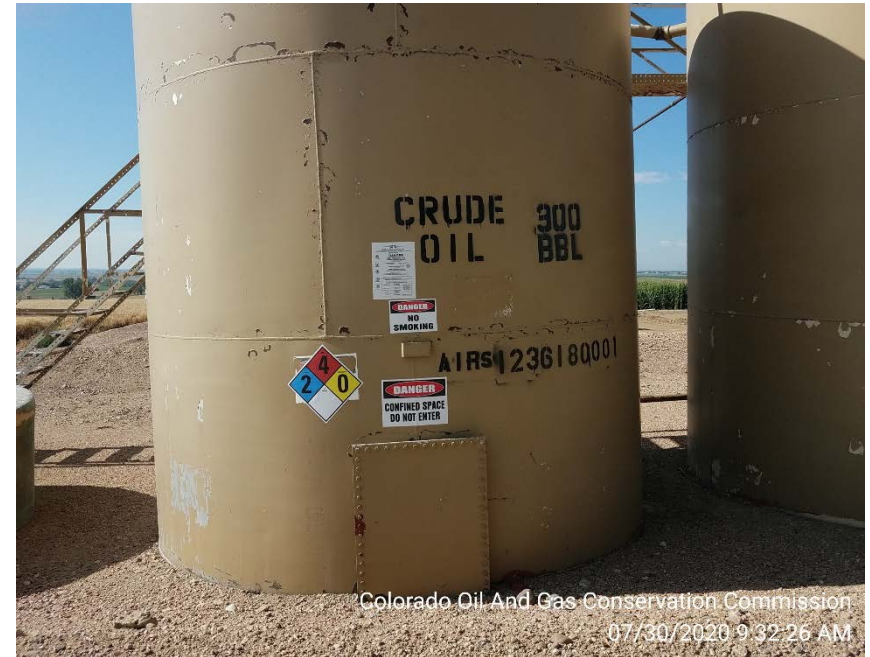
Crude oil tank placards on 7/30/2020