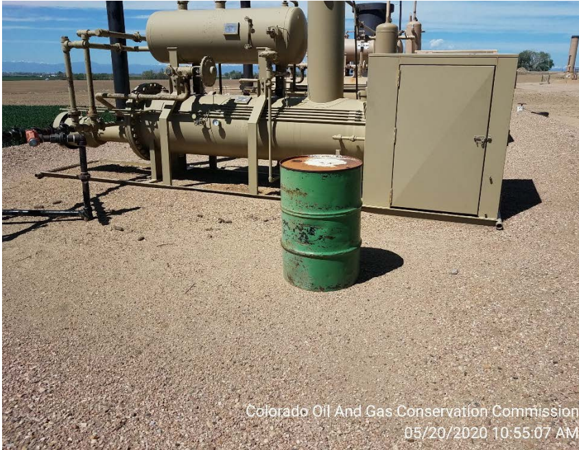
Trash on 5/20/2020