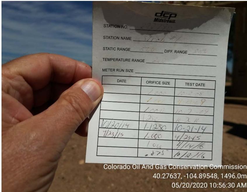
Calibration card on 5/20/2020