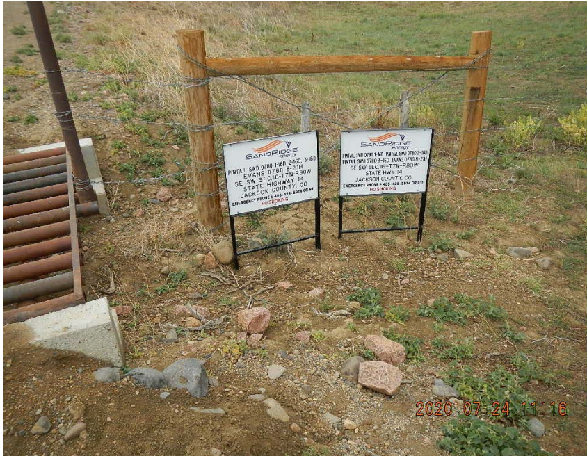
Sign at entrance to Location ID: 446527.

Location Name: Pintail SWD Location ID 446527; Spill ID 477094