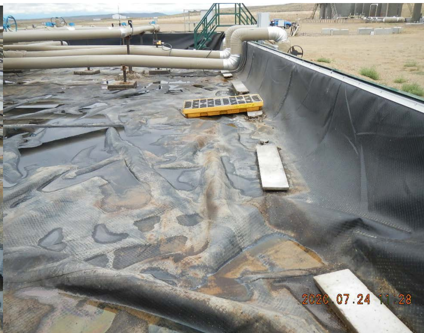
Concrete weight/anchor with other debris on liner with the potential to puncture or compromise liner. Note how liner is wind blown with folds.