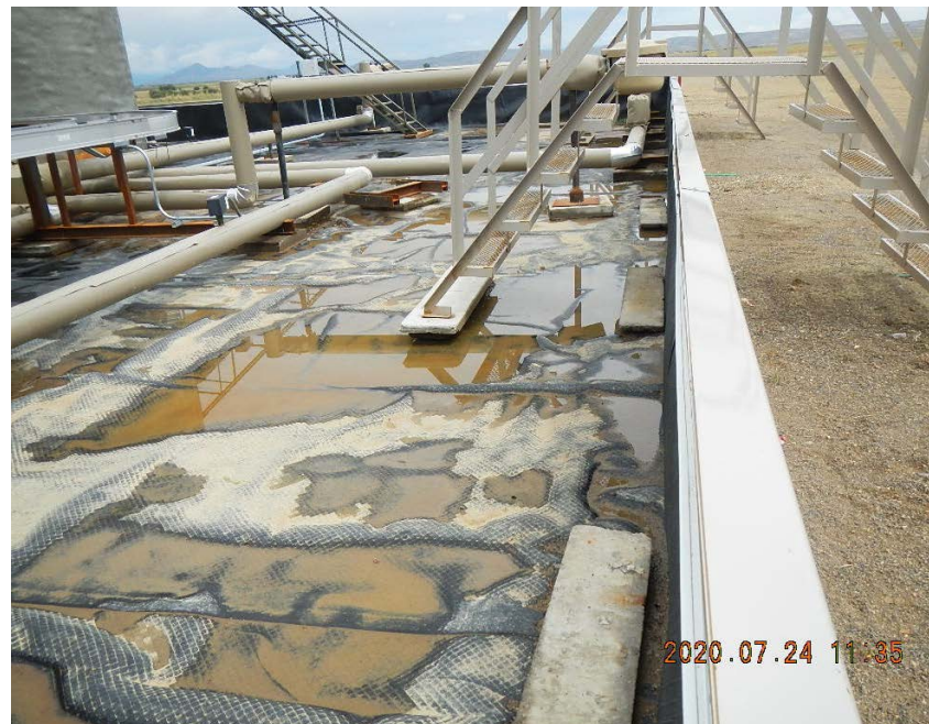
Salt staining and trash/debris has been addressed from the June 20, 2020 inspection.