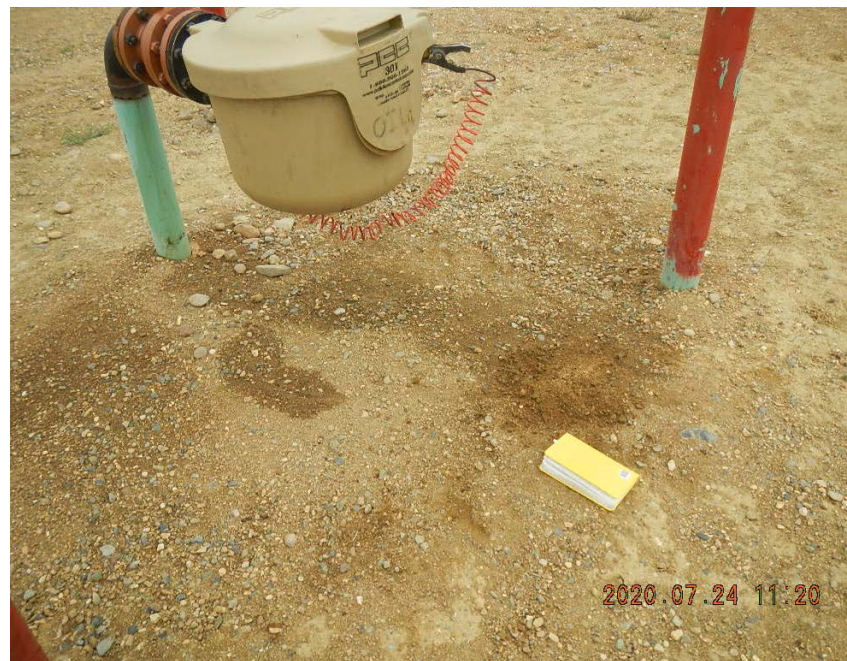
Surface staining at load out. Hydrocarbon odor noted with apparent wood fiber mixed into soil.