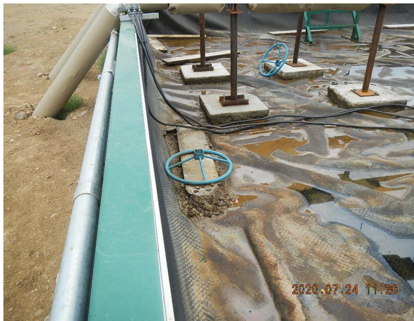
Concrete weight/anchor with rebar and valve handles with potential to puncture or compromise liner.

Location Name: Pintail SWD Location ID 446527; Spill ID 477094