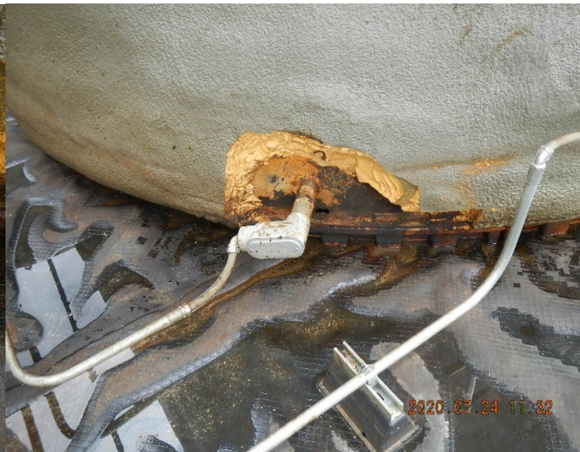
Approximate 1"x 1.5" hole in tank.