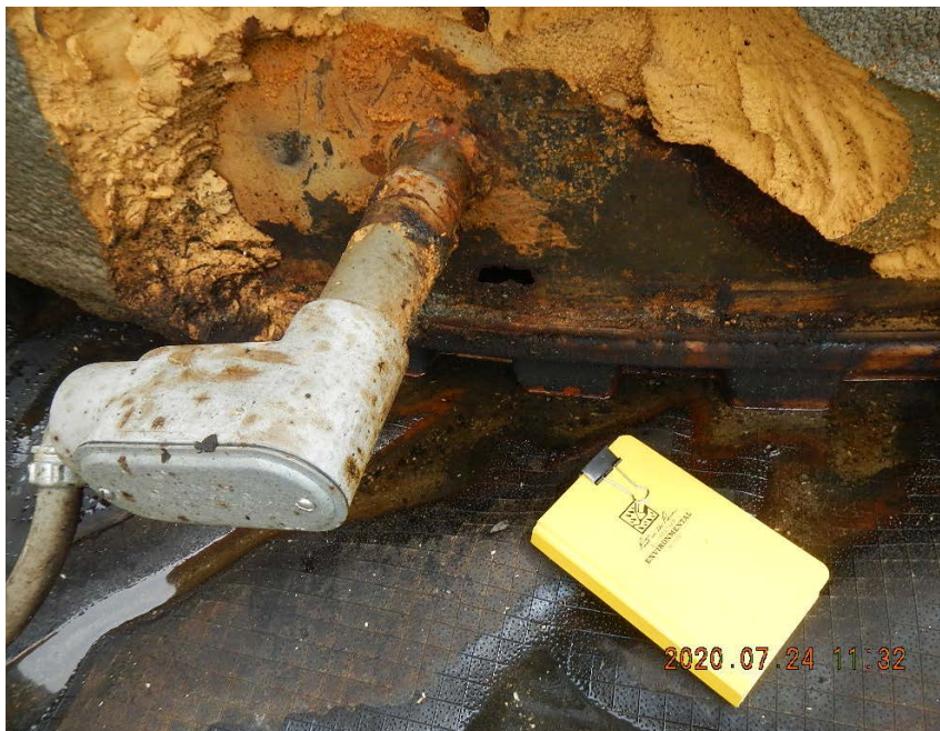
Approximate 1"x 1.5" hole in tank.

Location Name: Pintail SWD Location ID 446527; Spill ID 477094