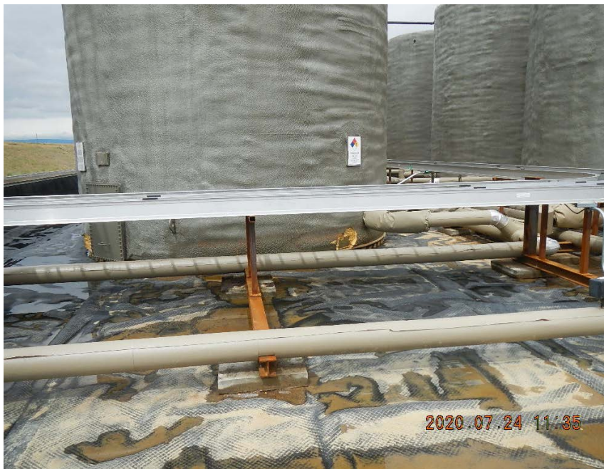
Insulation removed exposing Tank # 0601 surface.

Location Name: Pintail SWD Location ID 446527; Spill ID 477094