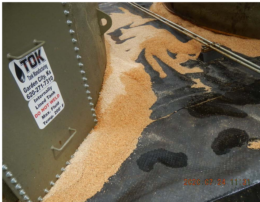
Absorbent material at the base of tanks.

Location Name: Pintail SWD Location ID 446527; Spill ID 477094