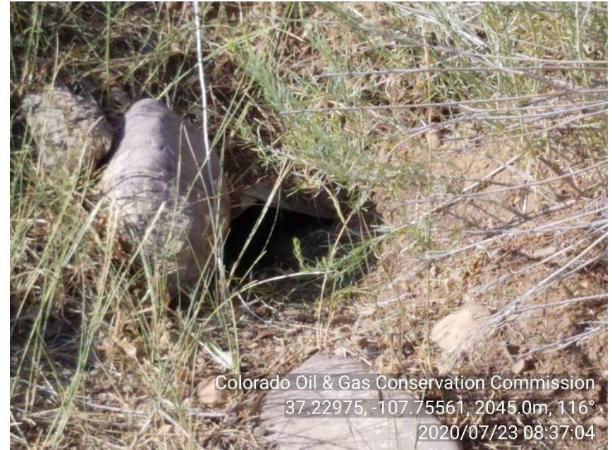
PHOTO 8: AN IMAGE OF THE OTHER SIDE OF CULVERT MENTIONED IN PHOTO 7.