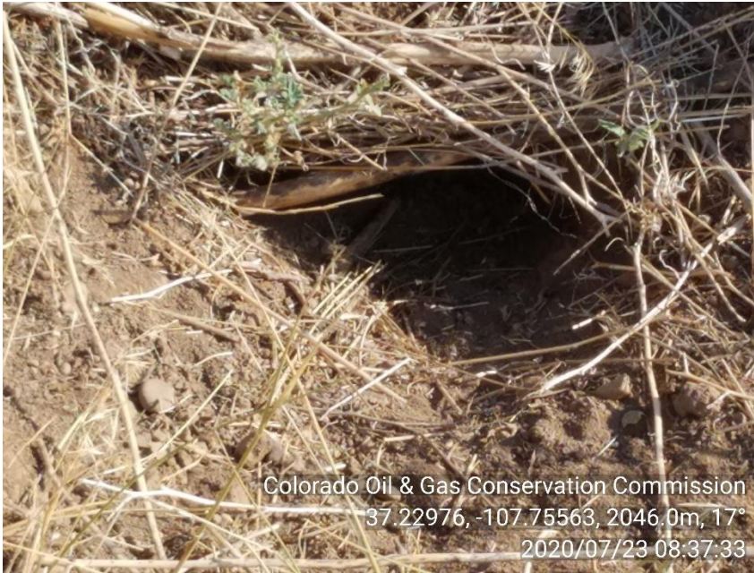
PHOTO 9: PHOTO OF THE CULVET JUST DOWN GRADE OF CULVERT IN PHOTO 7. FOLLOW CA LISTED ON PHOTO 7.