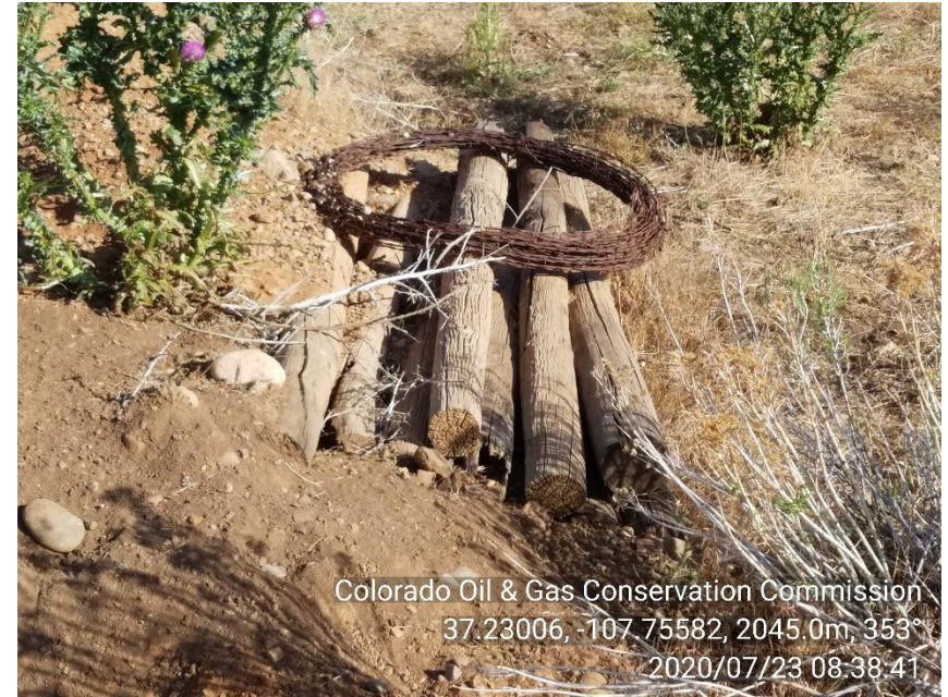
PHOTO 10: UNUSED EQUIPMENT STORED JUST OVER BERM ON INTERIM RECLAMATION AREA. REMOVE UNUSED EQUIPMENT, COMPLY WITH RULE 603.f. CA DATE 10-23-20.