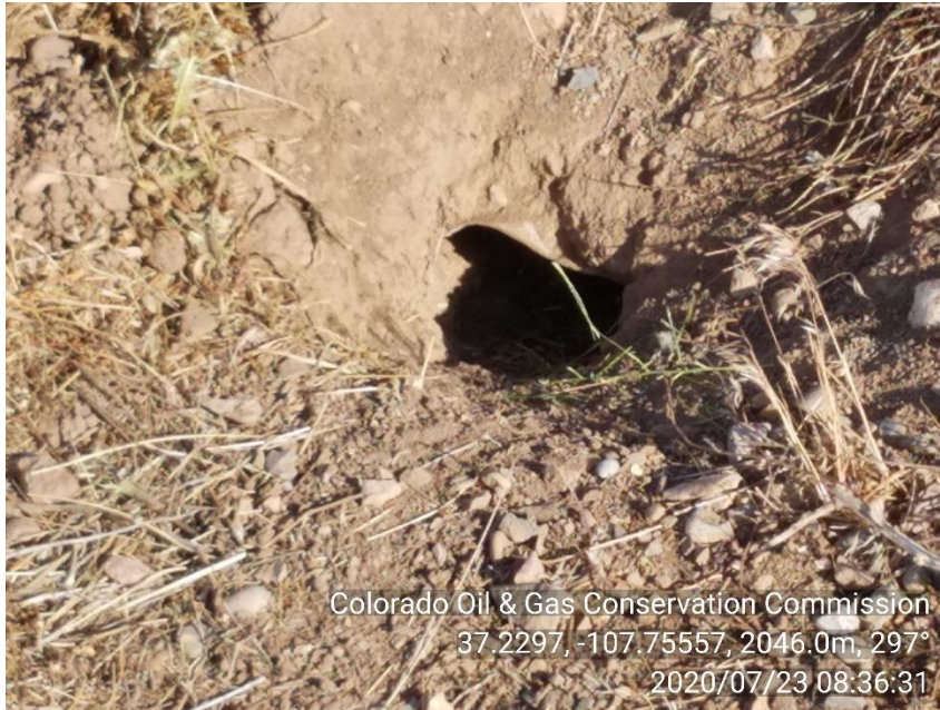
PHOTO 7: CULVERT AT ENTRANCE OF LOCATION IS ALMOST PLUGGED COMPLETELY. CLEAN AND MAINTAIN CULVERT IN ORDER TO PREVENT BREAKDOWN OF BMP'S. Install or repair required BMPs per Rule 1002.f.(2)C. CA DATE 10-23-20