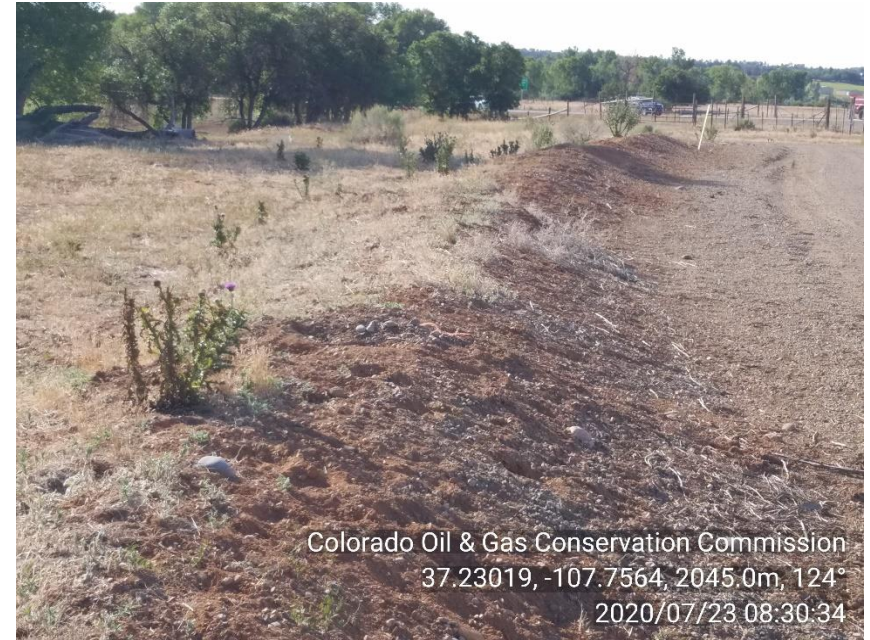
PHOTO 3: MATURE FLOWERING NOXIOUS WEEDS (THISLE) AROUND LOCATION ON THE INTERIM RECLAMATION AREA. CONTROL WEEDS (CA DATE REMAINS THE SAME AS PREVIOUS INSPECTION DOC#693901263 5-1-20