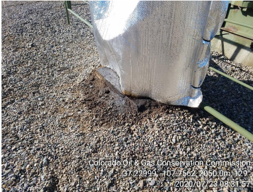
PHOTO 5: Natural gas powered engine exhaust is impacting soil/gravel around area of muffler.

Remove stained soil/gravel and dispose. Comply with Rule 1102.f.(2) for best self inspection, maintenance and housekeeping to prevent breakdown or failure of BMP's. ca date 10-23-20.