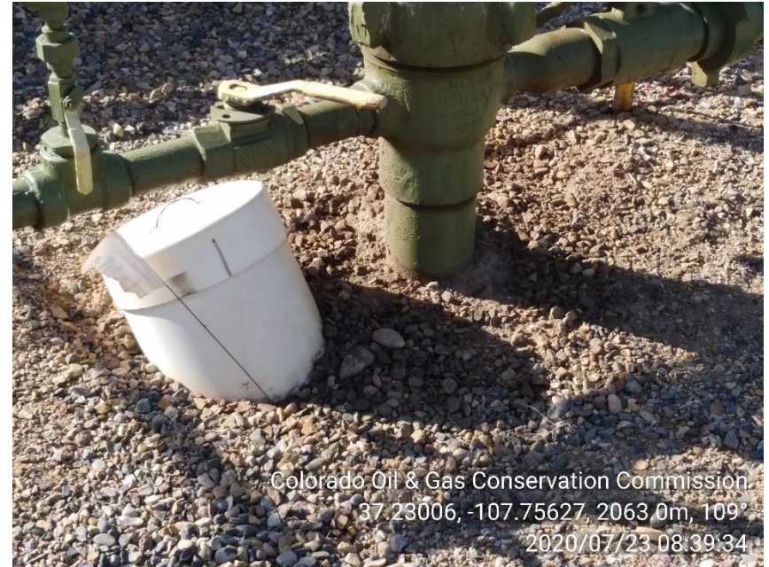
PHOTO 4: Approx 2' x 2' area of stained soil/gravel around base of wellhead. Clean-up and dispose of stained soil/gravel per Rule 1102.f.(2) and Rule 907.e. ca date 10-23-20.

Remove stained soil/gravel and dispose. Comply with Rule 1102.f.(2) for best self inspection, maintenance and housekeeping to prevent breakdown or failure of BMP's. ca date 10-23-20.