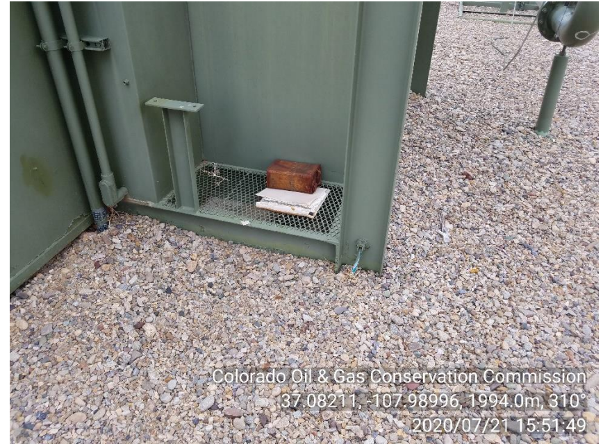
PHOTO 4: TRASH ON LOCATION. REMOVE ALL TRASH ON AND AROUND LOCATION COMPLY WITH RULE 603.f. CA DATE 10-21-20