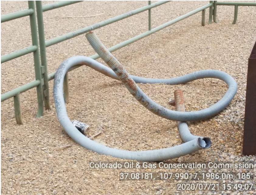
PHOTO 3: UNUSED EQUIPMENT STORED ON LOCATION. REMOVE UNUSED EQUIPMENT COMPLY WITH RULE 603.f. CA DATE 10-21-20