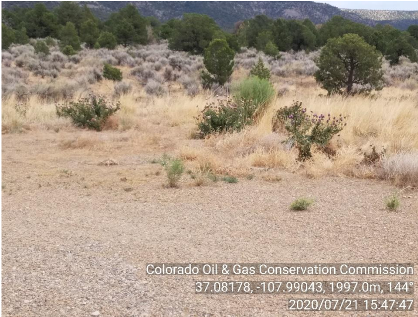
PHOTO 5: NOXIOUS WEEDS AROUND THE EDGES OF LOCATION. REMOVE WEEDS COMPLY WITH RULE 603.f. CA DATE 10-21-20