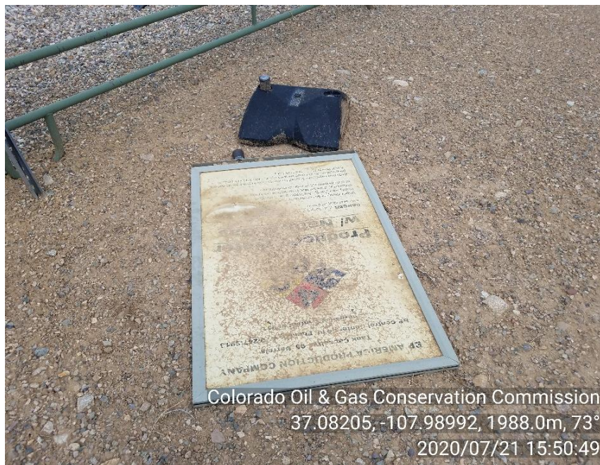
Colorado Oil & Gas Conservation Commission 37.08205, -107.98992, 1988.0m, 73° 2020/07/21 15:50:49

PHOTO 7: SIGN BROKE AND LYING ON THE GROUND ALSO THERE IS NO TANK CAPASITY POSTED ON OR NEAR PRODUCED WATER TANK. POST SIGN IN ACCORDANCE WITH RULE 210.b. CA DATE 10-21-20.