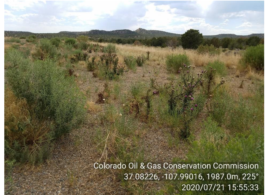
PHOTO 6: ANOTHER IMAGE OF NOXIOUS WEEDS AROUND LOCATION. REMOVE WEEDS COMPLY WITH RULE 603.f. CA DATE 10-21-20