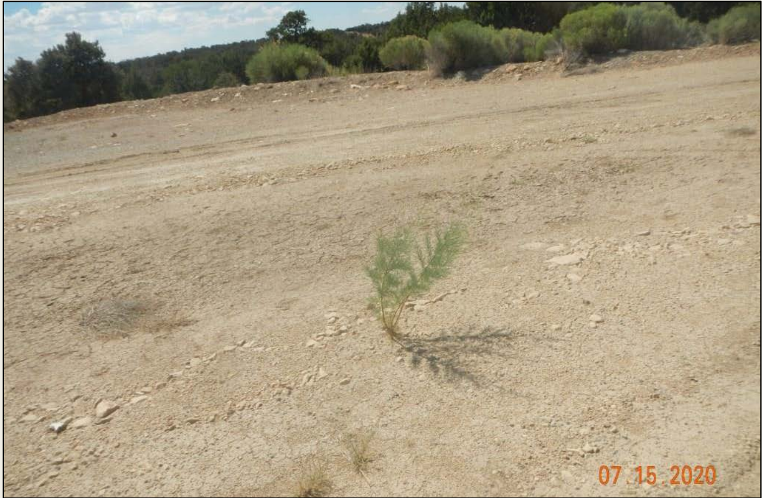
Photo 5. View of young salt cedar tree becoming established on the well pad.