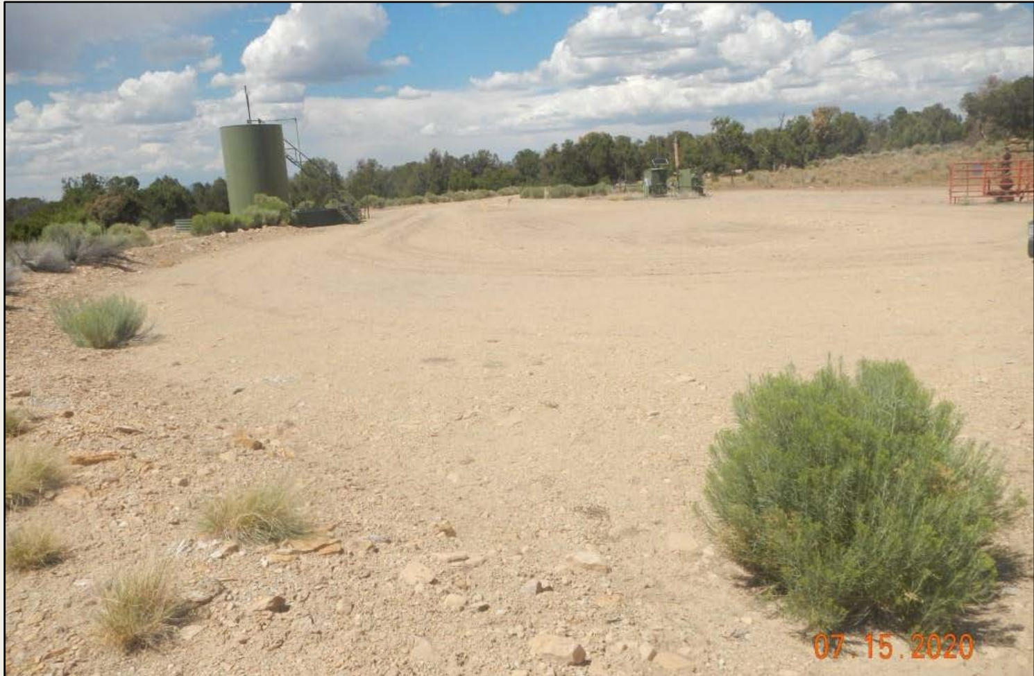
Photo 1. View of the project area from the southwestern corner facing center.