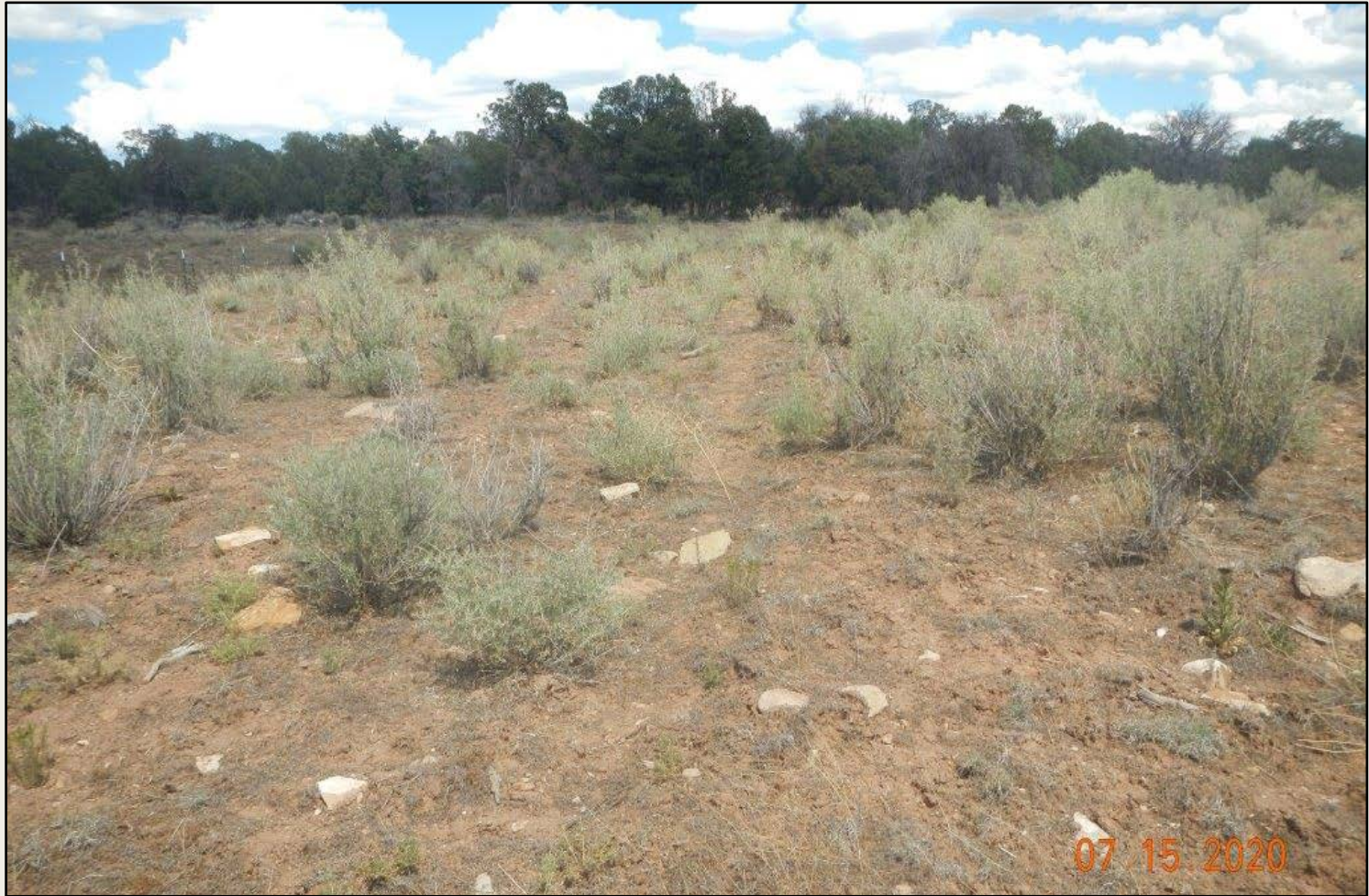
Photo 3. View of the southern project area from the southwestern corner facing eastward.