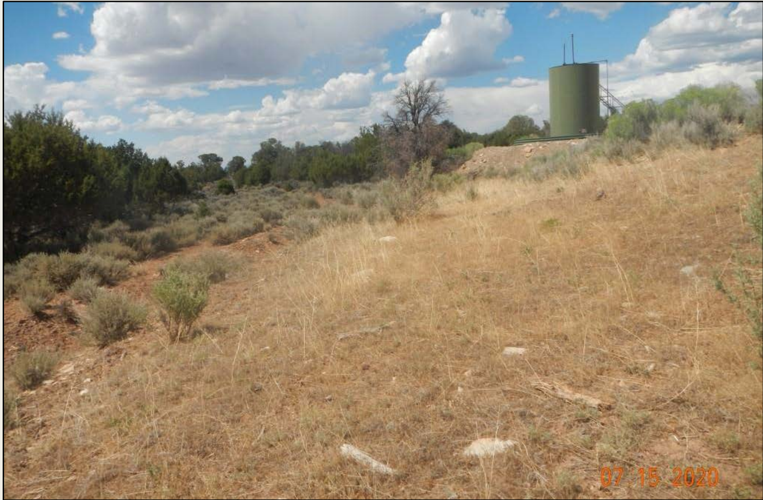
Photo 2. View of the western project area from the southwestern corner facing northward. Revegetation is progressing and is comprised of grasses and shrubs such as western wheatgrass, blue grama, and fourwing saltbush, as well as weeds such as cheatgrass.