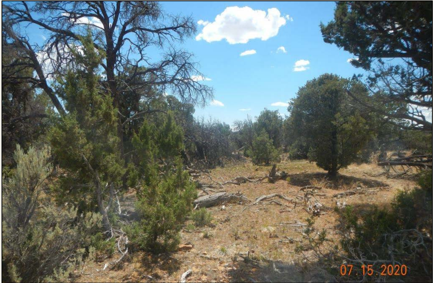
Photo 6. View of reference area comprised of pinyon and juniper woodland with understory of big sagebrush, blue grama, and sand heath.