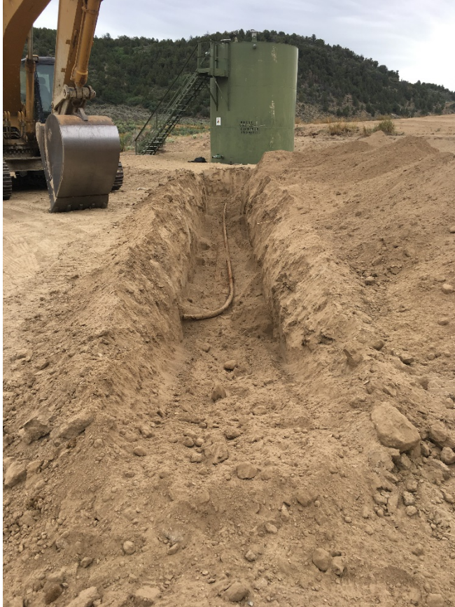
2" flowline in excavation ditch