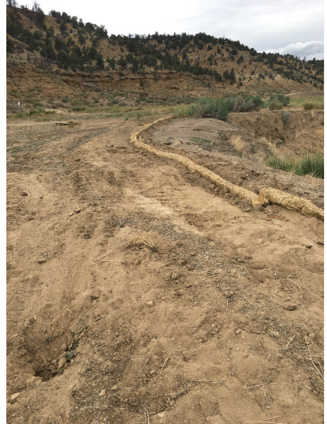
Stormwater BMP's installed