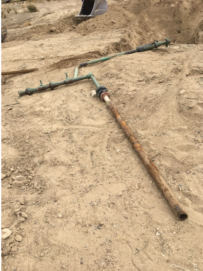
2" removed risers