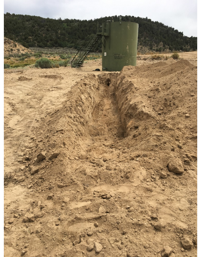
Flowline removed from excavation ditch