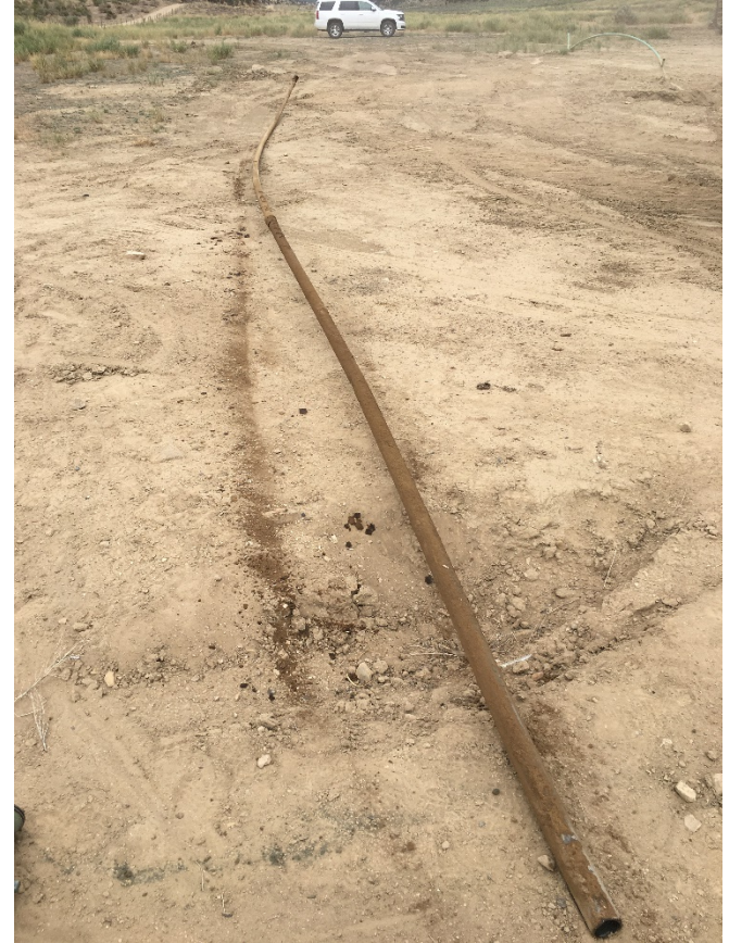
Flowlines removed from excavation