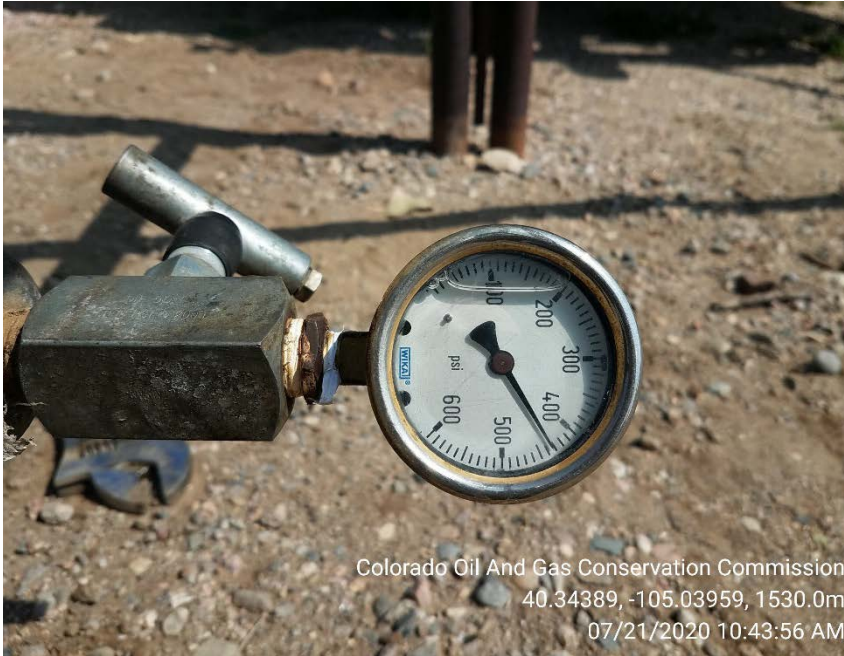
Colorado Oil And Gas Conservation Commission 40.34389, -105.03959, 1530.0m 07/21/2020 10:43:56 AM