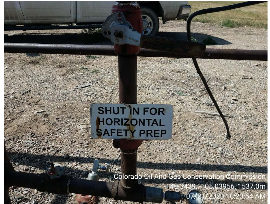
HZ safety prep sign