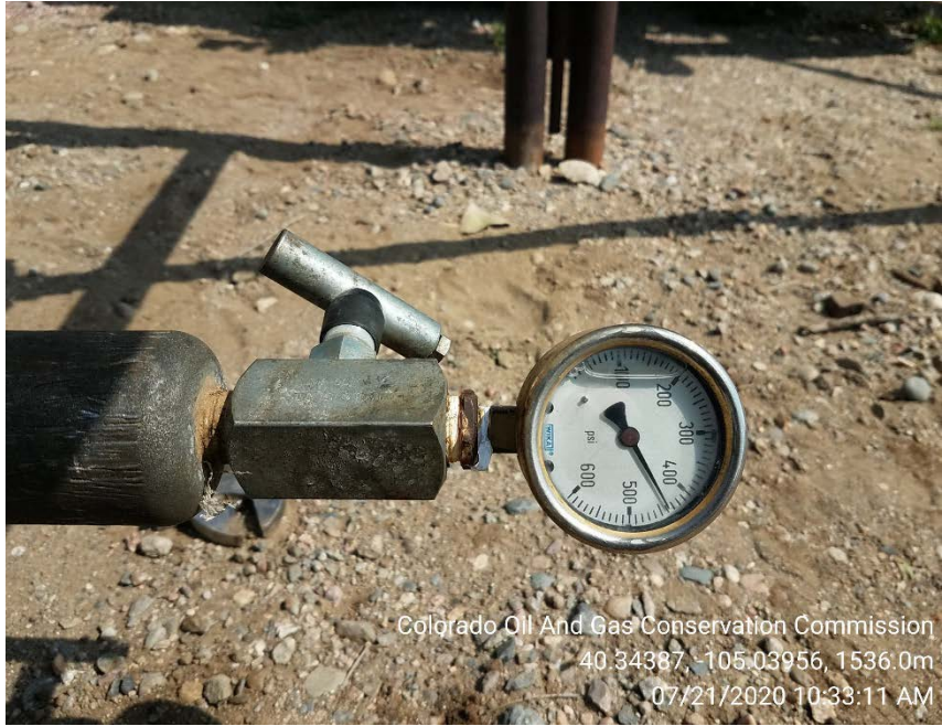
5 minute casing pressure