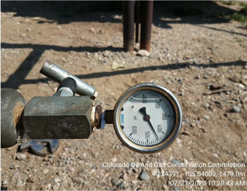
MIT starting pressure