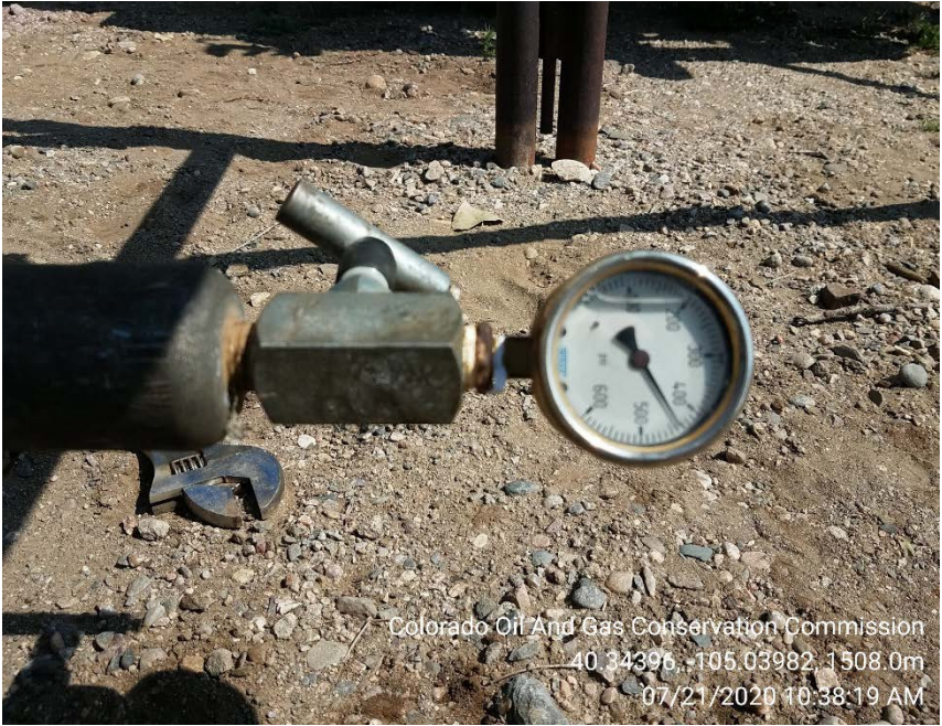
10 minute casing pressure