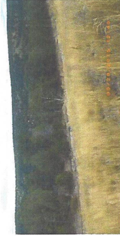
Photograph 4 - South side of pad facing south Lat: 39.95491 Long: -108.20099