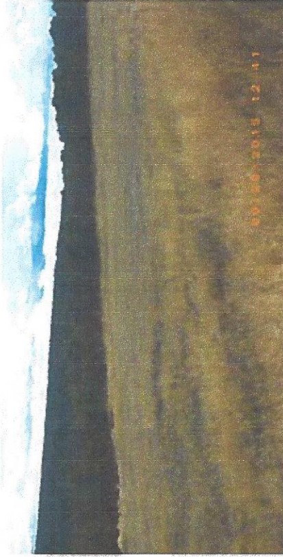
Photograph 3 - East side of pad facing east Lat: 39.95521 Long: -108.20113