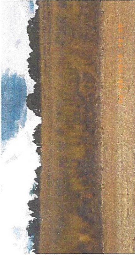
Photograph 1 - West side of pad facing west Lat: 39.95479 Long: -108.20167