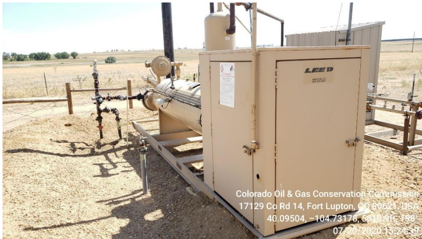
Photo 7 Horizontal Heated Separator