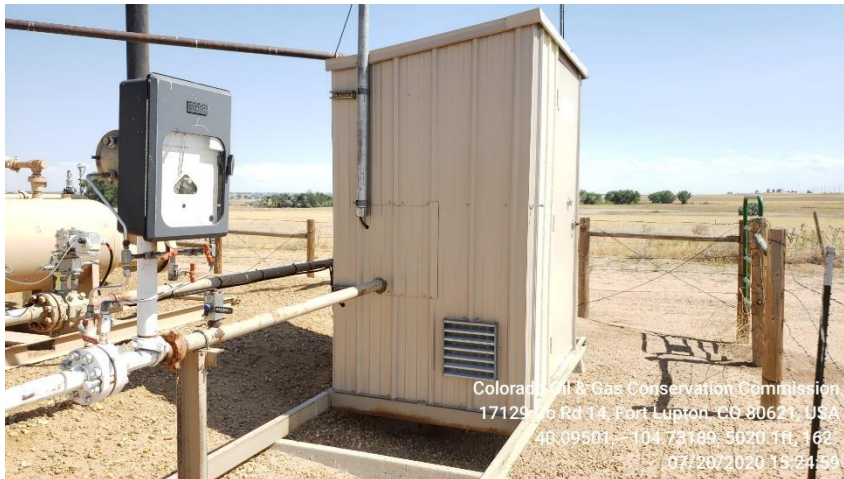
Photo 5 Gas Meter Run