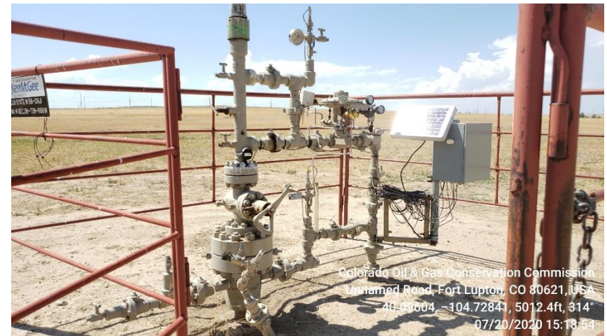
Photo 2 WH