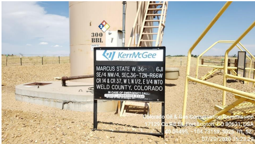
Photo 3 TB sign