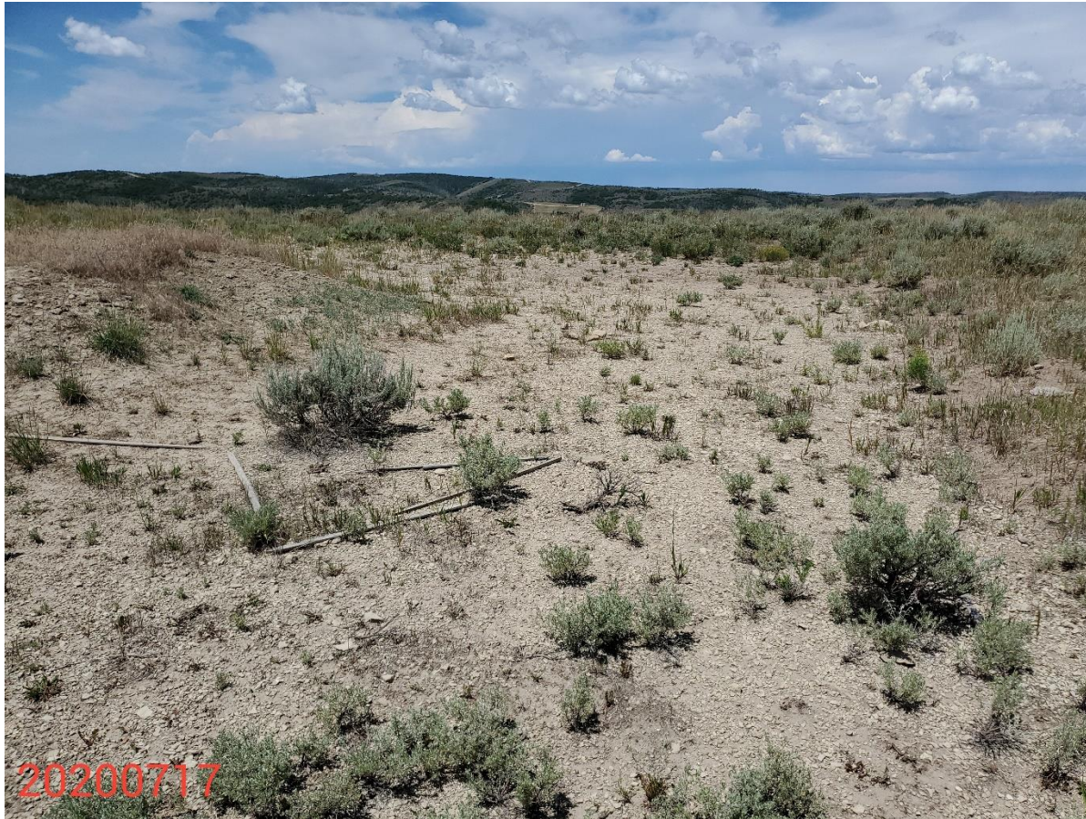
Photo 4: Photo taken from the north end of the Location, facing west. Photo shows soil stockpile remaining on Location. Photo also shows large areas of the Location that remains predominantly bare and exposed soils.