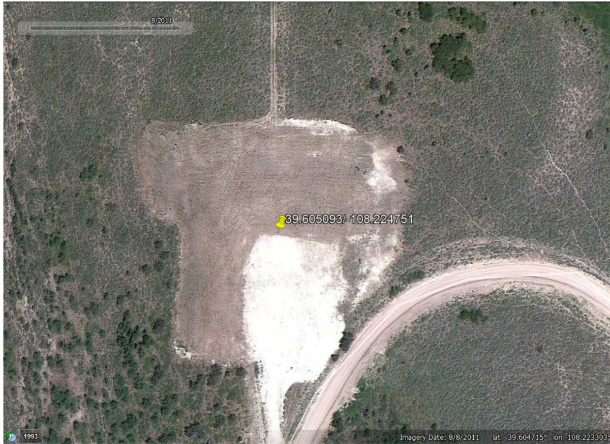
Photo 2: 2011 Google earth aerial imagery. Photo shows location post oil and gas disturbance.