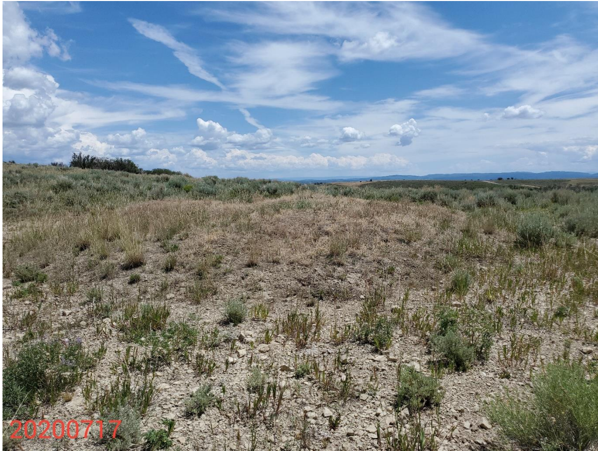
Photo 3: Photo taken from the central area of the Location, facing northeast. Photo shows soil stockpile on Location. Location requires contouring and soils replaced and reclaimed.