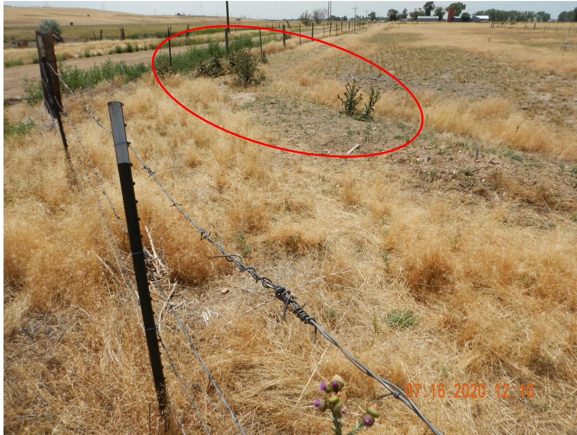
Photo 3. Photo taken along the northeastern location, facing South. Photo illustrates a List B Colorado noxious weed, Scotch thistle.