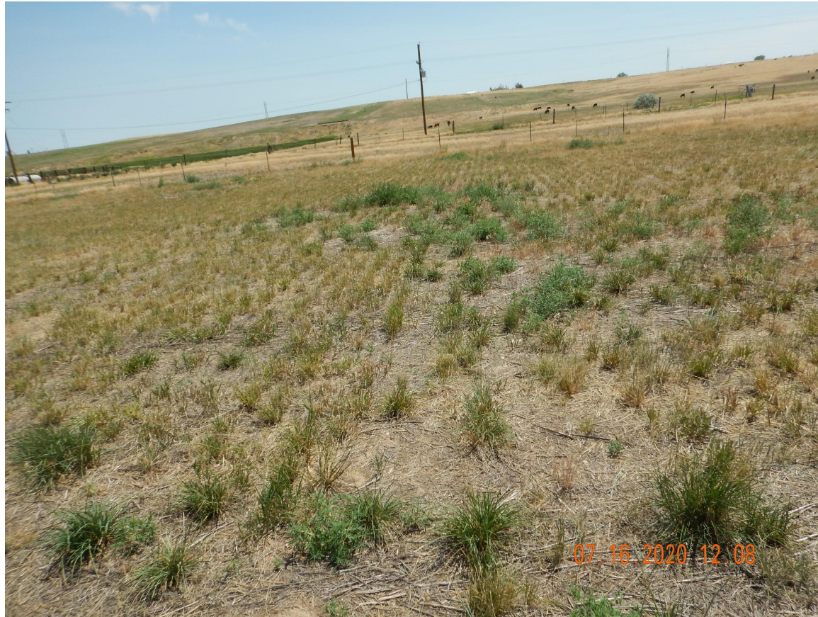
Photo 6. Photo taken from the eastern location, facing East. See comments under Photo 5.