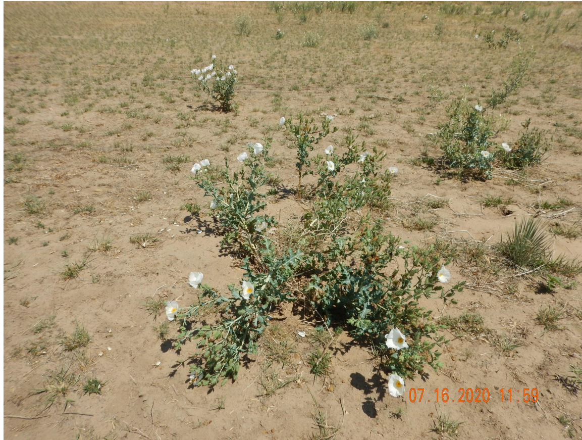
Photo 9. Photo taken from the interim reclamation area. Photo illustrates a crested prickly-poppy ( Argemone polyanthemus ), which is a common native plant species in sandy soil of grasslands. This is second of two plant species of concern for the complainant.