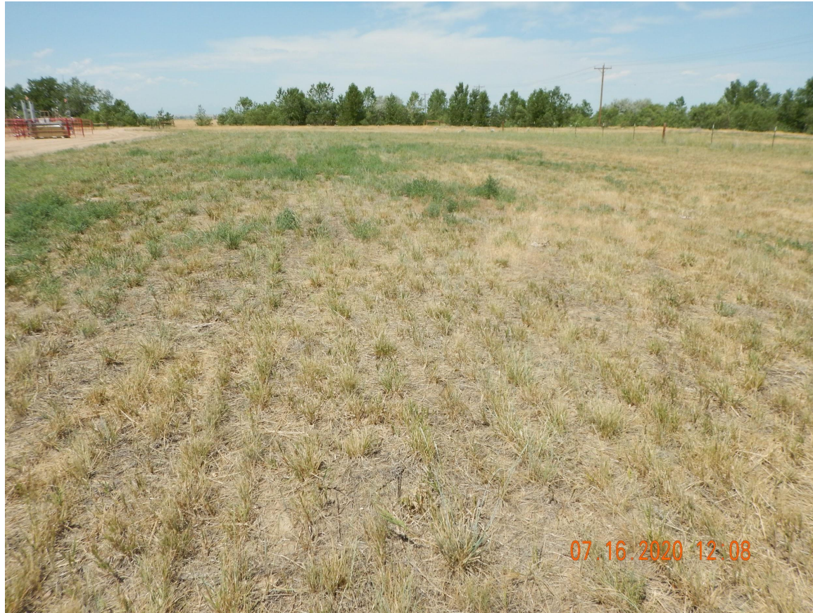
Photo 7. Photo taken from the northeastern location, facing West. See comments under Photo 5.