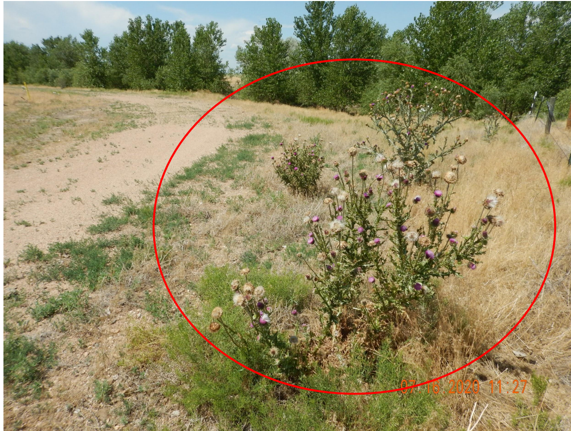
Photo 2. Photo taken along a portion of the northern access road, facing West. Photo illustrates a List B Colorado noxious weeds, Scotch thistle and Musk thistle.