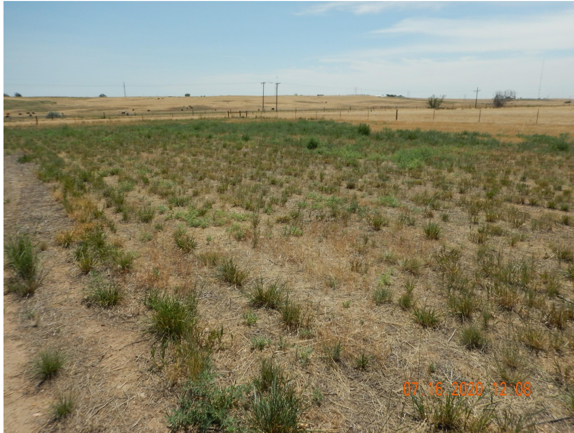
Photo 5. Photo taken from the southeastern location, facing East. Photo illustrates the establishment of desirable plant species. Some establishment of Kochia was observed but it appears the Operator is performing ongoing weed management, as it appears the location has been recently mowed.