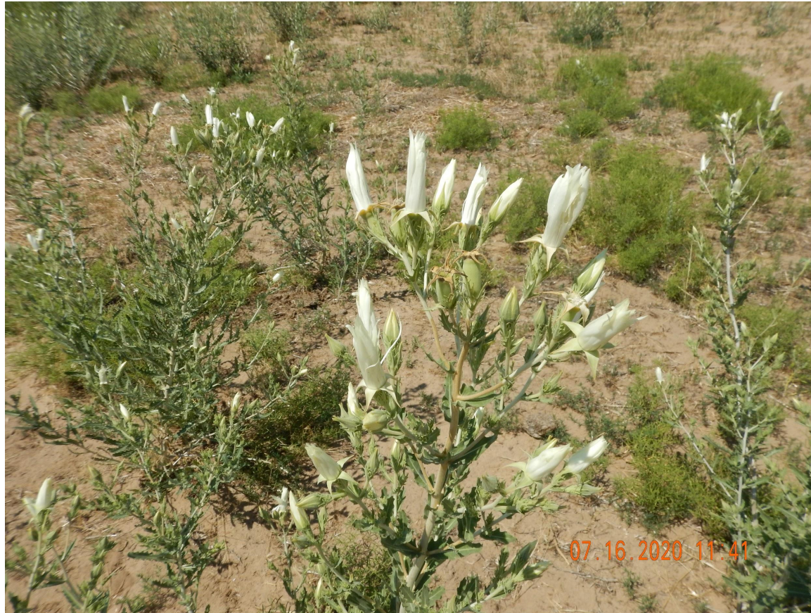
Photo 8. Photo taken from a portion of a flowline area. Photo illustrates a white-flowered blazingstar ( Mentzelia nuda ), which is a common native plant species to the eastern plains and foothills. This is the first of two plant species of concern for the complainant.