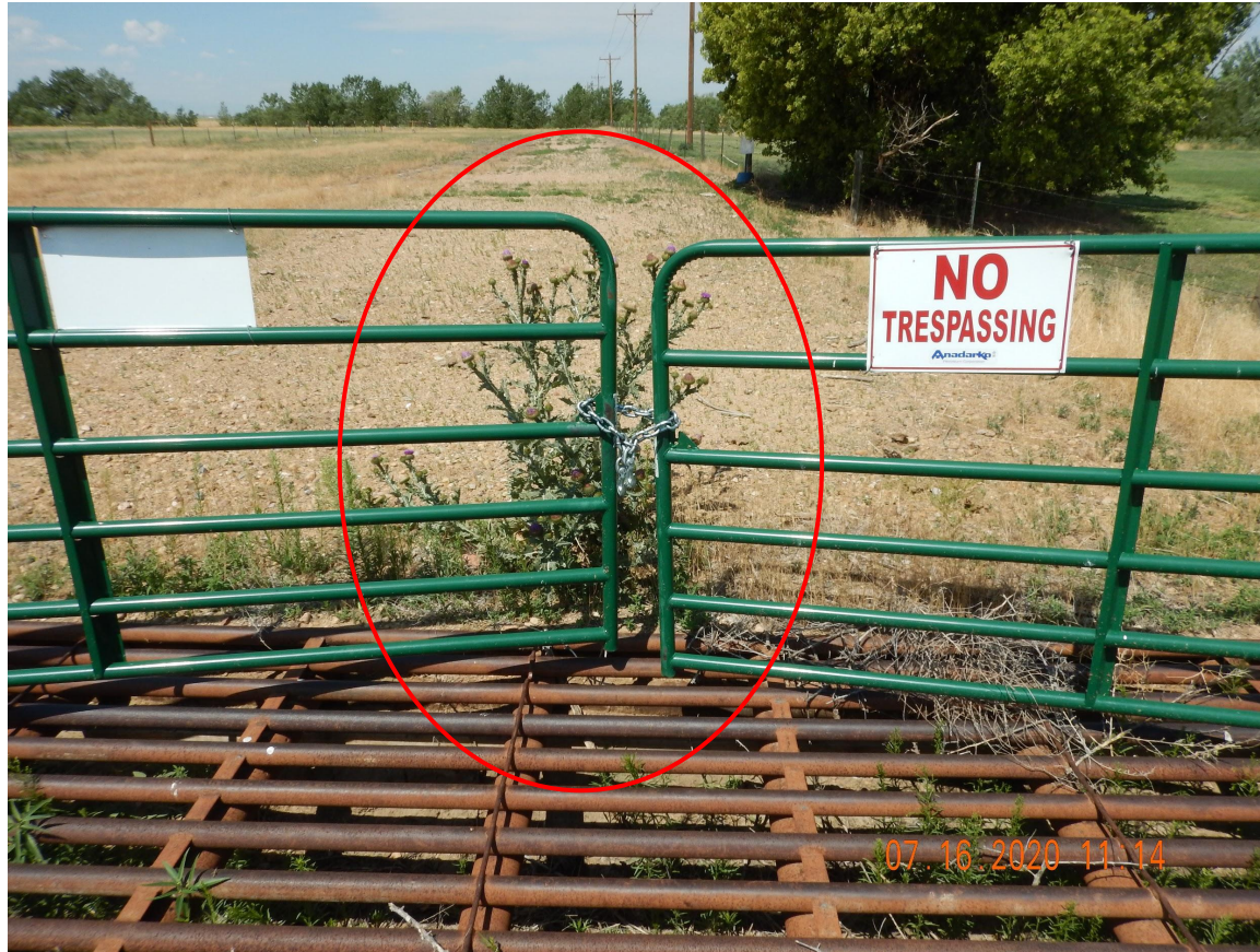
Photo 1. Photo taken from the northeastern location, facing West. Photo illustrates a List B Colorado noxious weed, Scotch thistle.