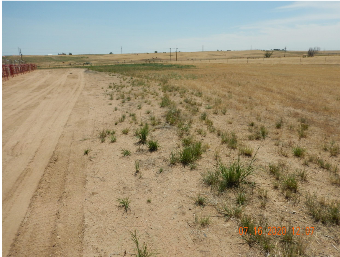
Photo 4. Photo taken from the entrance of location, facing East. Photo illustrates the Operator has performed interim reclamation activities to reduce all areas not needed for production operations. The southwestern and southern interim areas are dominated by cheatgrass.