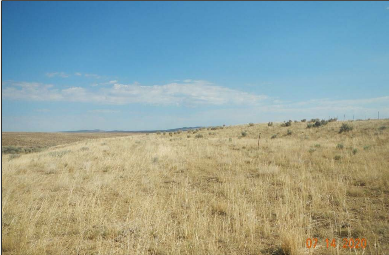
Photo 4. View of the reclaimed well pad from the southwestern corner facing center.