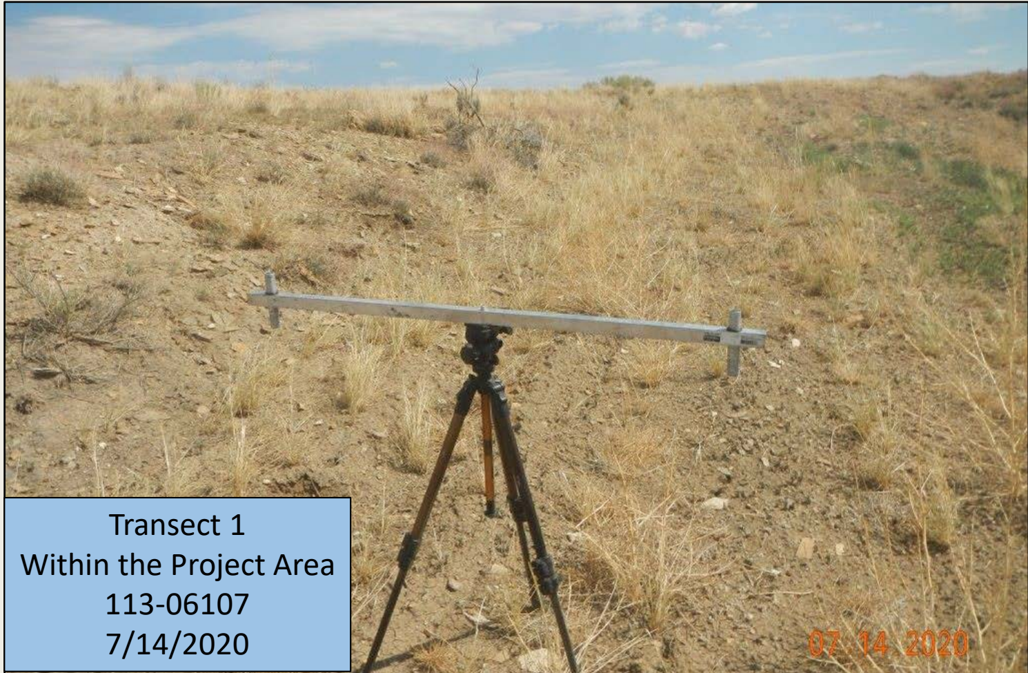
Photo 5. View from the beginning of Transect 1- within the project area (along the access road) facing northward.