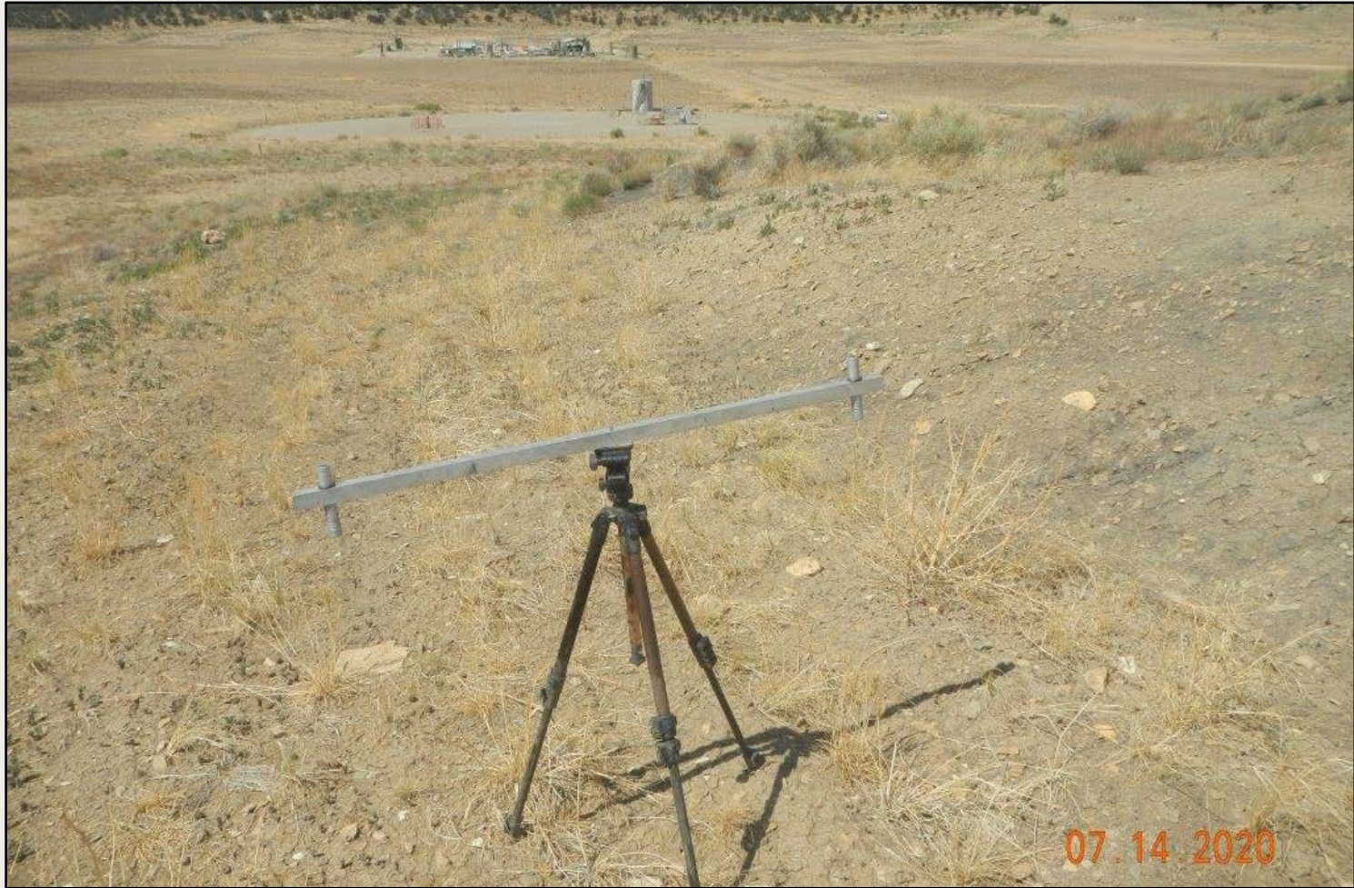
Photo 6. View from the end of Transect 1, facing southward.