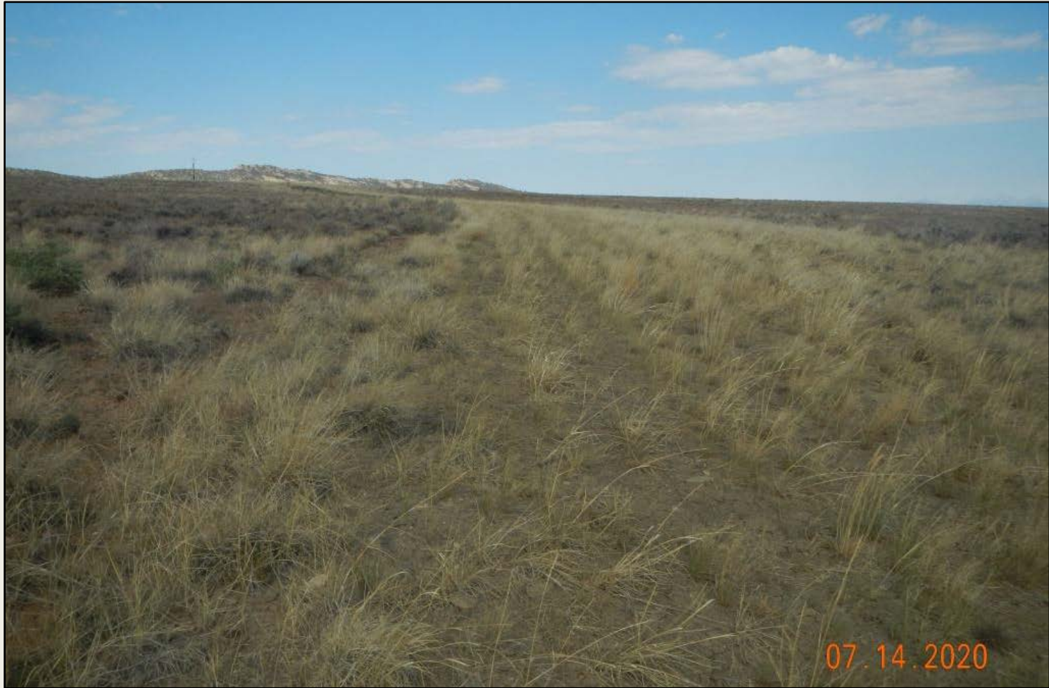
Photo 2. View of revegetation along the approximately 0.75 mile-long access road facing westward.