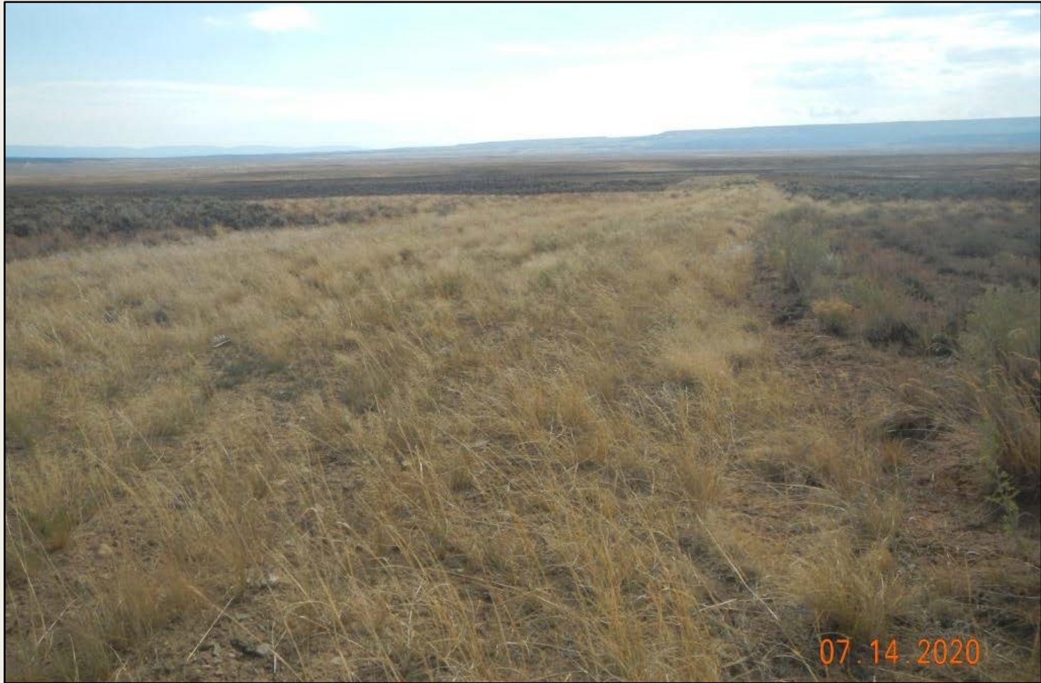
Photo 1. View of revegetation along the approximately 0.75 mile-long access road facing eastward. Revegetation is progressing with grasses such as western wheatgrass, Indian ricegrass, and crested wheatgrass.