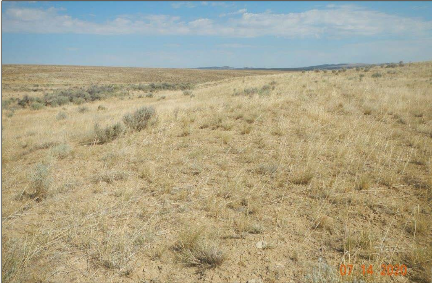
Photo 3. View of the western portion of the reclaimed well pad facing northward from the southwestern corner. Revegetation is established and shrubs such as sagebrush and winterfat are becoming established.