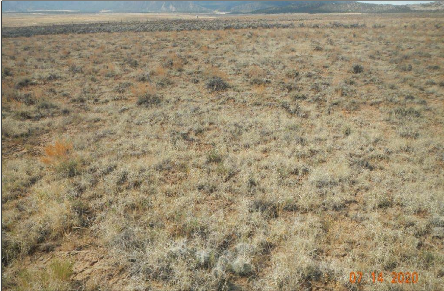
Photo 8. View of reference area east of the transect, comprised of black sage/James galleta dominated grass and shrubland.