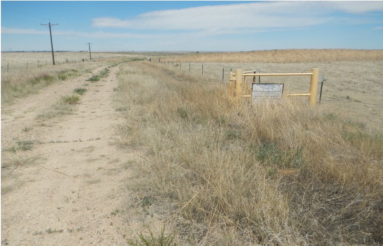
Photo 1. Facing north along the access road toward the location. Location sign is posted next to access road.