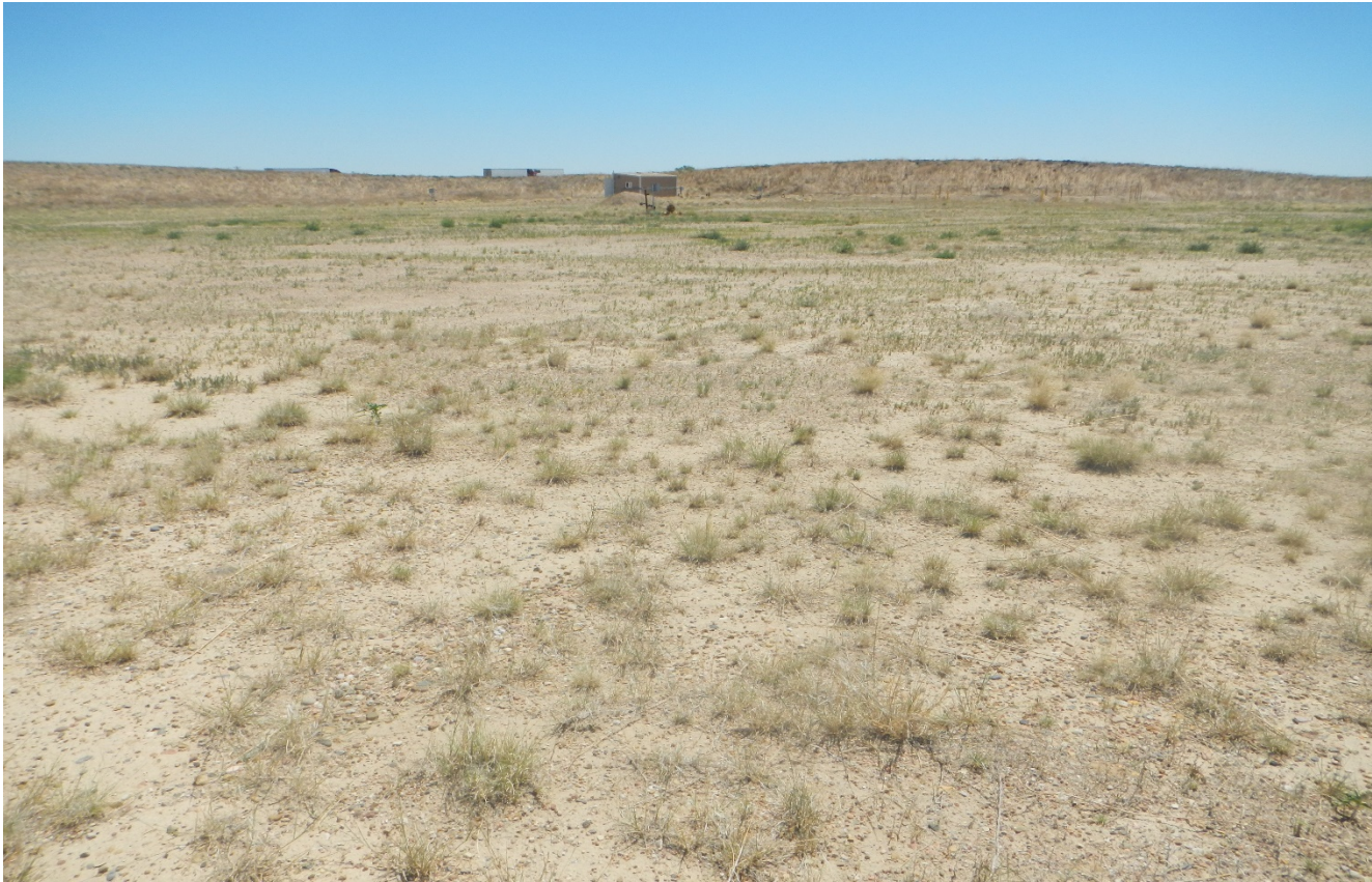
Photo 16. Facing southeast toward the location. Interim reclamation has not been performed. Unused areas of the location have not been reclaimed.