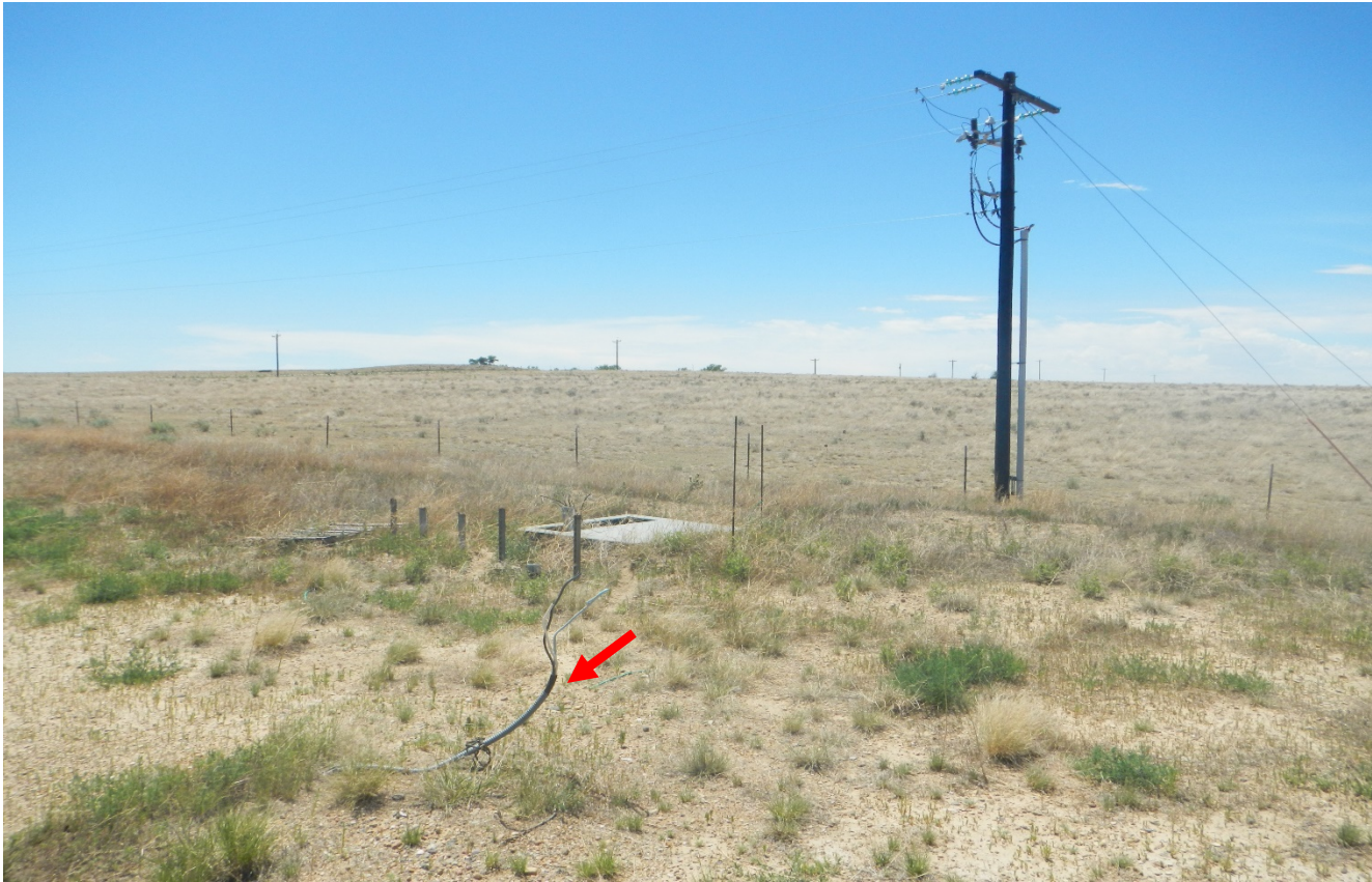
Photo 18. Facing toward west side of the location. There is electrical wiring extending out of the ground in this area. There is a cellar with exposed electrical wiring inside.