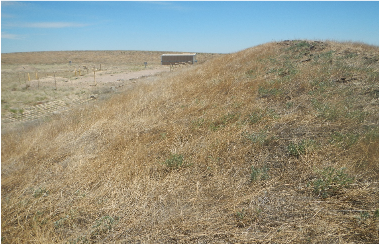
Photo 4. Facing east along the soil pile. The soil pile has not been replaced and recontoured. There are undesirable weeds growing throughout the soil stock piles. There is an accumulation of weed debris throughout the soil stockpiles.