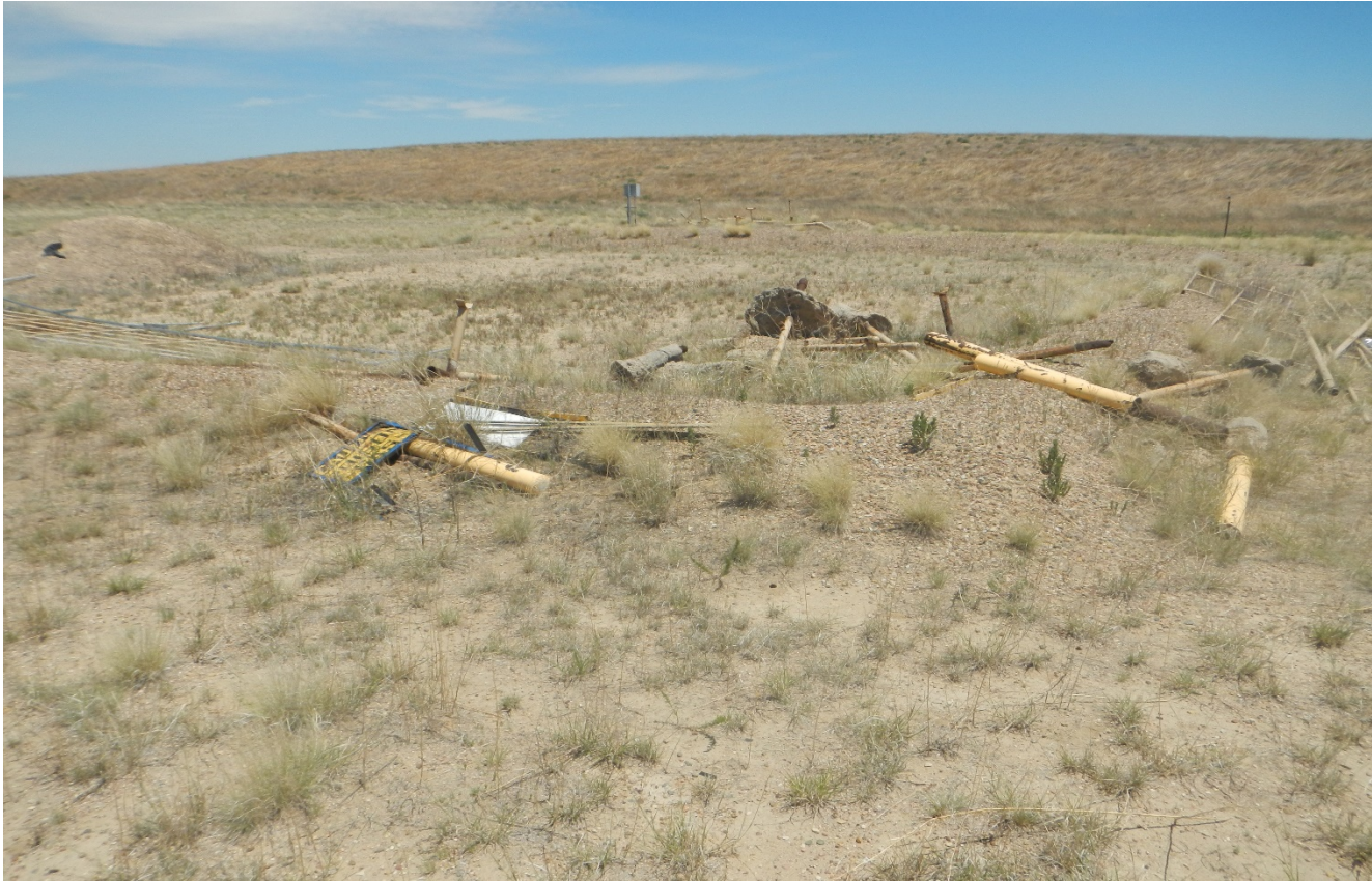
Photo 8. There is various unused equipment and debris laying on the ground. There is a berm that remains in this area.