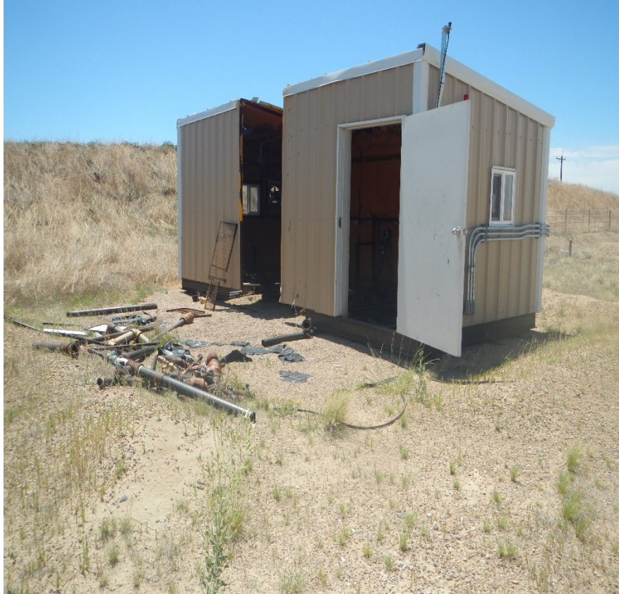
Photo 10. There is a shed in disrepair at the southeast side of the location. Various unused equipment remains near the shed.