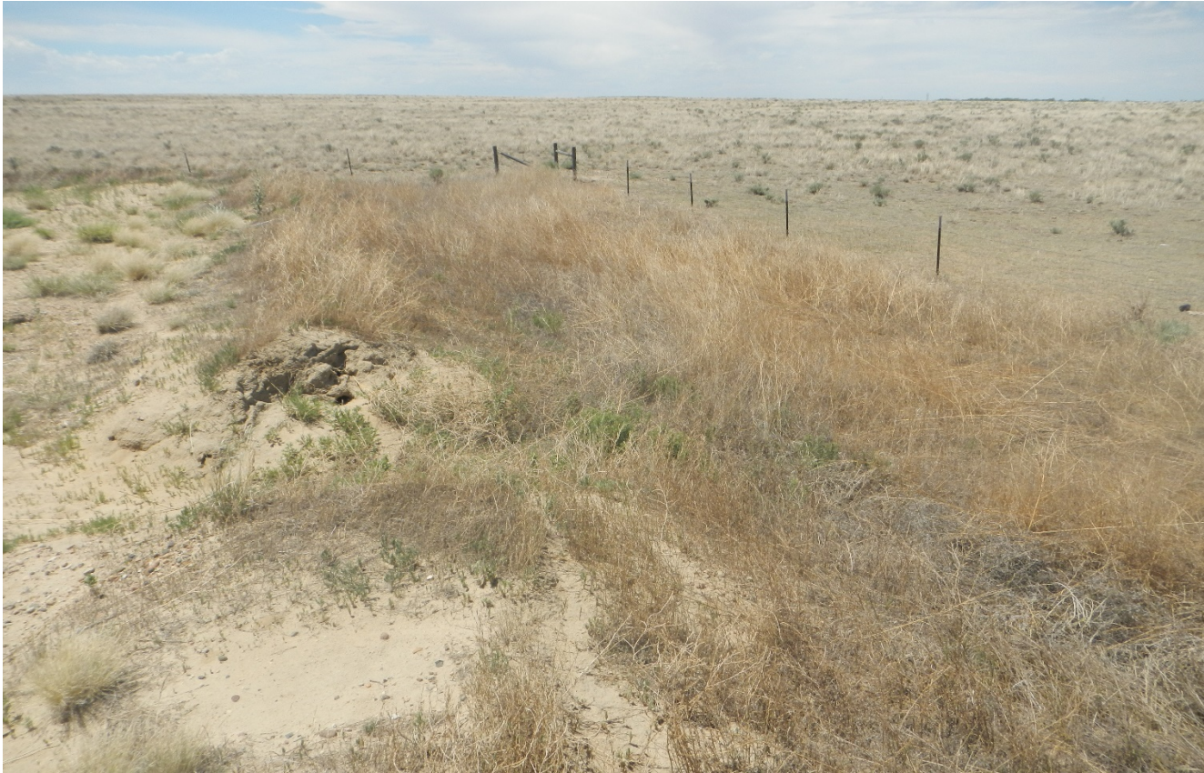
Photo 17. Facing toward the northwest side of the location. There is erosion that has occurred off the fill slope and undesirable weed growth along the perimeter.