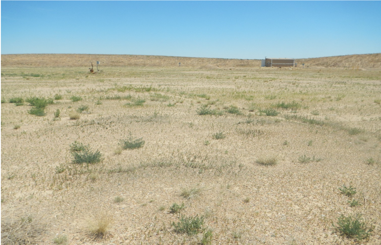
Photo 20. East side o the location facing southeast. Unused areas of the location have not been reclaimed.