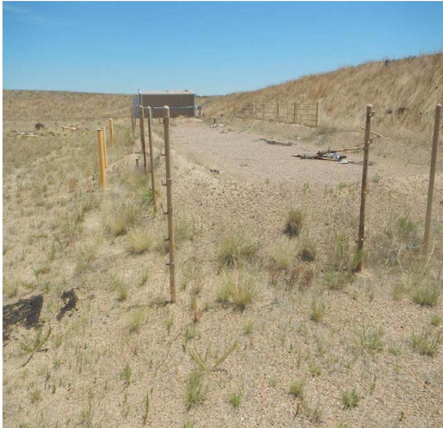
Photo 6. There is tank berms that remain and unused fence posts.