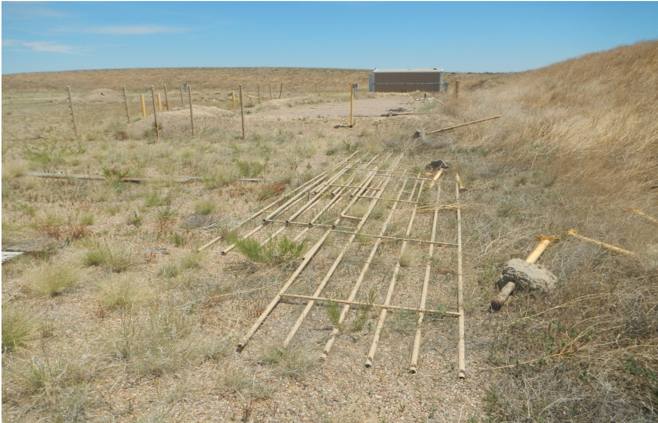
Photo 5. Facing east at the location. There is numerous unused equipment laying on the ground.