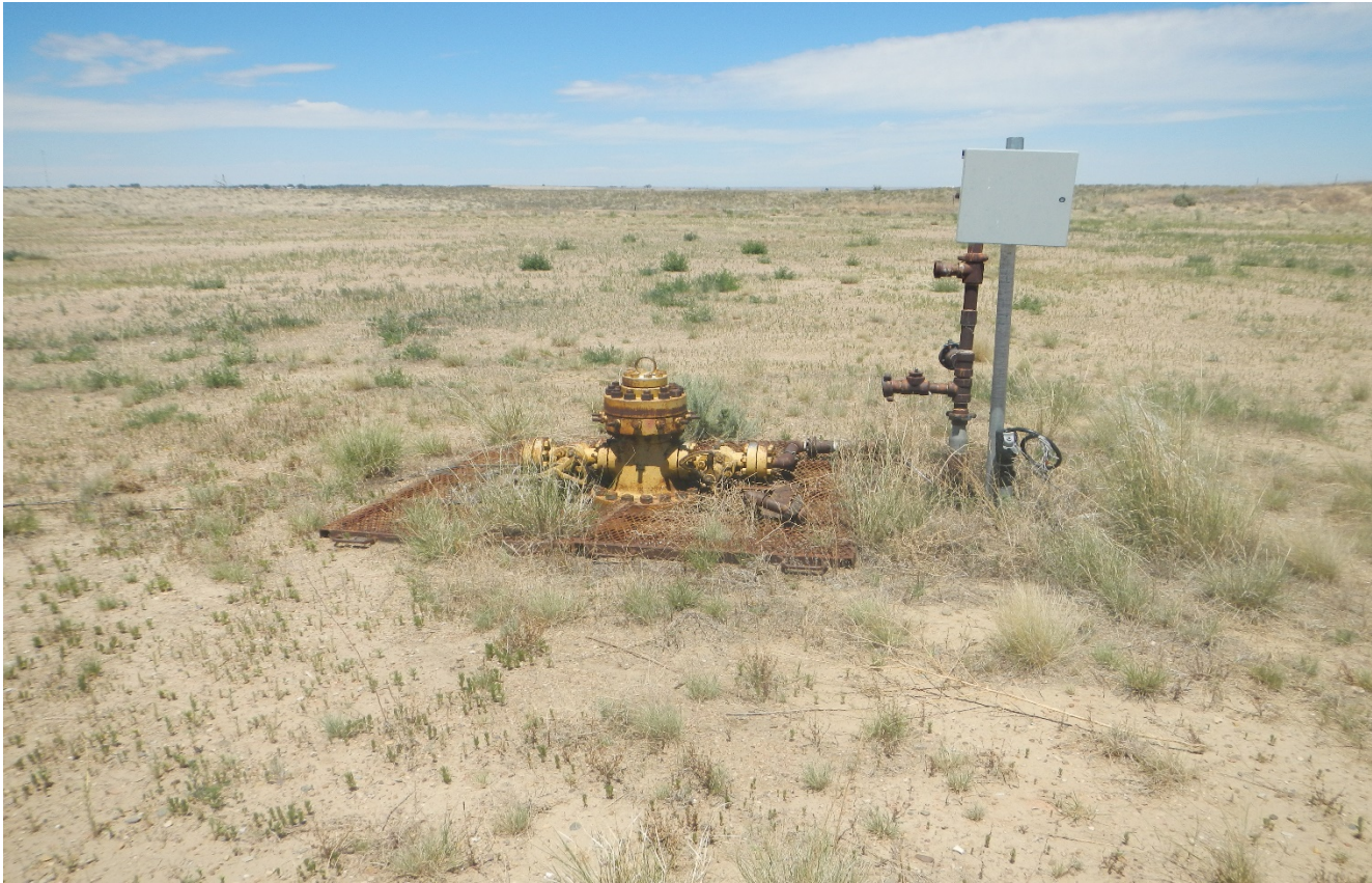
Photo 14. Facing toward the wellhead at the center of the location.