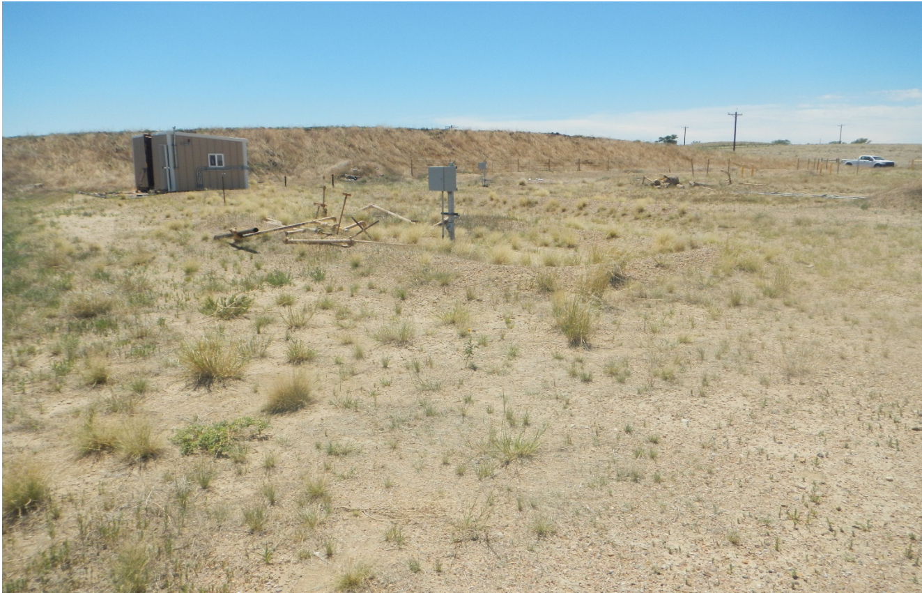
Photo 9. Facing southwest toward the location. There are multiple berm areas, unused equipment, debris, electrical equipment, and storage shed in disrepair.