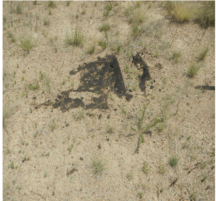
Photo 7. There is oily waste observed near the berm shown in previous photo.