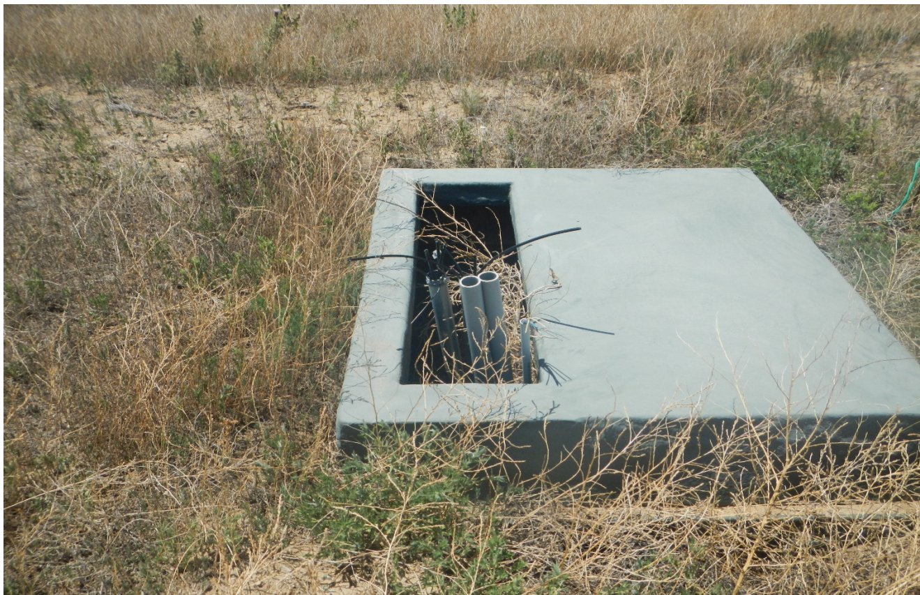
Photo 19. This cellar electrical box has exposed electrical wires.