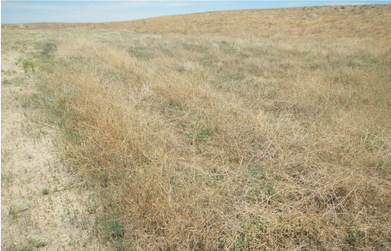
Photo 13. Facing northeast toward the east side of the pad. There is undesirable weeds ( Kochia sp.) growing throughout this area. There is weed debris which is a potential fire hazard.