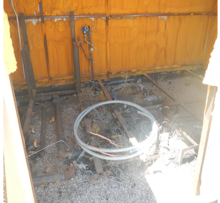
Photo 11. View of inside the shed. There is various piping risers, and supplies inside the shed.