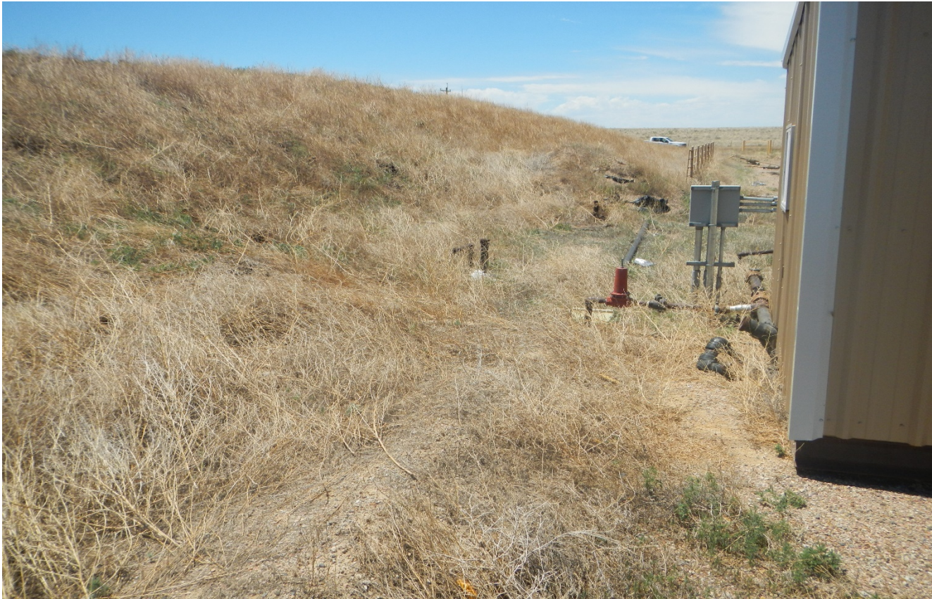
Photo 12. Facing west at the south side of the location. There is weed debris along the soil stockpile which is a potential fire hazard. Various supplies, unused equipment is laying on the ground.