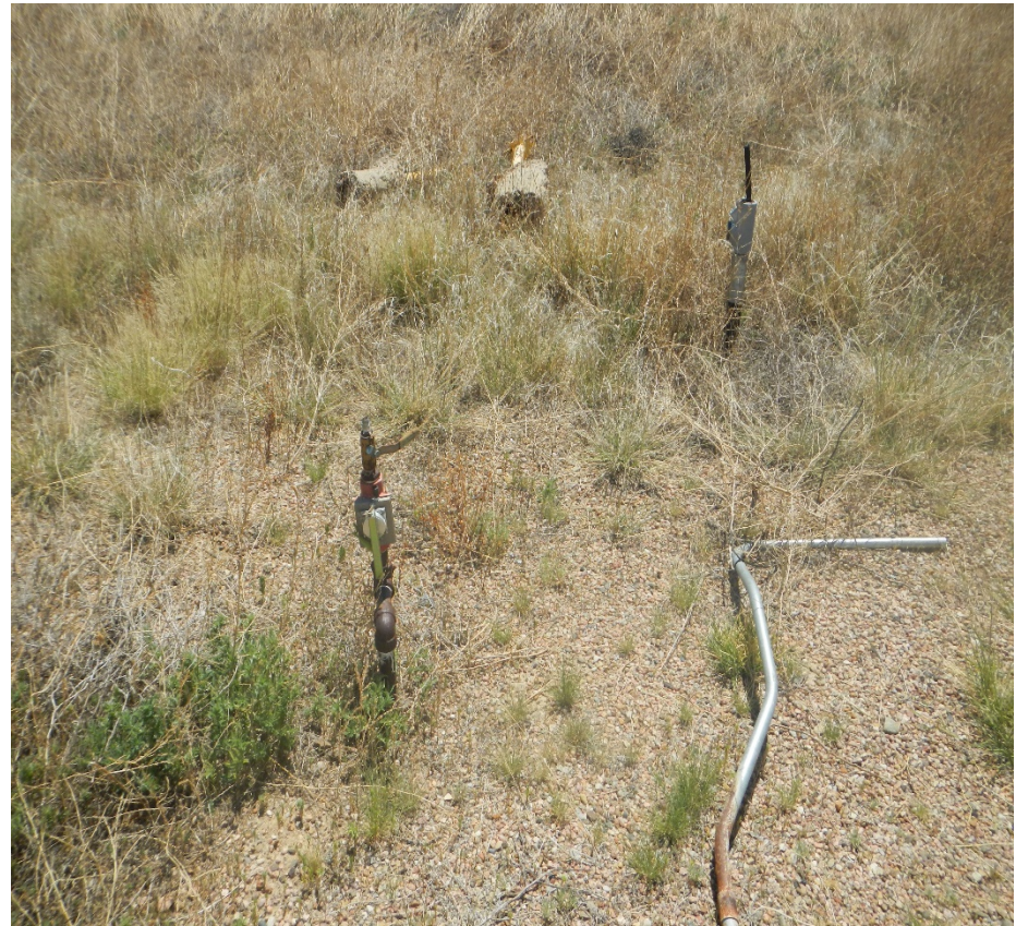
Photo 3. View of pipe risers with no LOTO.