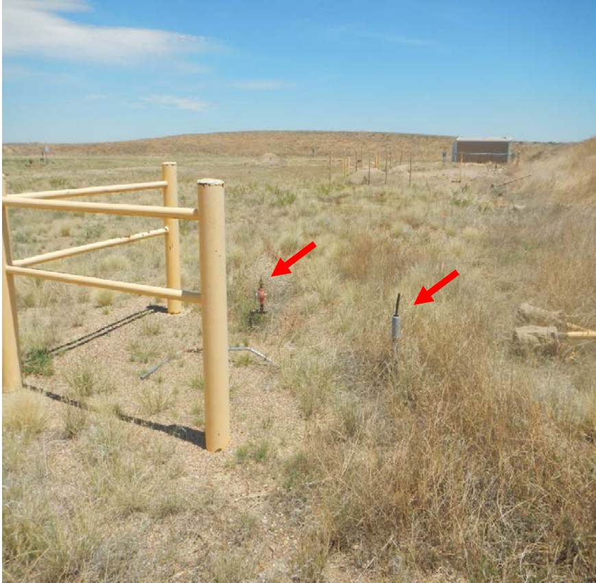
Photo 2. Facing northeast toward the location. There are pipe risers shown at red arrow.