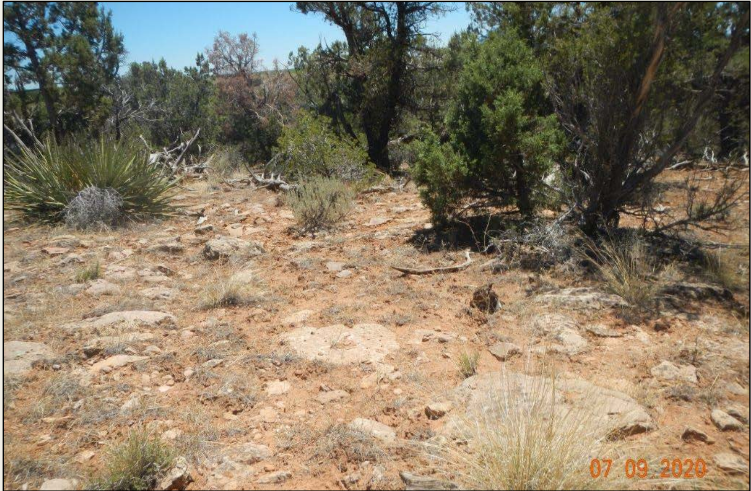
Photo 8. View of reference area vegetation comprised of pinyon and juniper woodland, with sagebrush, yucca, antelope bitterbrush, Indian ricegrass, and Navajo tea in the understory.