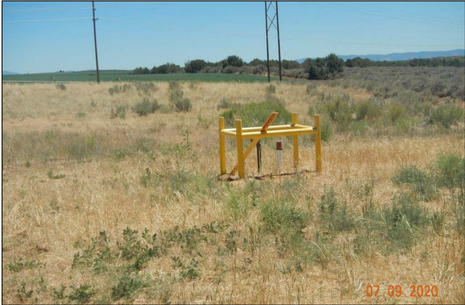
Photo 5. View of riser in the southeastern project area. Flowline maps do not illustrate active lines in the area. Riser needs to be removed.