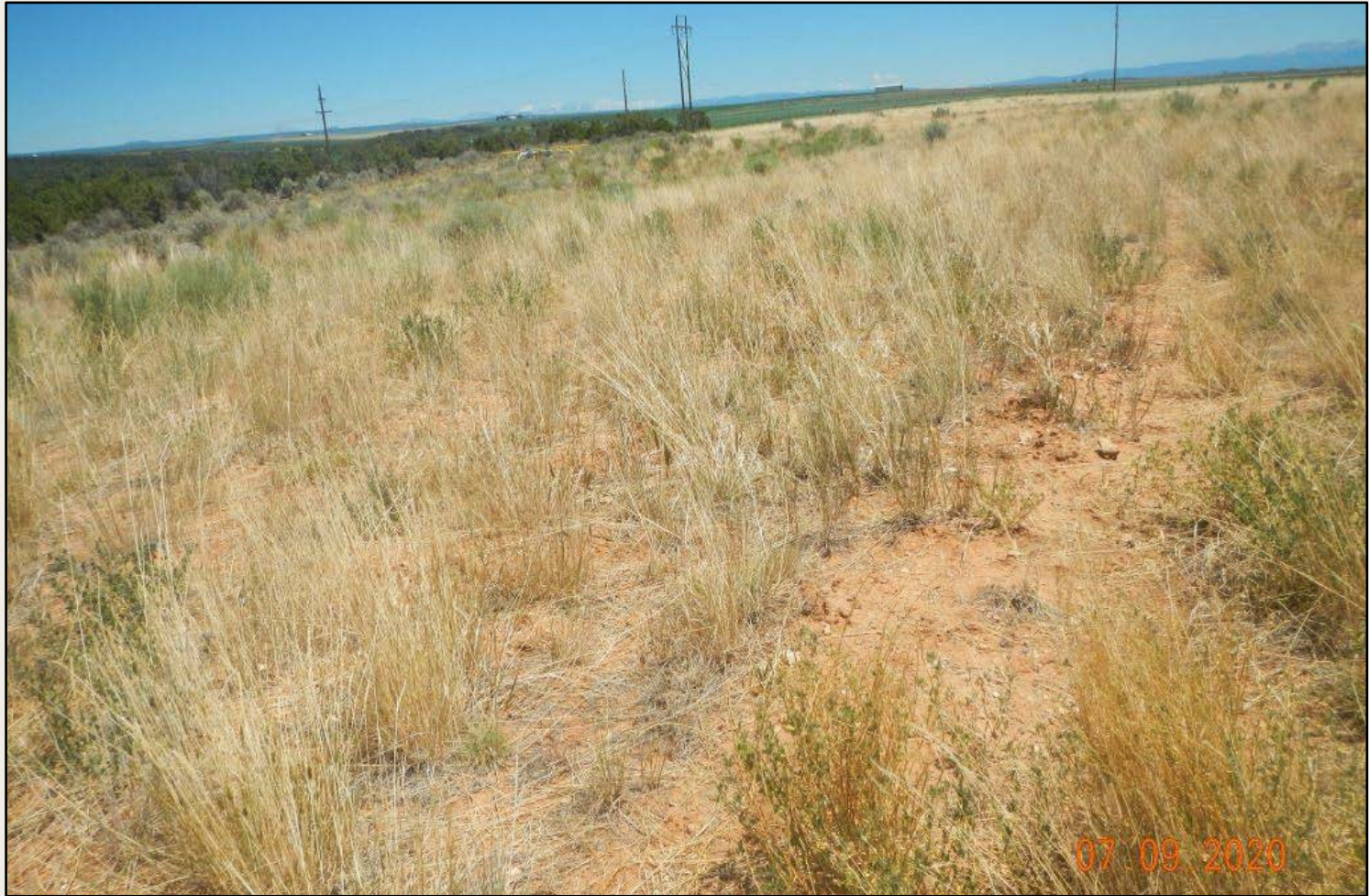
Photo 3. View of the northern project area from the northwestern corner facing eastward.