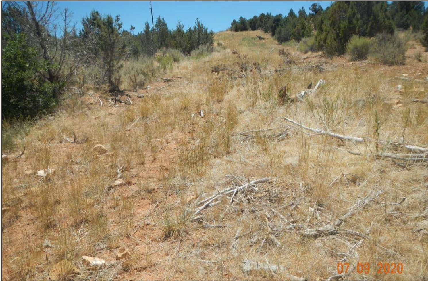
Photo 1. View of the access road facing southward. Revegetation appears to be progressing with crested wheatgrass, fourwing saltbush, smooth brome, and western wheatgrass.