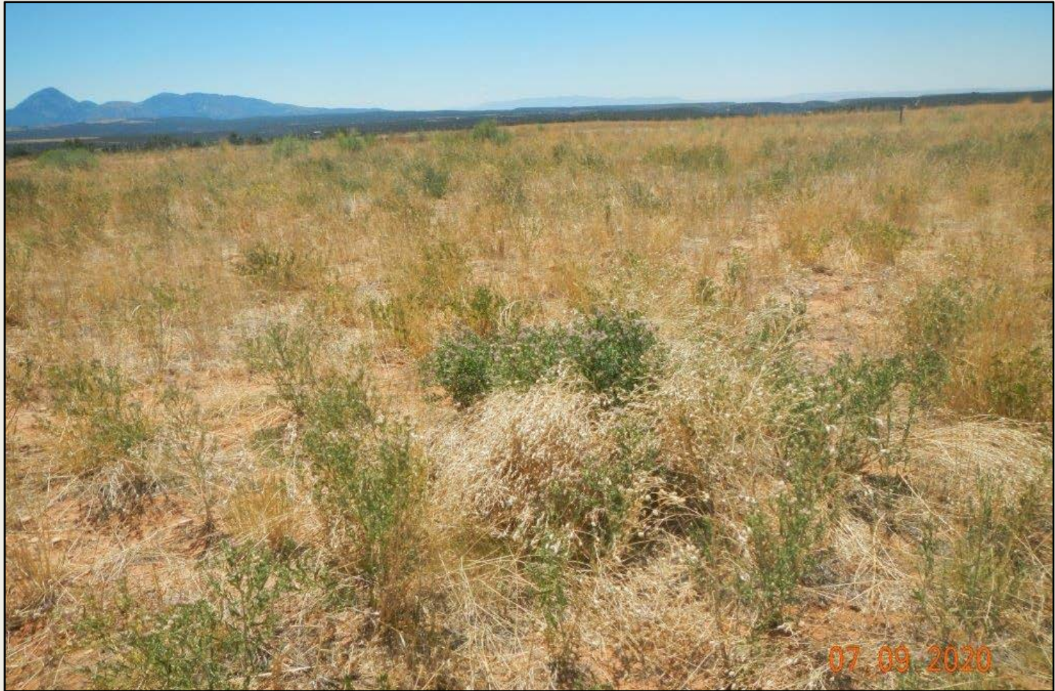
Photo 2. View of the project area from the northwestern corner facing center.