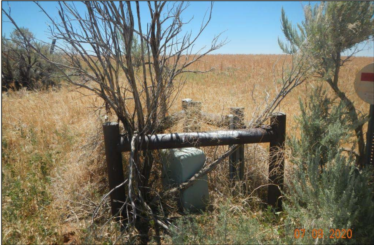
Photo 4. View of riser at the entrance to the former well pad, is not maintained and appears to be associated with the plugged well. Riser should be removed.