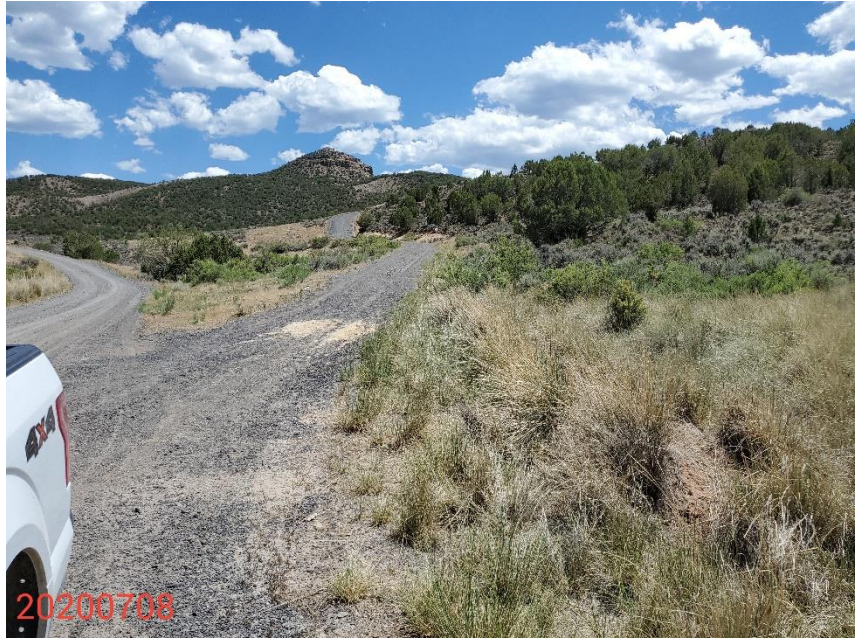
Photo 6: Photo taken from the access road entrance facing south. Photo shows access road to the Location has not been reclaimed.