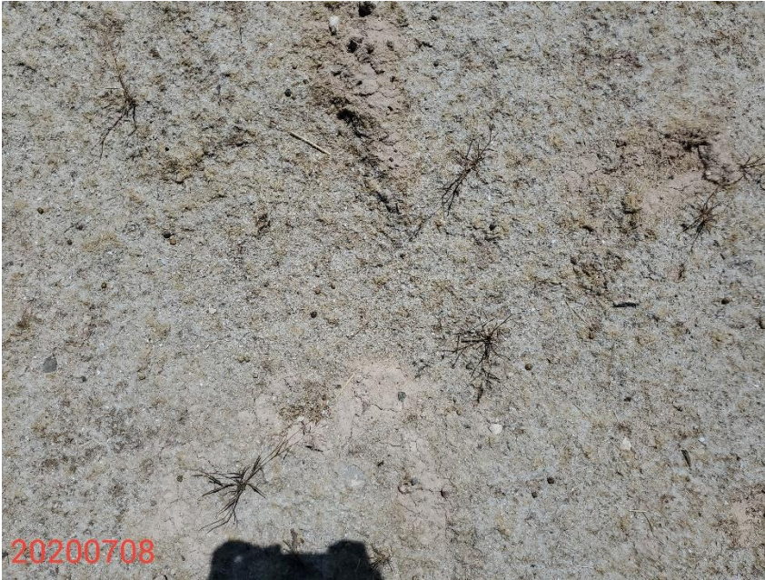
Photo 3: Photo of the Locations surface. Photo shows hydromulch has been implemented to stabilize soil surface. Photo also shows little to no desirable vegetative germination was observed. Vegetation observed in photo Cheatgrass. Additional seeding may be needed to facilitate reclamation.