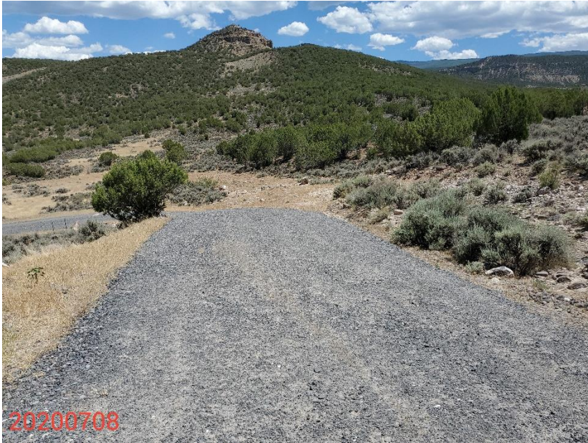
Photo 5: Photo taken from the access road, north of the Location facing southwest. Photo shows access road has not been reclaimed.