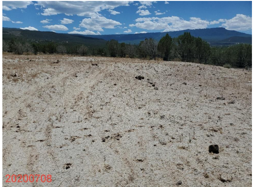
Photo 2: Photo taken from the north end of the Location facing southwest. See comments under photo 1.