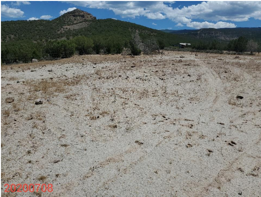
Photo 1: Photo taken from the north end of the Location facing southeast. Reclamation activities appear to have been conducted. Operator appears to utilized a hydromulch, or tackifier to stabilize the reclamation area. 2 spring growing seasons have passed since reclamation was required pursuant to 1004.a; Little to no desirable vegetative germination was observed. Additional seeding may be needed to facilitate reclamation.