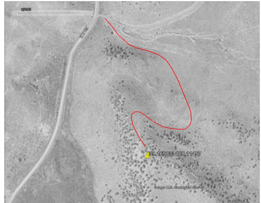
Photo 7: 1993 Google Earth aerial image. Well SPUD 1998. Photo shows Oil and gas access road did no pre-exist Oil and Gas Location; Access road subject to COGCC 1004 requirements. Red line in photo to right represent access road that was constructed (see photo 8).