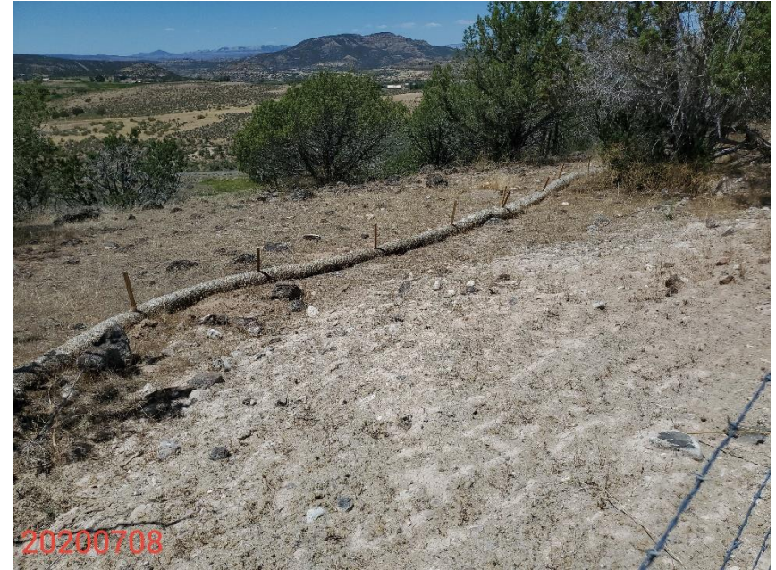
Photo 4: Photo shows Operator has implemented straw wattles along perimeter of the Location in conjunction with hydromulch.