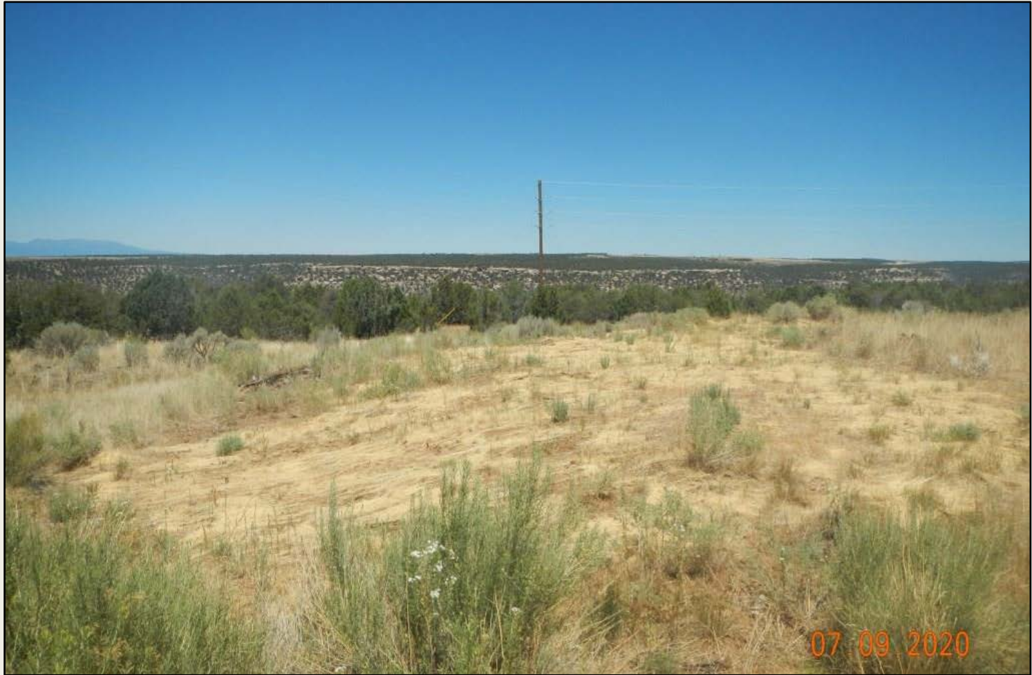
Photo 2. View of area in the northern project area where revegetation is recently conducted. Hay mulch and young grasses observed within the revegetation areas.