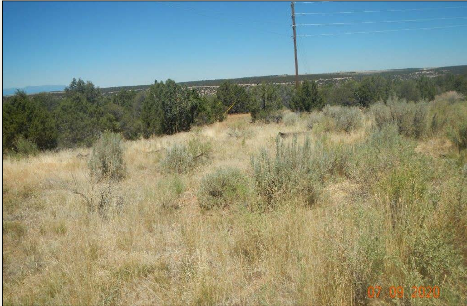
Photo 5. View of the northern project area from the norwestern corner facing eastward. Revegetation is progressing in portions with grasses such as crested wheatgrass and shrubs such as fourwing saltbush and rubber rabbitbrush.