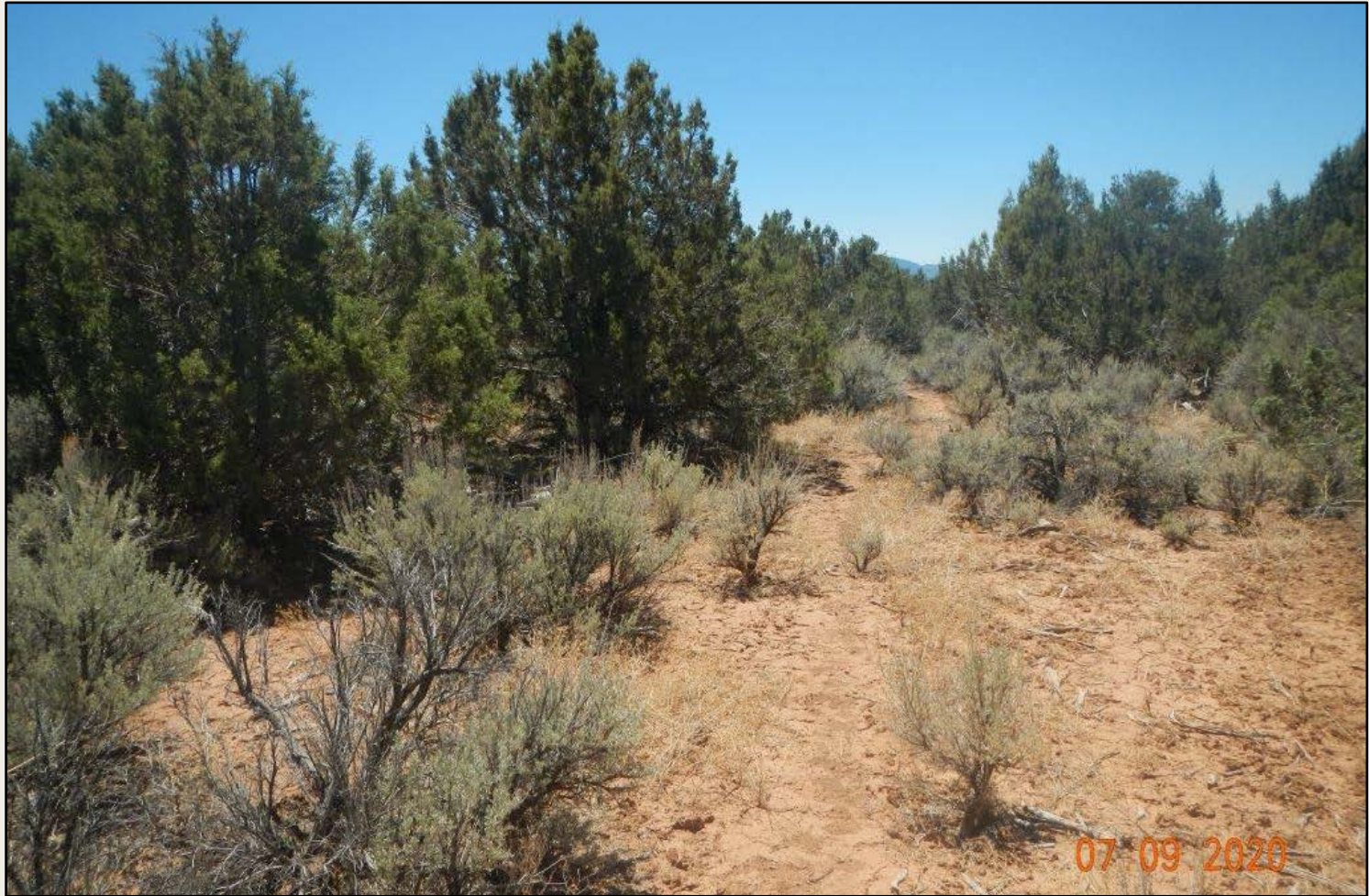
Photo 6. View of the reference area, comprised of pinyon juniper woodland with sagebrush understory and grasses/forbs such as Indian ricegrass, snakeweed, and penstemon.