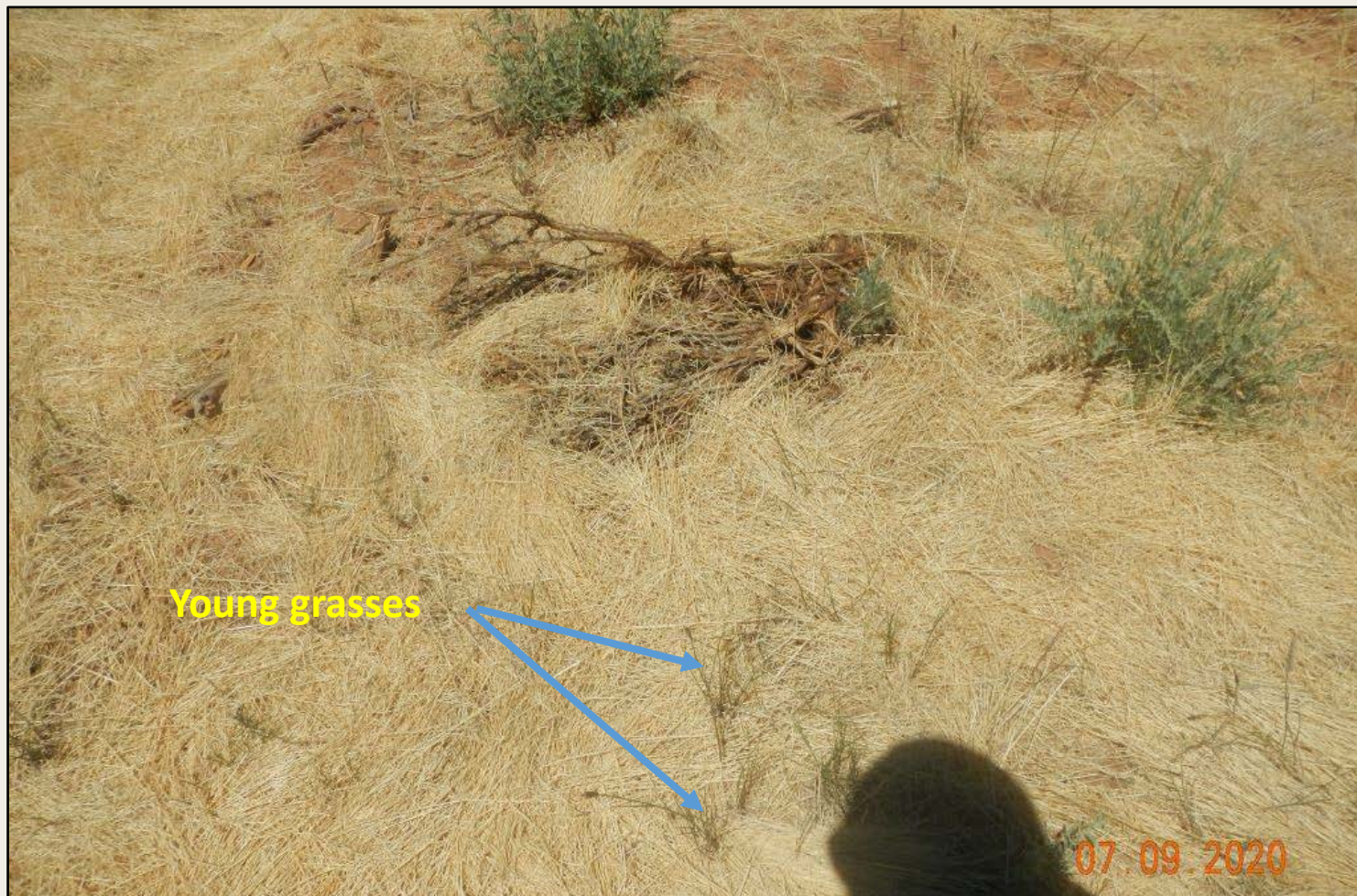
Photo 3. Birdseye view of hay mulch and young grass seedlings in the northern project area.