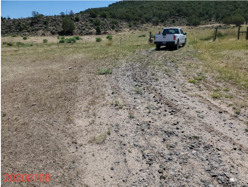
Photo 11: Photo taken from the access road, west of the Location facing east.