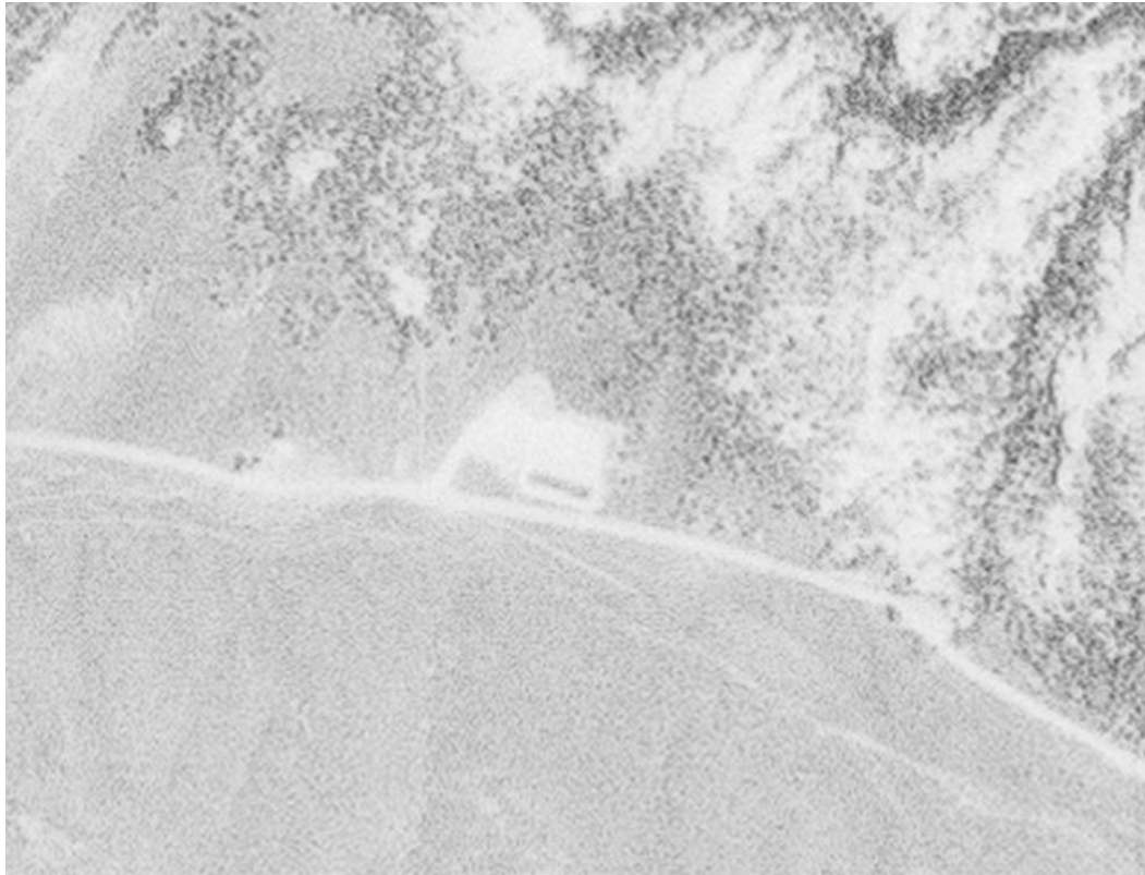
Photo 10: USGS Aerial Imagery Dated 9/2/1980. Well was SPUD 4/4/1980. Photo shows the disturbance area of this Location ~ 5 months post drilling activities.