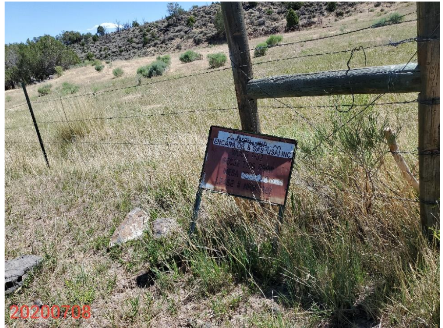
Photo 10: Photo taken from the Location entrance. Photo shows signage with incorrect Operator information.