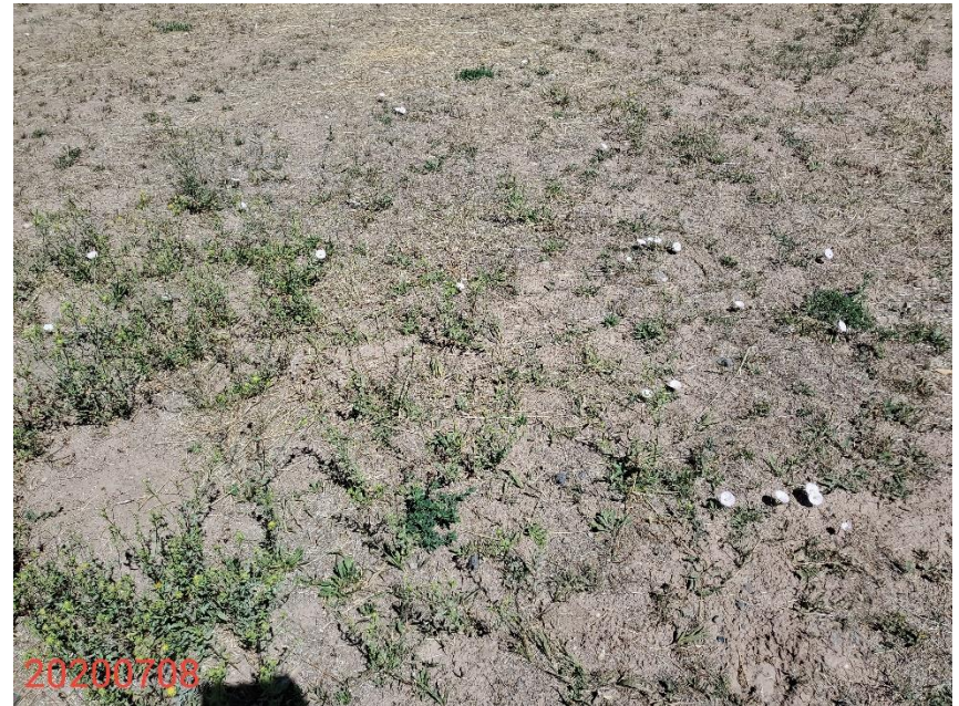
Photo 4: Photo taken from the Location. Photo shows Field Bindweed has established on the Location. This is a Colorado State listed noxious weed.