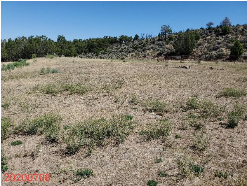
Photo 3: Photo taken from the central areas of the Location, facing north. Photo shows vegetation establishment does not appear to be progressing towards 1004 reclamation standards.