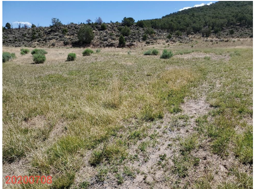
Photo 2: Photo taken from the west end of the Location, facing east. Photo provides an overview of the Location. Vegetation on the outer interim areas of the Location appear to be uniform.