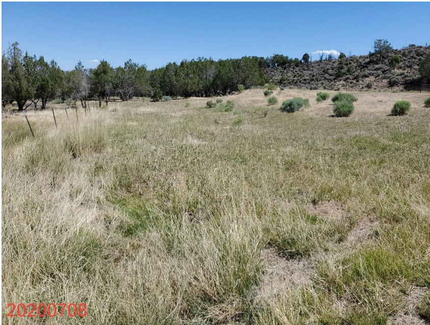
Photo 1: Photo taken from the west end of the Location, facing north. Photo provides an overview of the Location. Vegetation on the outer interim areas of the Location appear to be uniform.