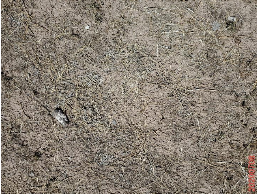
Photo 7: Close up photo of the reclamation of the Location. Photo shows revegetation of the Location is not progressing towards 1004 standards.