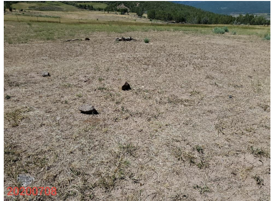
Photo 6: Photo taken from the central areas of the Location, facing south. Photo shows vegetation establishment does not appear to be progressing towards 1004 reclamation standards. Photo also shows fire ring; Areas of the Location appear to be in use and the added disturbances may be hindering reclamation/revegetation of the Location