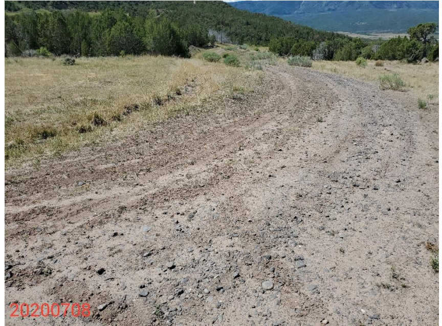
Photo 12: Photo taken from the access road, west of the Location, facing south.