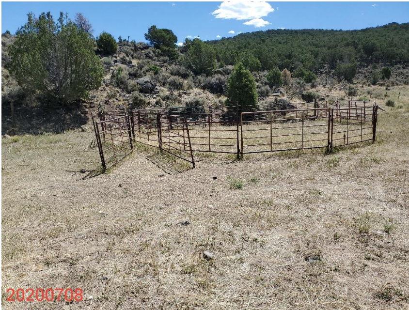
Photo 5: Photo taken from the Location, facing east. Photo shows cattle panels on the Location. Areas of the Location appear to be in use and the added disturbances may be hindering reclamation/revegetation of the Location.