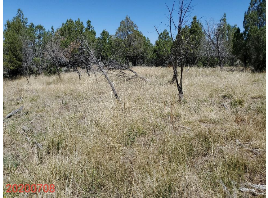
Photo 8: Photo taken from the adjacent reference area. Photo to provide comparison/contrast of the reclamation and reference areas.