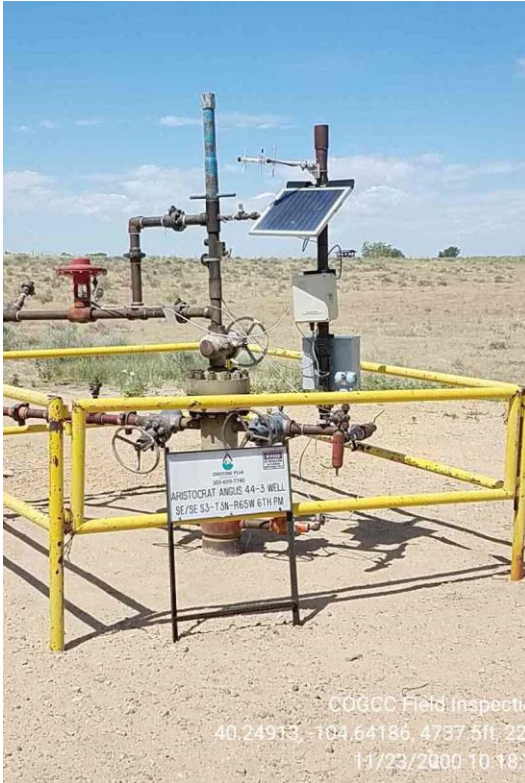
Photo 1 05-123-12762 ARISTOCRAT ANGUS 44-3C

Location ID, Name: 323245 ARISTOCRAT ANGUS-63N65W 3SESE