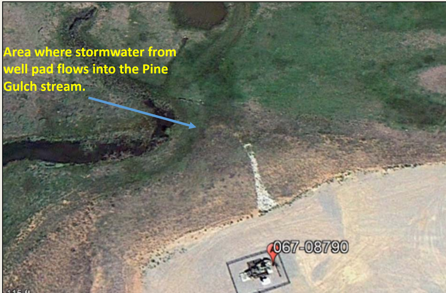
Photo 5. Google Earth aerial imagery that shows directional flow of stormwater runoff from the northern edge of the well pad that flows into the Pine Gulch stream.