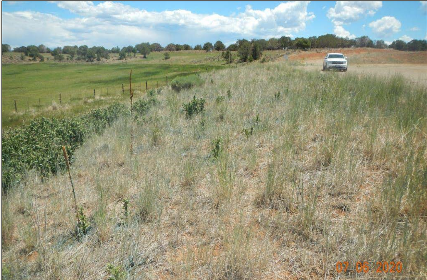
Photo 2. View of the northern fill slope from the northwestern corner facing eastward. Revegetation is progressing with grasses such as smooth brome, western wheatgrass, and crested wheatgrass.