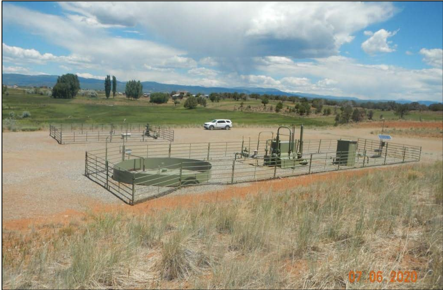
Photo 1. View of the project area from the southern edge facing northward.