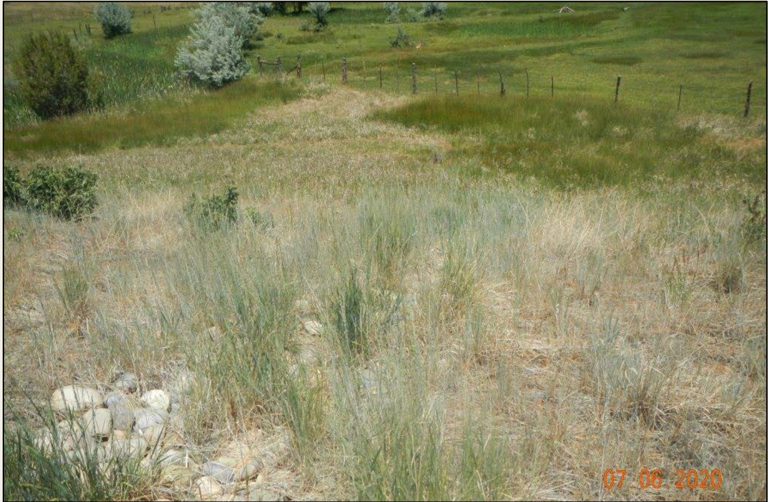
Photo 6. View of the stormwater run-down shown in Photo 5, facing downslope, toward where it flows into the Pine Gulch stream.