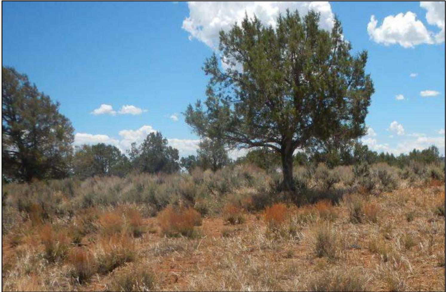
Photo 7. View of the reference area, comprised of open pinyon and juniper woodland with black sage understory and a mix of native and non-native grasses and forbs such as smooth brome and Navajo tea.