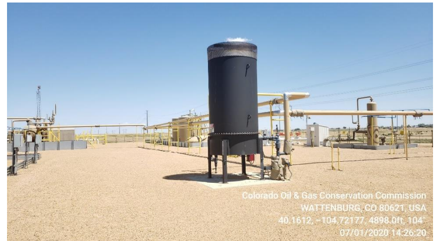
Photo 5 Compressor