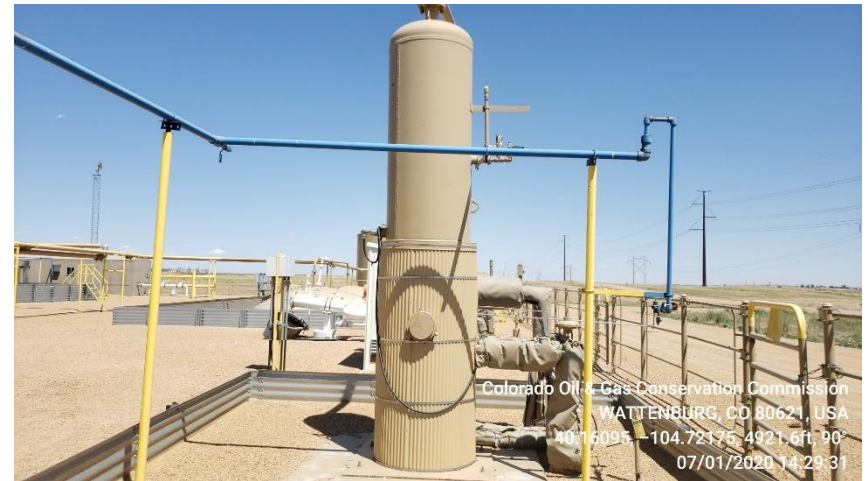
Photo 11 VRU