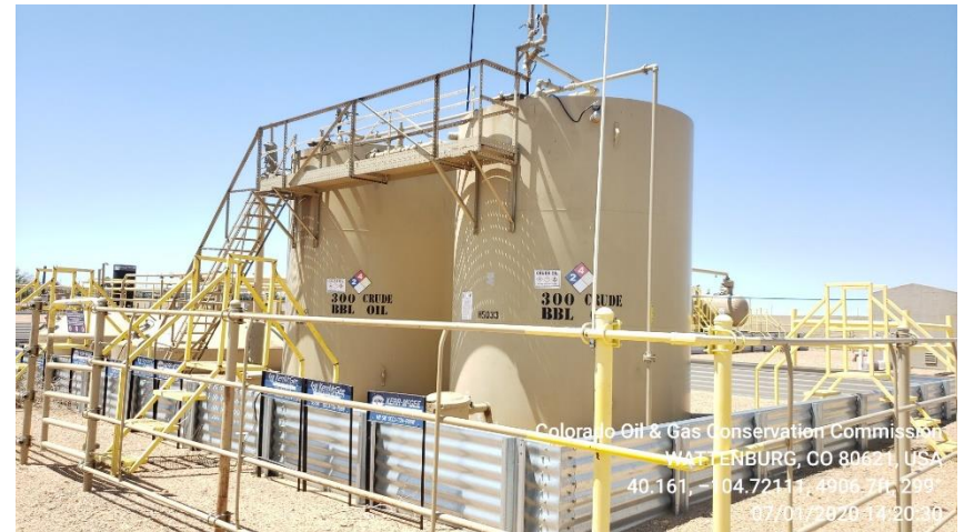
Photo 1 TB/signs