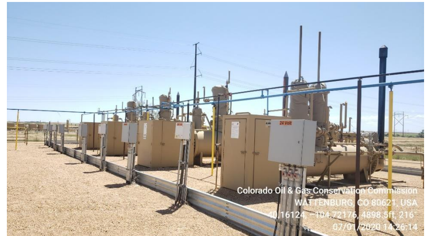
Photo 7 Horizontal Heated Separators