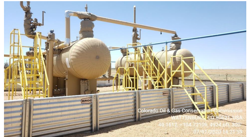
Photo 3 LACT