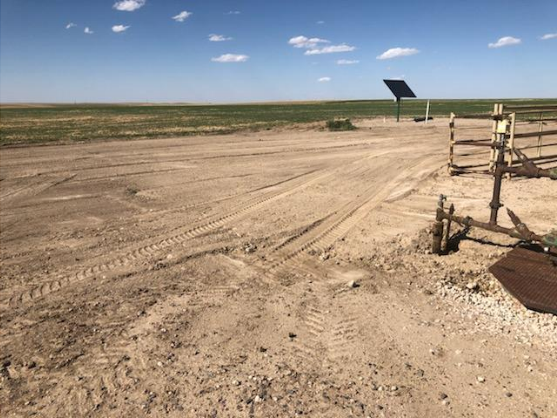
Operator's photo after cleanup the same day.