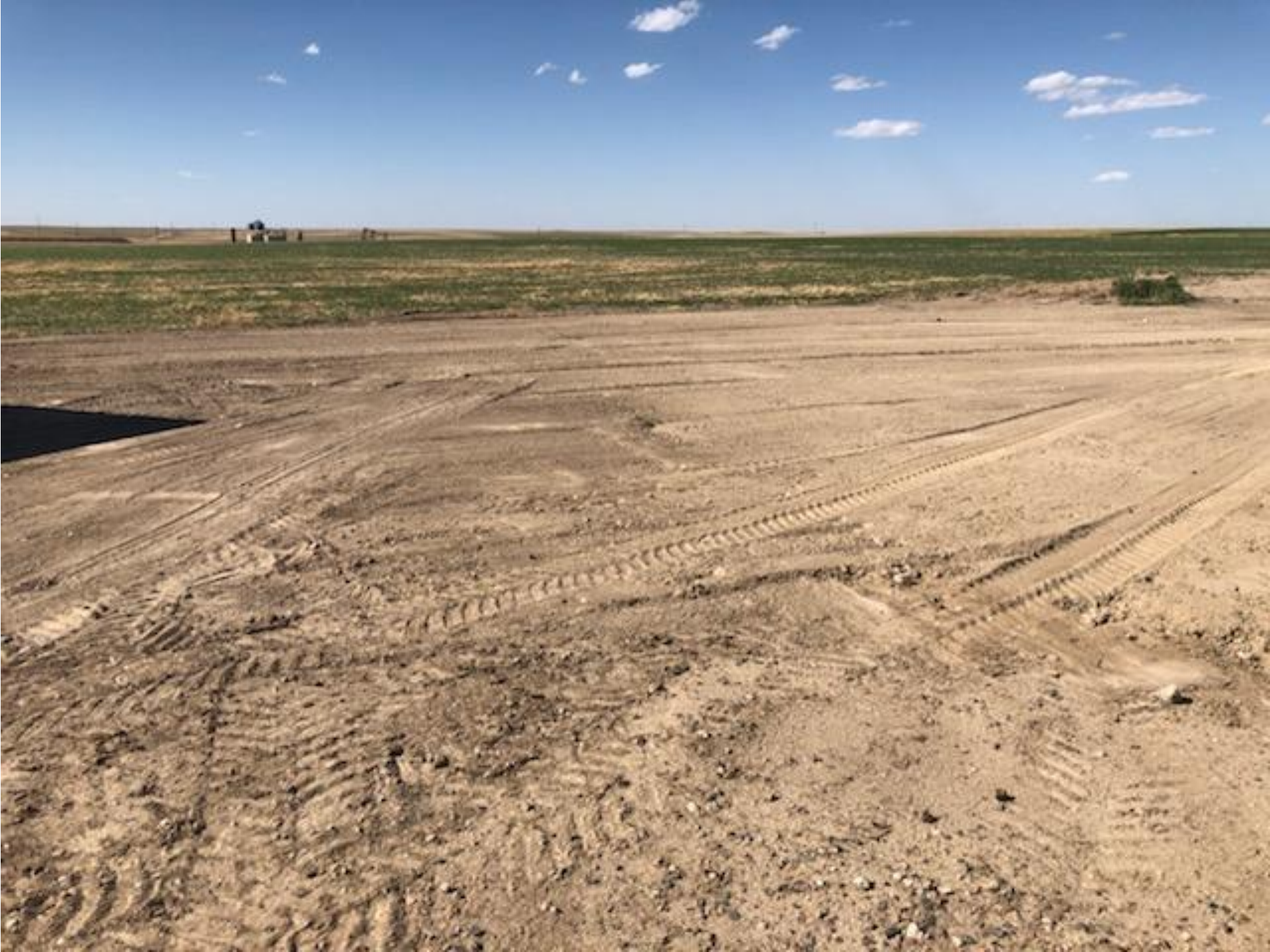
Operator's photo after cleanup the same day.