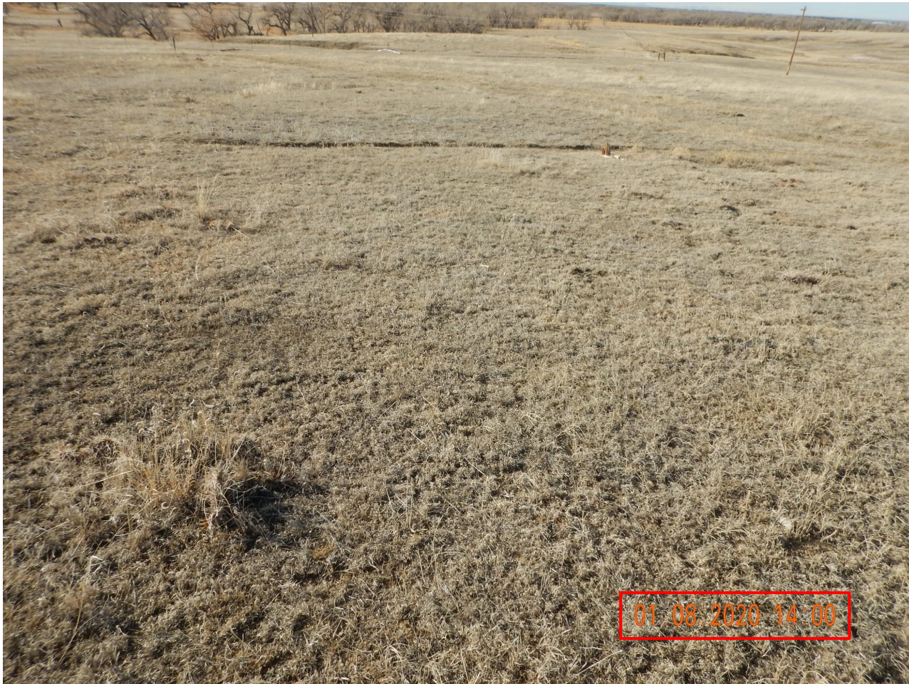
Photo 7. Tank battery reference photo taken 1/8/2020 northwest of the tank battery, facing West. Photo illustrates blue grama as the dominant vegetative cover.