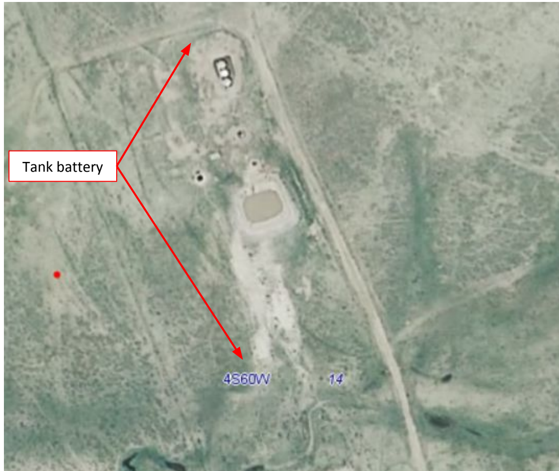
Photo 2. Zoomed in photo of the tank battery location. Photo illustrates the total disturbance including a potential produced water spill from a pit.