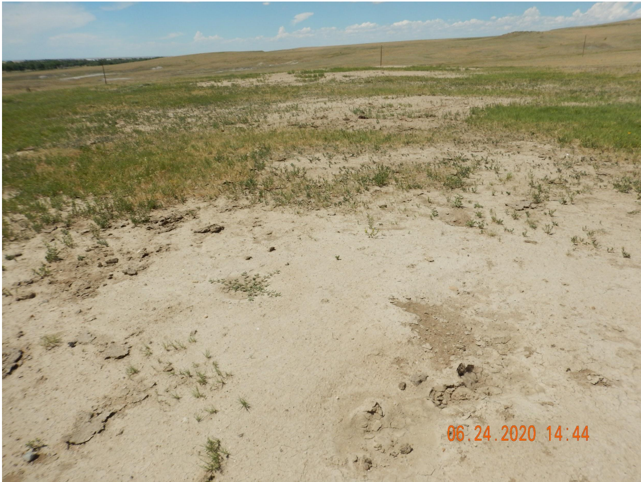
Photo 5. Photo taken from the northern tank battery, facing North. See comments under Photo 4.