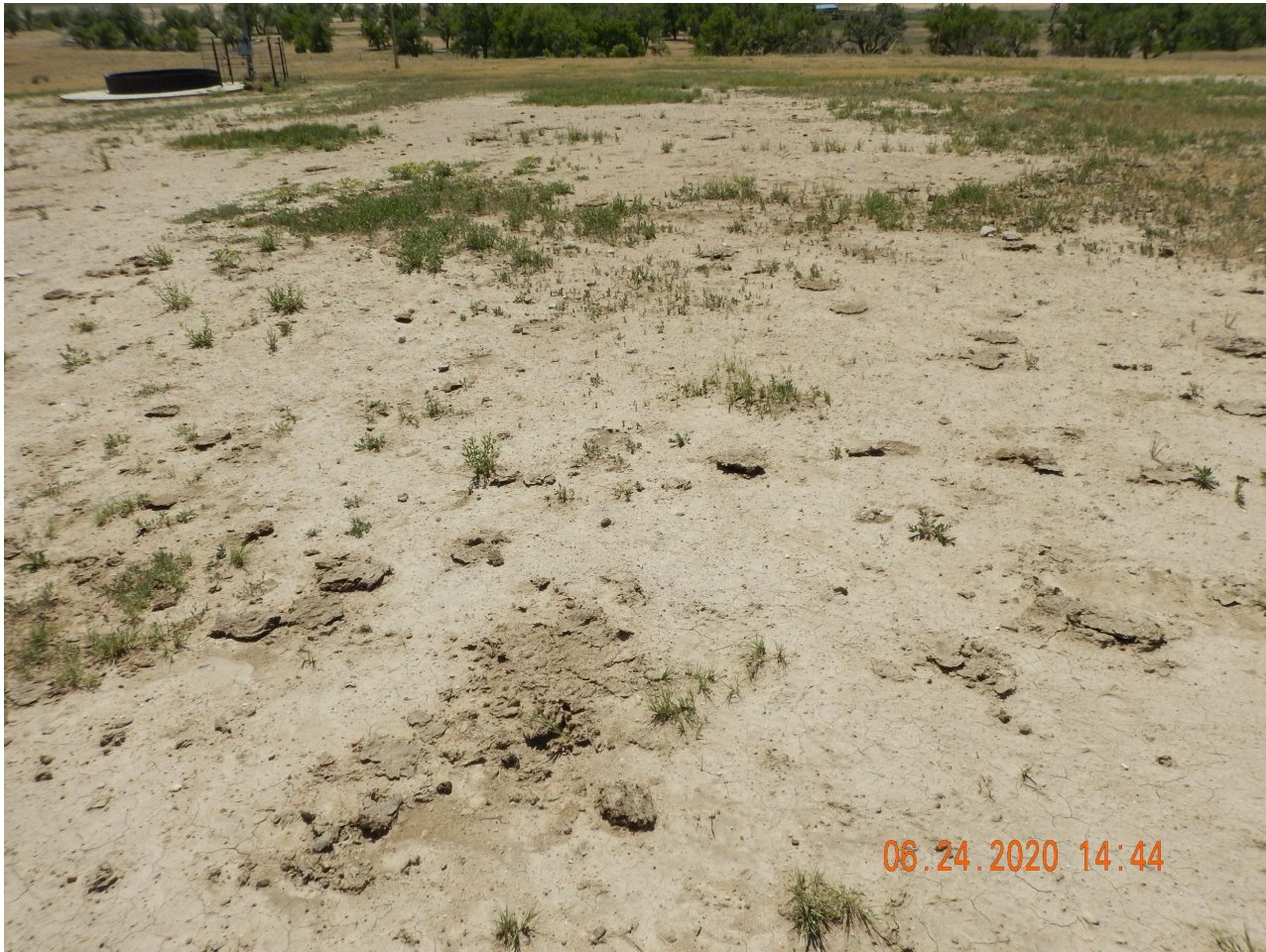
Photo 4. Photo taken from the northern tank battery, facing Southwest. Photo illustrates no reclamation activities have been performed.