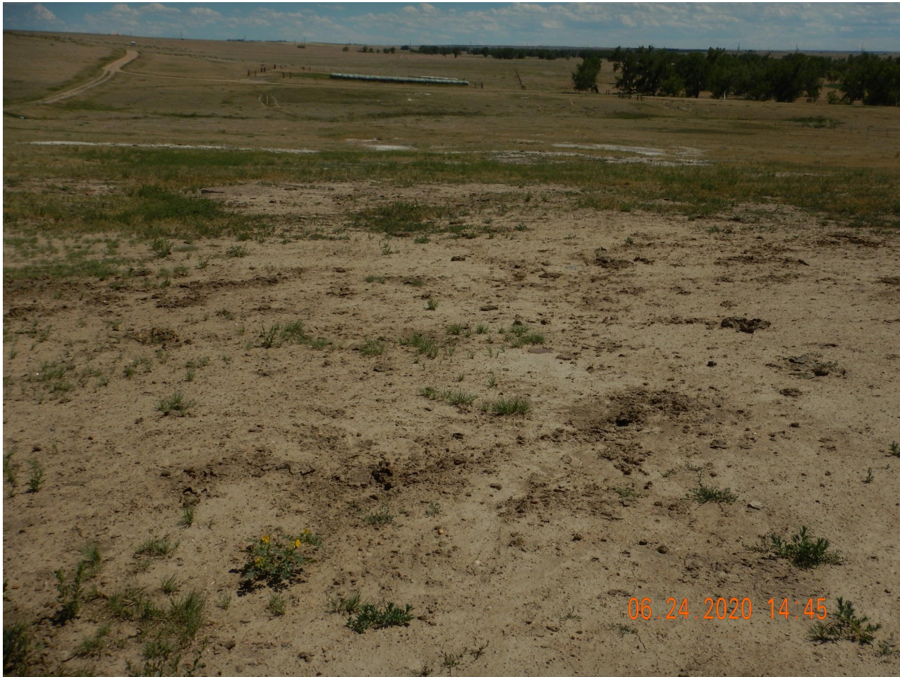
Photo 6. Photo taken from the northern tank battery, facing South. See comments under Photo 4.

Inspection Photos Location Name: PRICE #1 API #: 05-005-06064