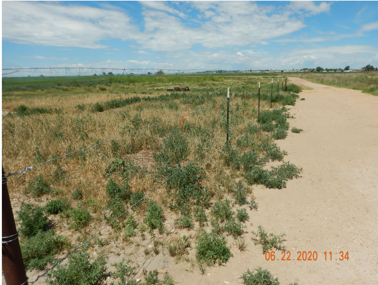
Photo 2. Photo taken from the southern tank battery, facing West. Photo illustrates fencing has been re-installed around the perimeter of the tank battery.