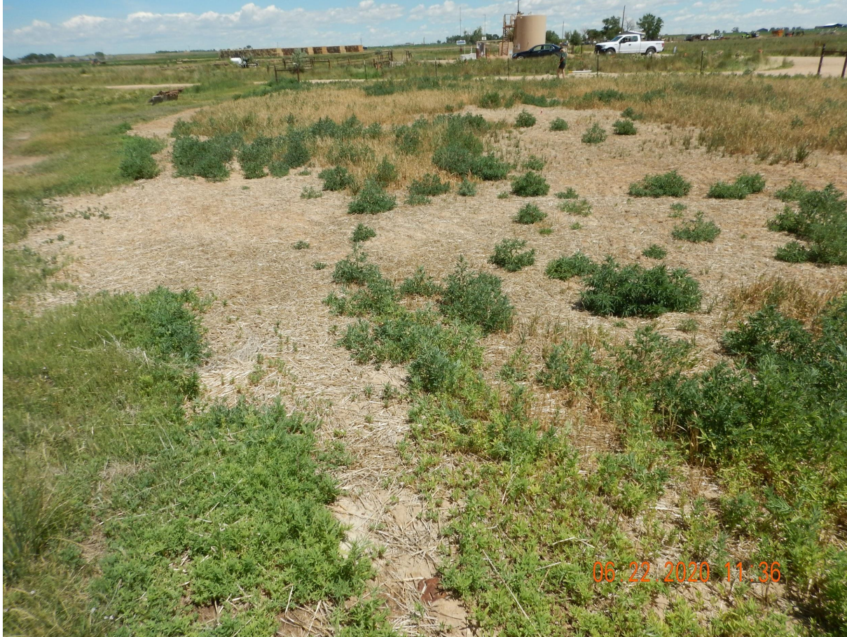
Photo 5. Photo taken from the southern tank battery, facing North. See comments under Photo 4.