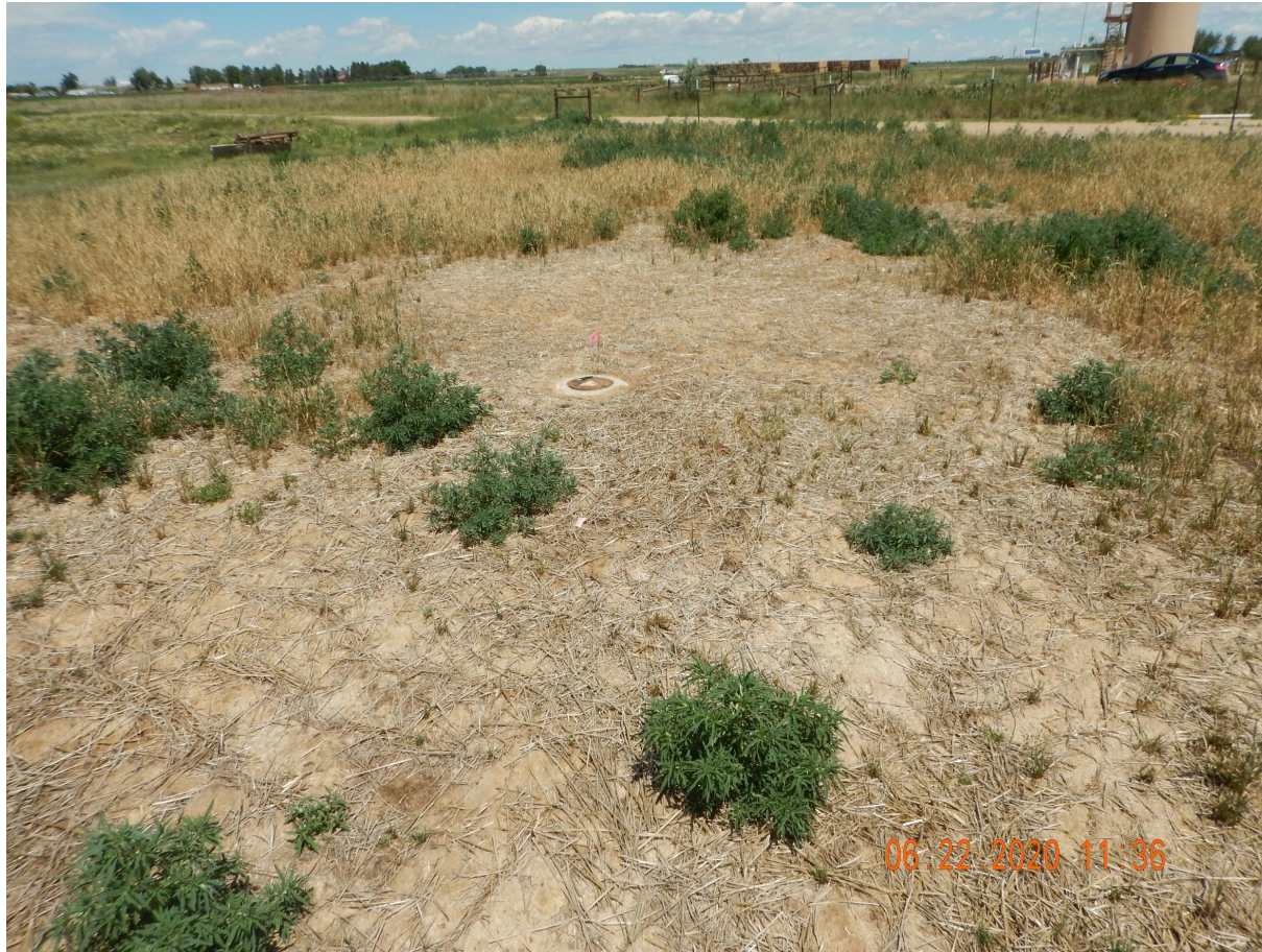
Photo 4. Photo taken from the northern tank battery, facing North. Photo illustrates a ground monitoring well that will be removed, as the Remediation Project has been approved. Germination was observed but Operator will likely need to perform additional reclamation activities, as germination of desirable species was not uniform.