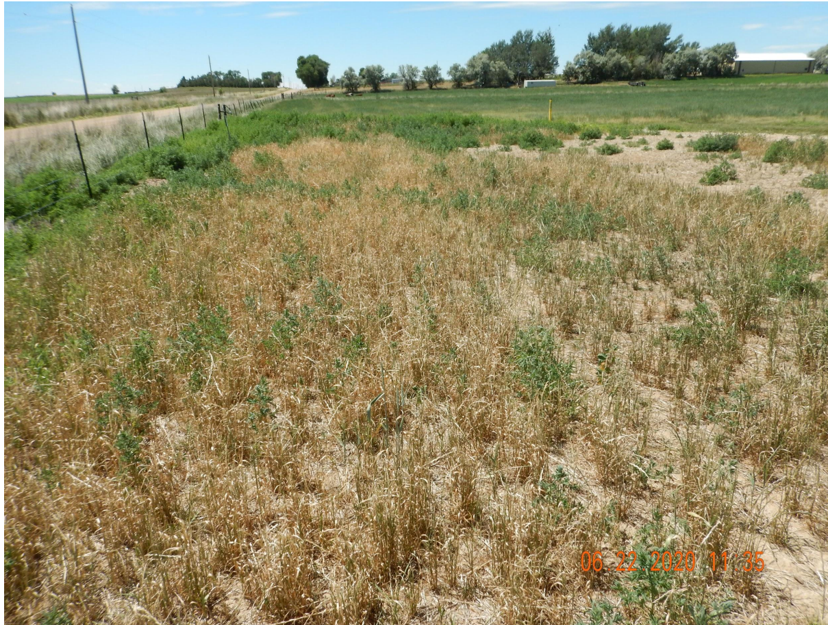
Photo 3. Photo taken from the southern tank battery, facing South. Photo illustrates Operator has performed final reclamation activities. Weed management will need to be performed soon.