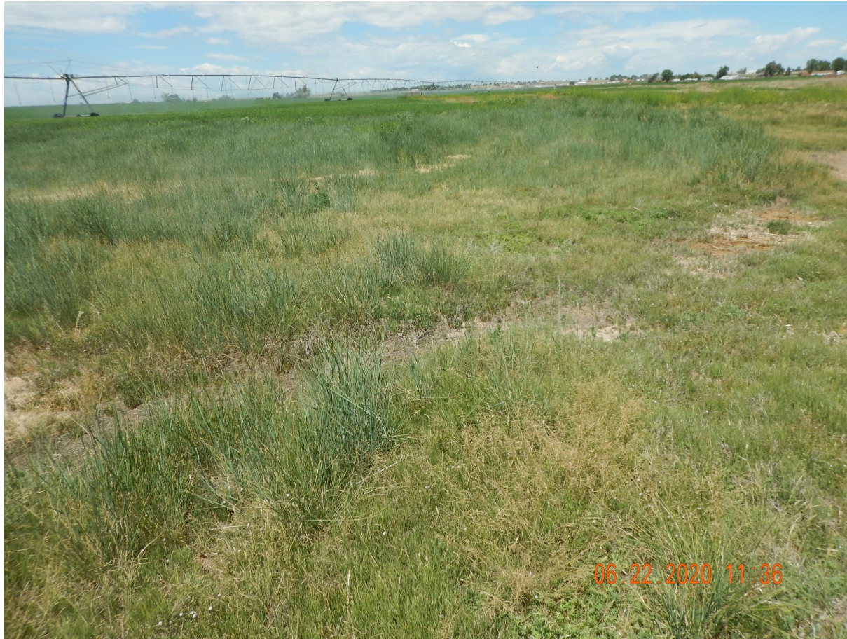
Photo 6. Reference photo taken south of the tank battery, facing West.