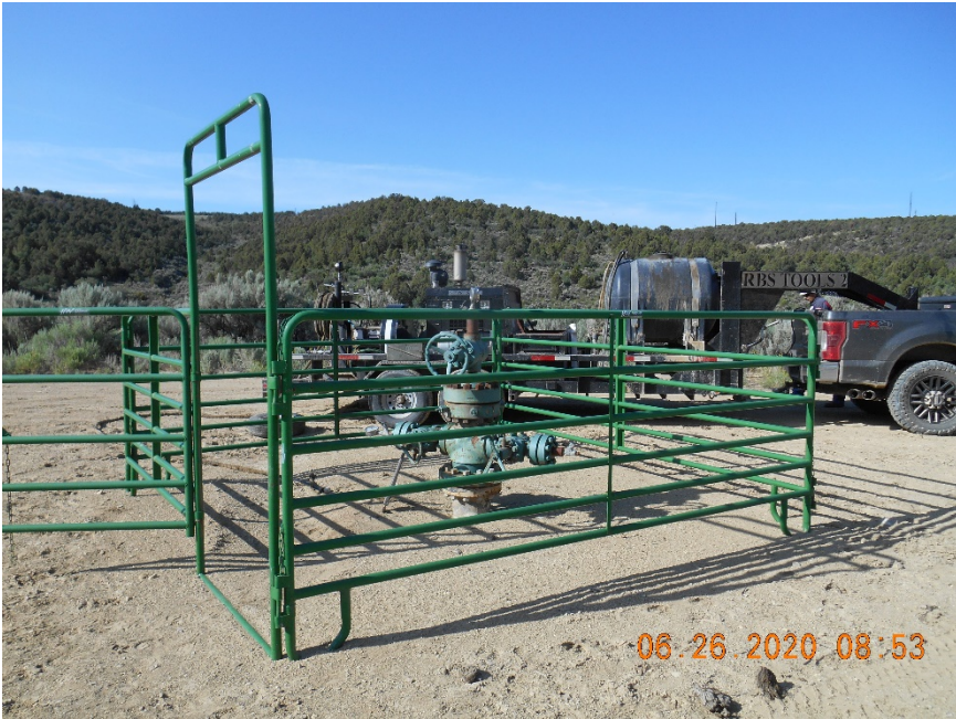
Injection wellhead. Temporarily Abandoned. Performing MIT