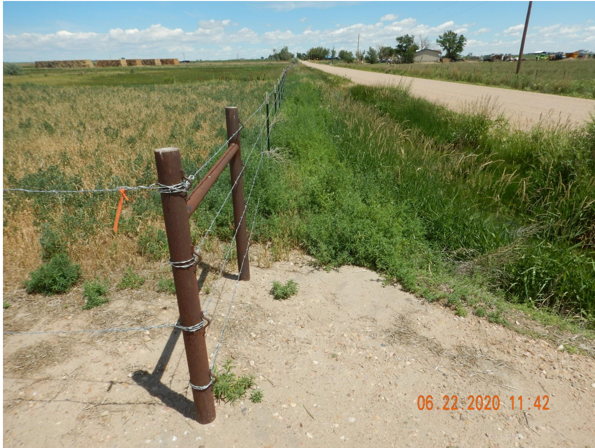
Photo 3. Photo taken from the southeastern portion of the northern tank battery, facing North. Photo illustrates the Operator re-installed the perimeter property fence.