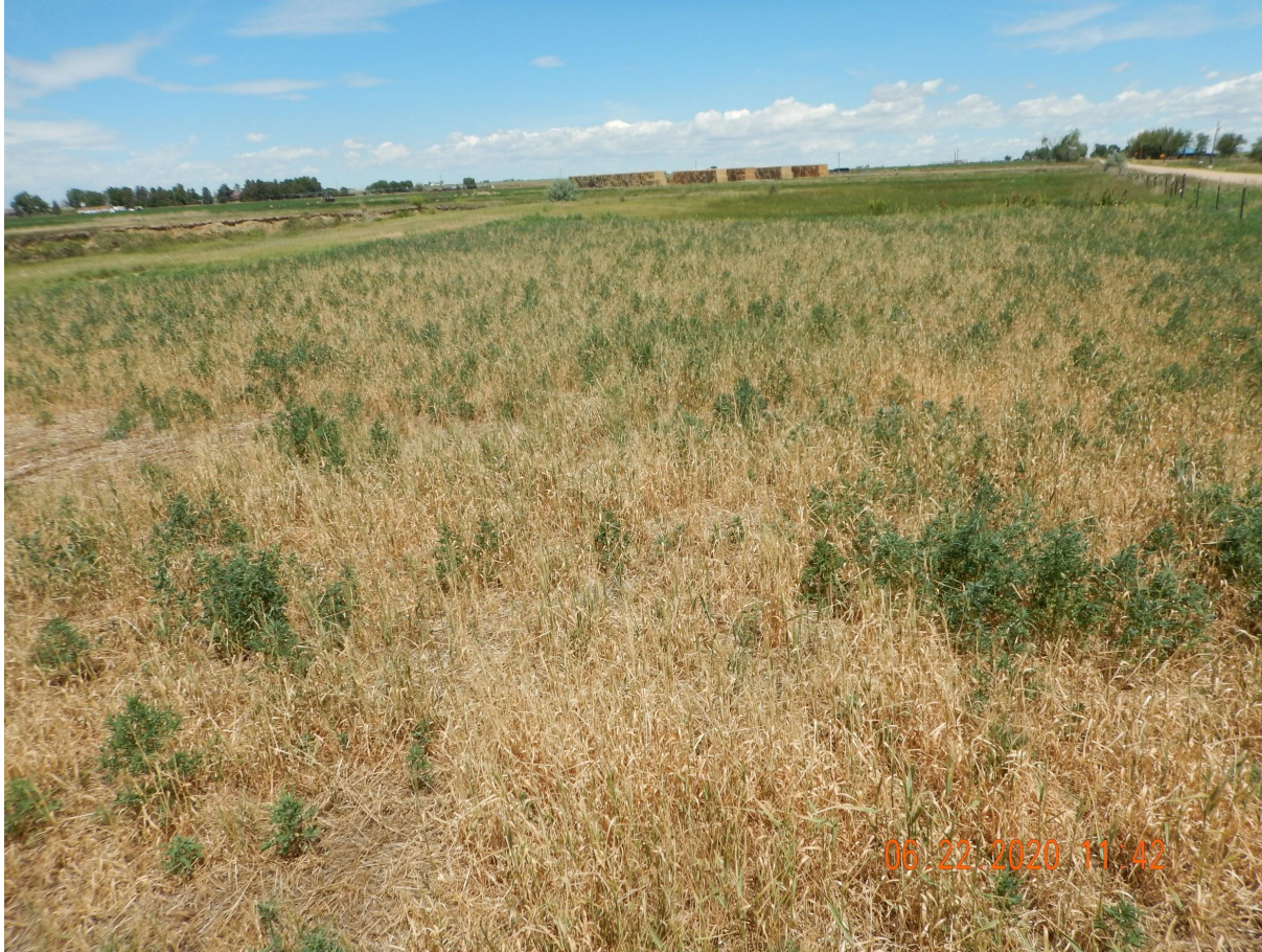
Photo 2. Photo taken from the southern portion of the northern tank battery, facing North. Photo illustrates the tank battery is in-process of achieving Rule 1003 vegetative compliance.