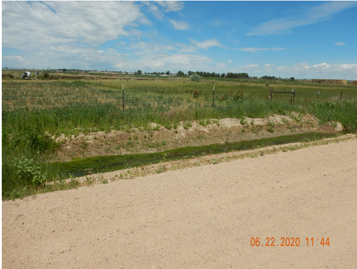
Photo 4. Photo taken from the northern entrance for the northern tank battery, facing Northwest. Photo illustrates the Operator removed the culvert.