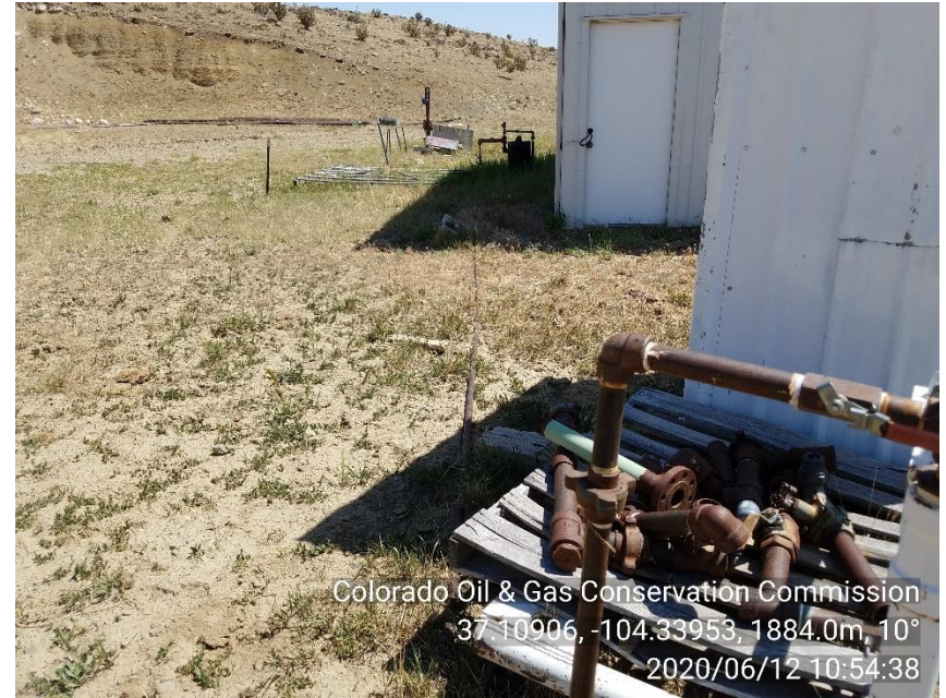
PHOTO 18: 2" LINE RUNNING FROM SEPARATOR BETWEEN WELLHEAD AND METER HOUSE ON WEST SIDE OF GARAGE STYLE BUILDING.