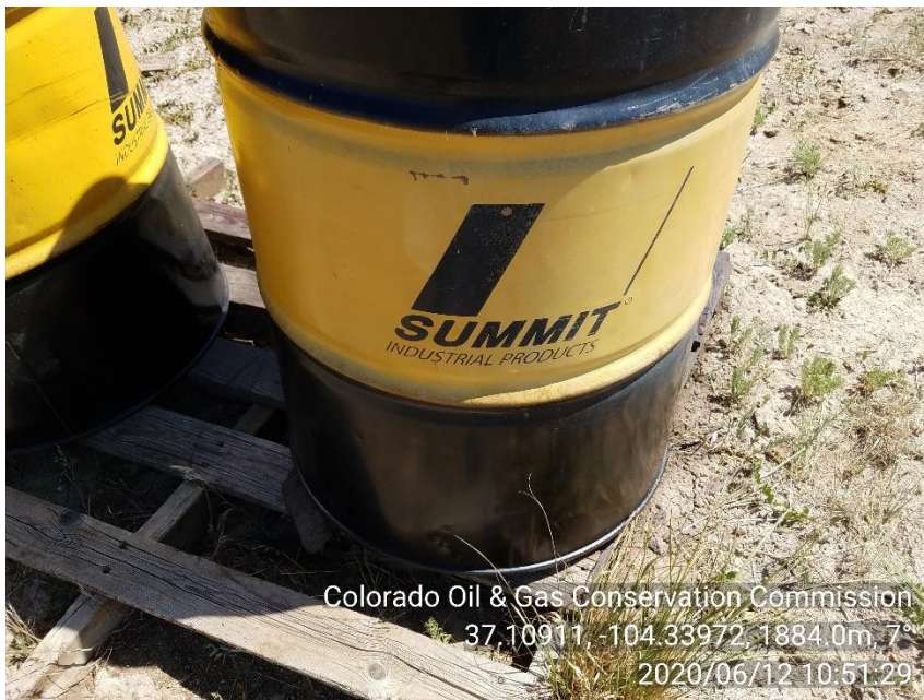
PHOTO 15: MANUFACTURER LABEL ON 1 OF THE 55 GAL. DRUMS IN WEST BATTERY.