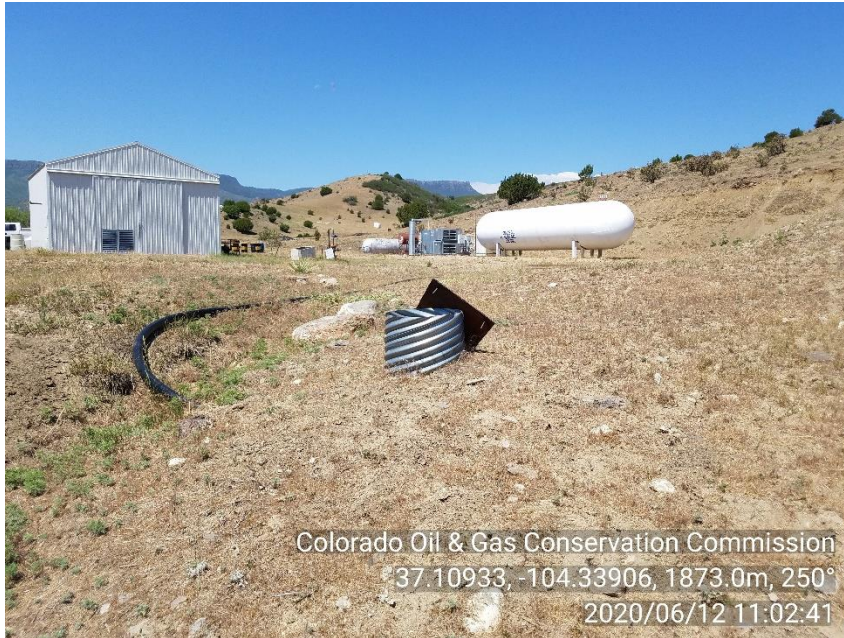
PHOTO 33: CELLAR CONTAINING A VALVE THAT APPEARS TO BE CLOSED . (THIS IS THE VALVE THAT CONTROLS THE LEAKING POLLY PIPE THAT RUNNS FROM THIS CELLAR ACROSS LOCATION TO APP. 300' TO THE SOUTH OF LOCATION WHERE THERE IS A SLIGHT LEAK, THIS IS THE LINE THAT USED TO SUPPLY A HOUSE THAT IS A FEW HUNDRED YARDS TO THE SOUTH OF LOCATION). THE LINE HAS BEEN CUT AT THE PROPERTY LINE BY THE NEW LANDOWNER.