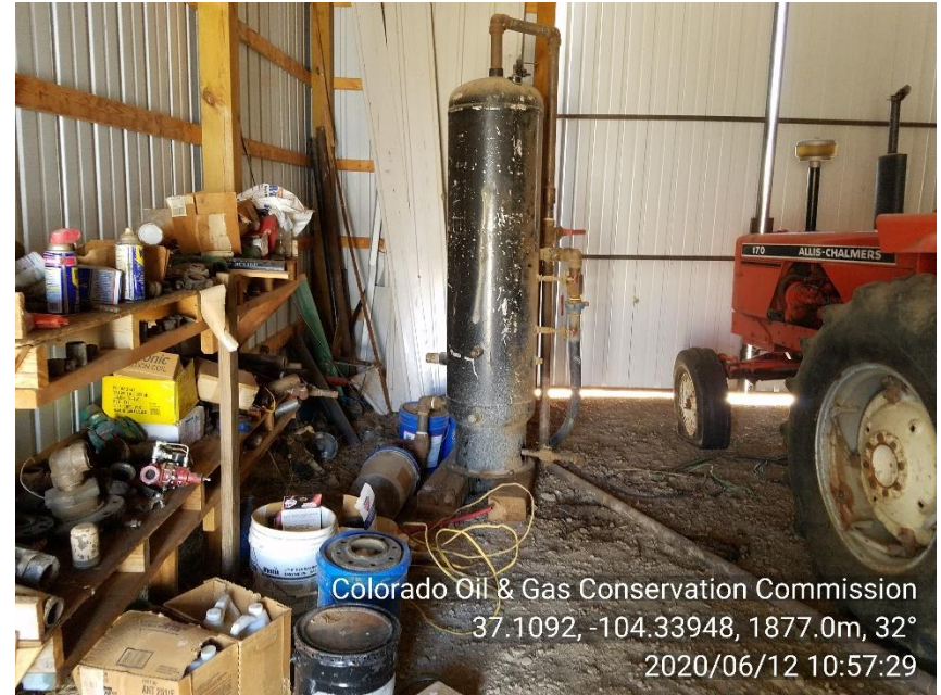
PHOTO 22: APPEARS TO BE A SEPARATOR INSIDE GARAGE STYLE BUILDING ON LOCATION. THERE IS ALSO A TRACTOR STORED INSIDE BUILDING. (TRACTOR IS OWNED BY MR. SANDIBAL THE LAST LAND OWNER)