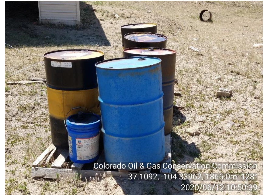
PHOTO 10: BATTERY OF 55 GALEN BARRELS WEST OF CARPORT STYLE BUILDING. REMOVE UNUSED EQUIPMENT COMPLY WITH RULE 603.f.