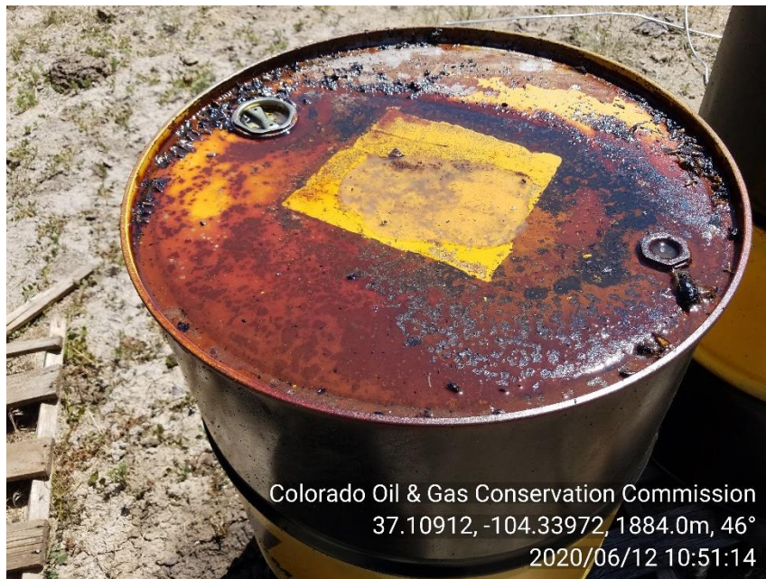
PHOTO 13: FLUID ON TOP OF 1 OF THE 55 GAL. DRUMS IN WEST BATTERY. CAN NOT DETERMINE SOURCE OF FLUID AT TIME OF INSPECTION.