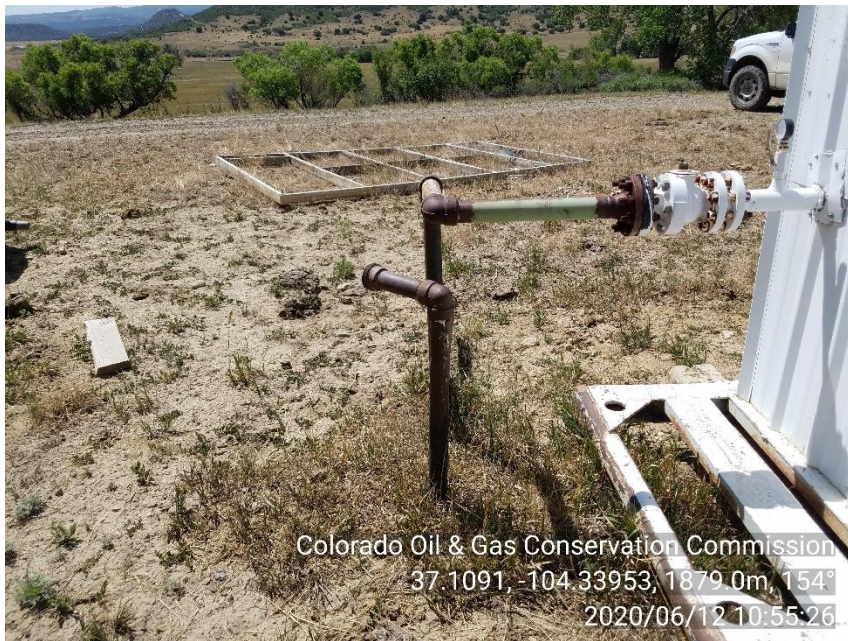
PHOTO 21: UNUSED RISER NEAR METER HOUSE. REMOVE UNUSED RISERS COMPLY WITH NTO AND RULE 603.f.