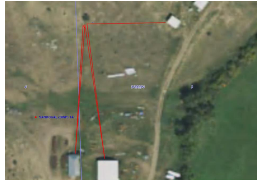
PHOTO 32: PHOTO 35: DISTANCE FROM LEAK TO NEAREST BUILDING (SOUTHERN MOST BUILDING ON LOCATION) APP. 222'. DISTANCE FROM NEXT CLOSEST BUILDING (RANCH OWNED BUILDING APPEARS TO BE TOOL SHED) APP. 339' AND DISTANCE FROM NEXT BUILDING (LARGE SHOP OWNED BY LANDOWNER) 324'.