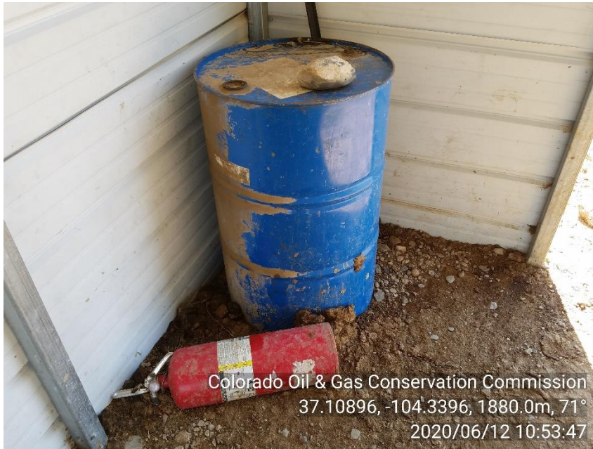
PHOTO 9: UNUSED EQUIPMENT STORED INSIDE CARPORT STYLE BUILDING. LABEL WAS NOT LEGIBLE. REMOVE UNUSED EQUIPMENT COMPLY WITH RULE 603.f.