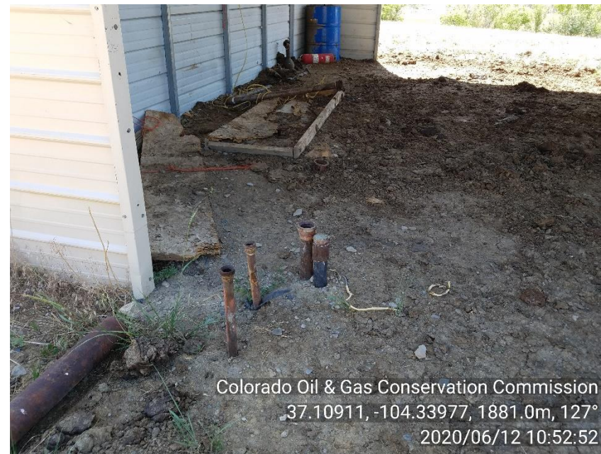
PHOTO 6: UNUSED RISERS NEAR WEST ENTRANCE OF CARPORT STYLE BUILDING. REMOVE UNUSED RISERS COMPLY WITH NTO AND RULE 603.f.