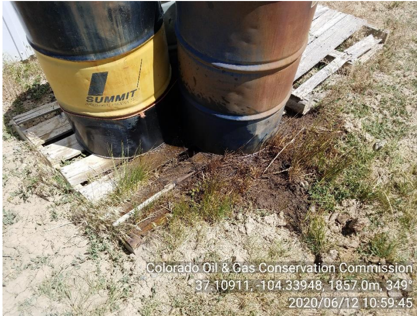
PHOTO 29: APPEARS THAT 1 OR MORE OF THE 55 GAL. DRUMS IN EAST BATTER ARE LEAKING FLUID. CANNOT DETERMINE WHICH BARRELS OR BARRELS ARE LEAKING. (IT APPEARS THAT IT COULD BE USED OIL ON THE PALLETS AND GROUND NEAR BARRELS).