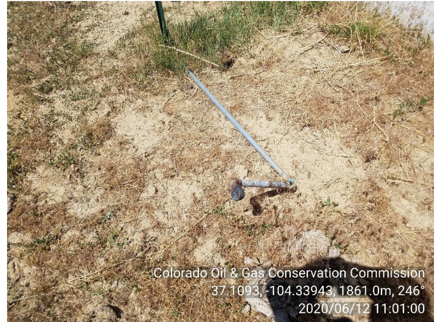
PHOTO 30: UNUSED RISER ON EAST SIDE OF GARAGE STYLE BUILDING. REMOVE UNUSED RISER COMPLY WITH NTO AND RULE 603.f.