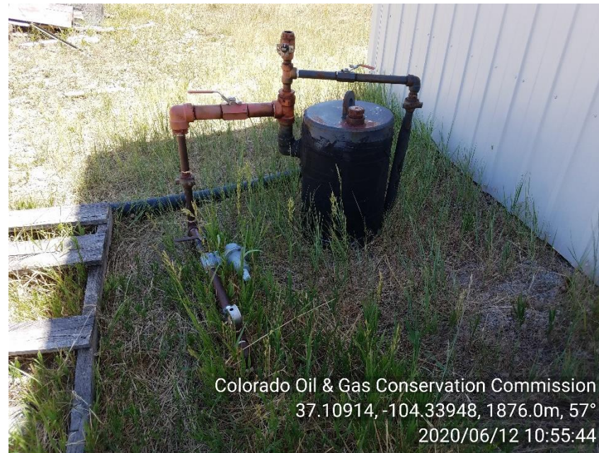
PHOTO 22: APPEARS TO BE A SEPARATOR BETWEEN WELLHEAD AND METER HOUSE.