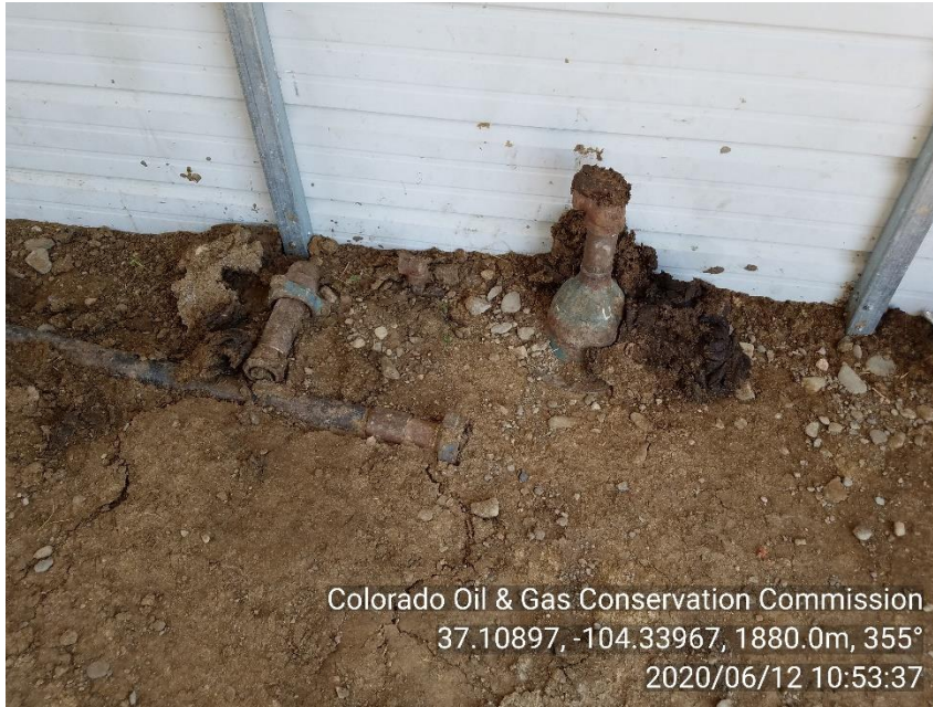
PHOTO 7: UNUSED RISERS ON INSIDE CARPORT STYLE BUILDING CLOSE TO NORTH WALL. REMOVE UNUSED RISERS COMPLY WITH NTO AND RULE 603.f.