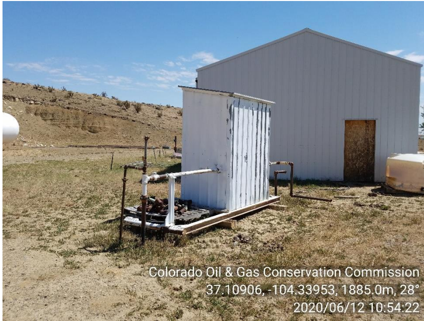
PHOTO 17: METER HOUSE AND GARAGE STYLE BUILDING IN THE MIDDLE OF LOCATION CLOSE TO EAST EDGE.