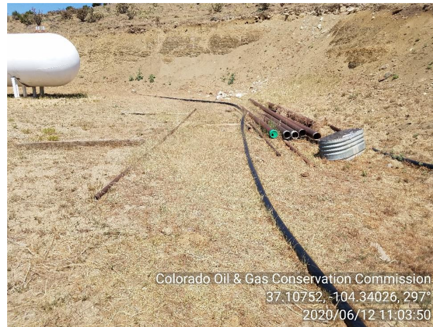
PHOTO 32: UNUSED MIS. PIPES STORED ON NORTH SIDE OF LOCATION (2 7/8" TBG AND APPEARS TO BE 6" CSG.). REMOVE UNUSED EQUIPMENT COMPLY WITH RULE 603.f.