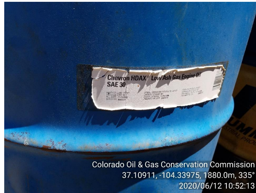
PHOTO 16: MANUFACTURER LABEL ON 1 OF THE 55 GAL. DRUMS IN WEST BATTERY.