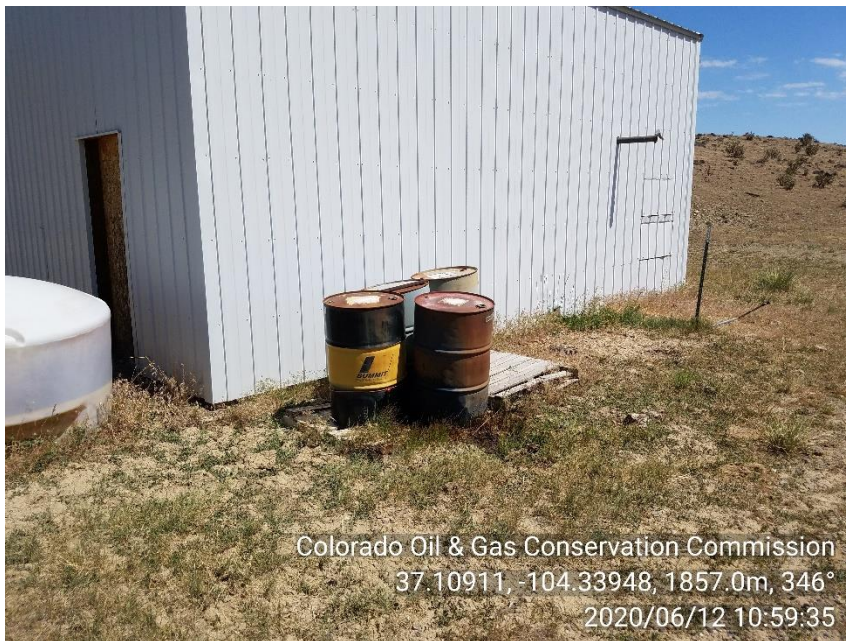
PHOTO 25: BATTERY OF 55 GAL. DRUMS ON EAST SIDE OF GARAGE STYLE BUILDING. REMOVE UNUSED EQUIPMENT COMPLY WITH RULE 603.f.