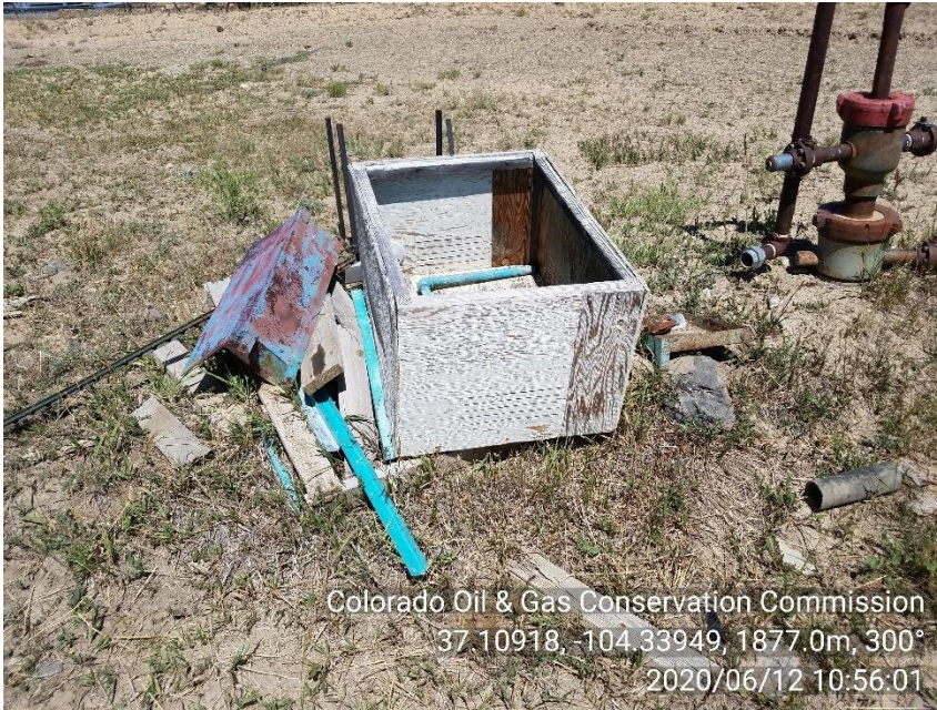
PHOTO 23: UNUSED EQUIPMENT STORED NEXT TO WELLHEAD. REMOVE UNUSED EQUIPMENT COMPLY WITH RULE 603.f.