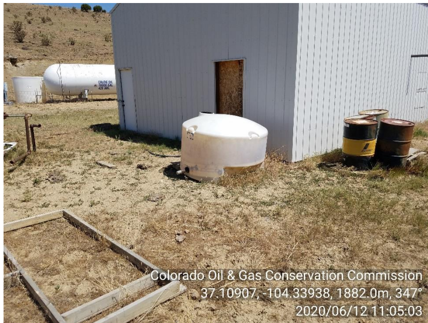
PHOTO 31: UNUSED EQUIPMENT ON SOUTH SIDE OF GARAGE STYLE BUILDING. REMOVE UNUSED EQUIPMENT COMPLY WITH RULE 603.f.