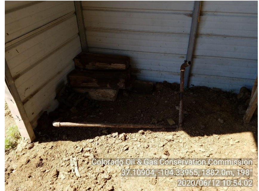
PHOTO 8: UNUSED RISERS ON INSIDE CARPORT STYLE BUILDING CLOSE TO SOUTHEAST WALL. IT APPEARS THAT THIS RISER IS DISCONNECTED JUST OUTSIDE OF BUILDING ON EAST SIDE. REMOVE UNUSED RISERS COMPLY WITH NTO AND RULE 603.f.