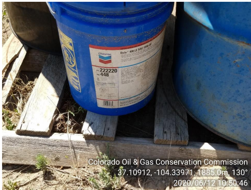
PHOTO 11: LABEL ON 5 GAL. BUCKET INCLUDED WITH WEST 55 GAL. DRUM BATTERY.