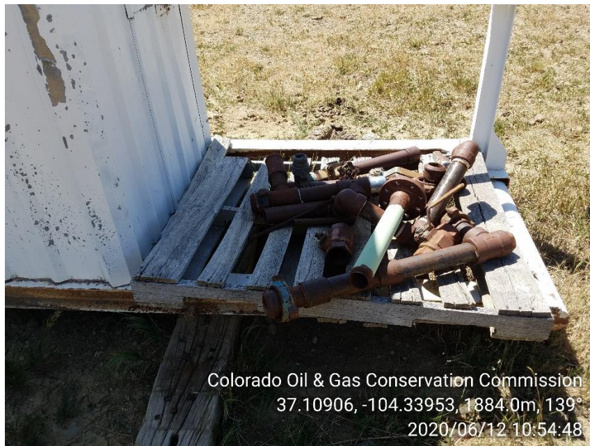
PHOTO 19: UNUSED EQUIPEMNT STORED ON PALLET ON METER HOUSE SKID. REMOVE UNUSED EQUIPMENT COMPLY WITH RULE 603.f.