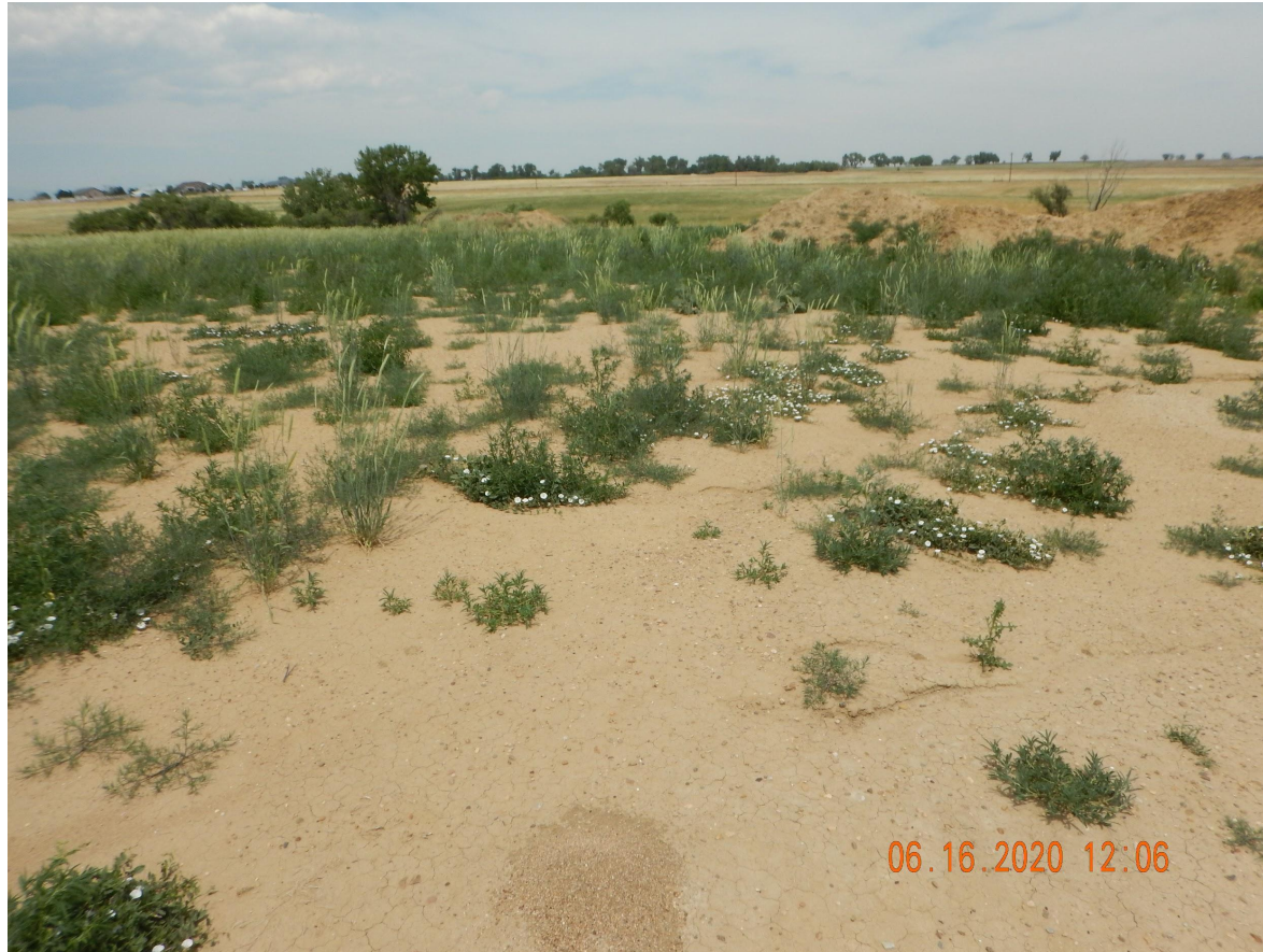
Photo 1. Photo taken from the southern well location, facing Northwest. Photo illustrates no crop growth observed with soil stockpiles. Location has not been properly contoured.