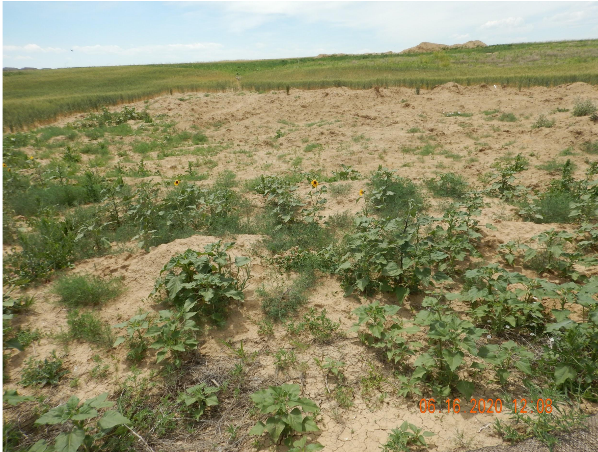
Photo 4. Photo taken north of the well location, facing South. Photo illustrates an area of disturbance where stormwater erosion is directed to.