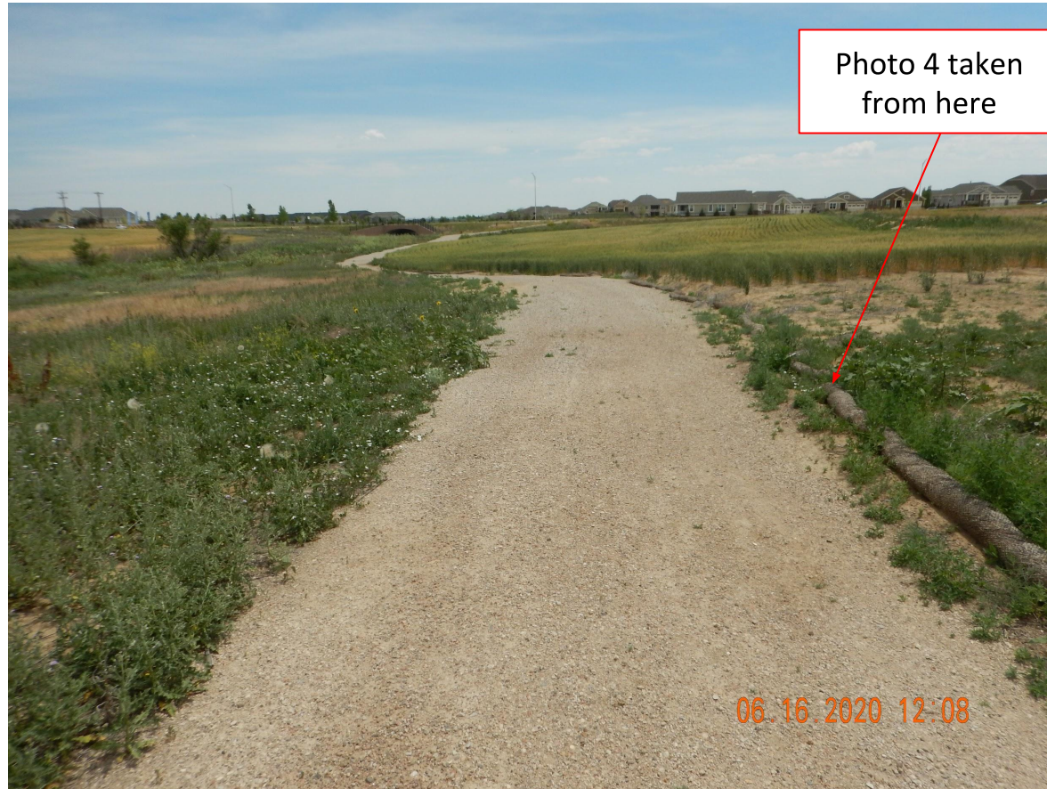
Photo 5. Photo taken north of the well location, facing East. Photo illustrates stormwater BMPs (wattles) that have been installed. There does not appear to be any sediment discharge beyond this point.