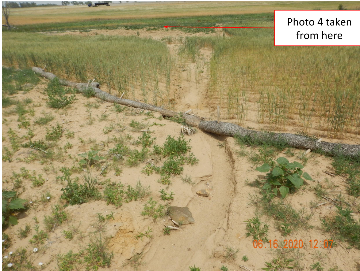
Photo 3. Photo taken from the northeastern well location, facing North. Photo illustrates stormwater erosion discharging from location. Current BMPs are not in proper functioning condition.