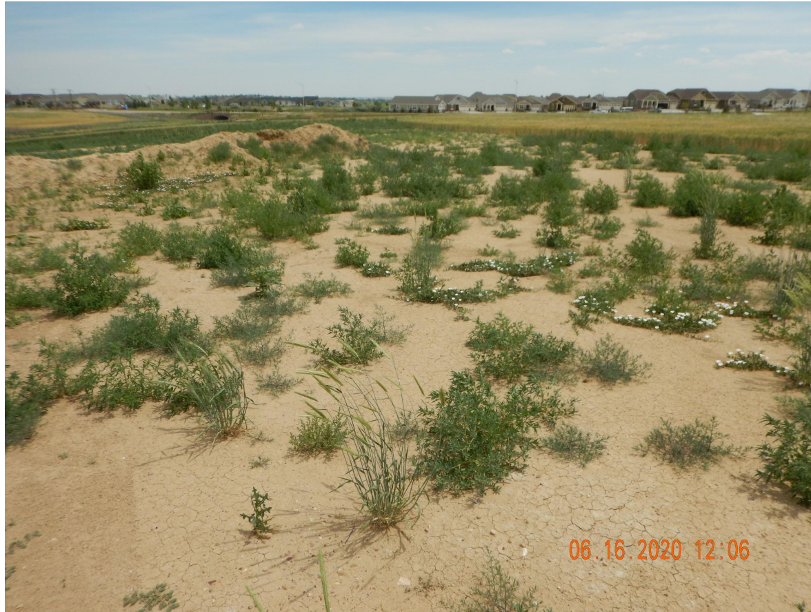
Photo 2. Photo taken from the southern well location, facing Northeast. See comments under Photo 1.