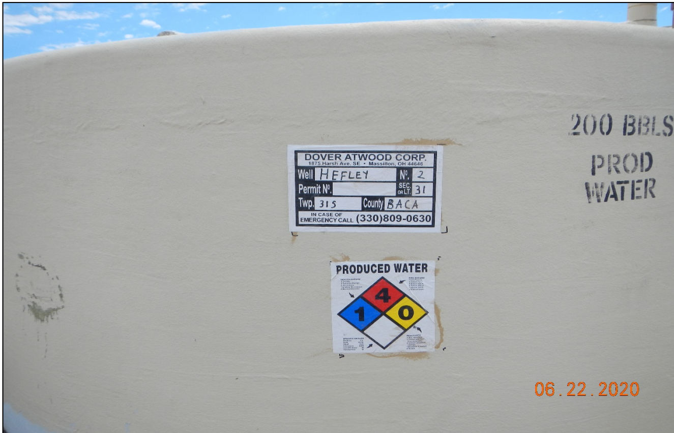
Photo 4. The tank sign and NFPA label are installed on backside of the tank which is not readily visible from the front side along the county road.