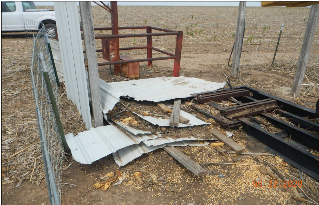
Photo 8. There are pieces of metal debris laying next to the pumpjack.