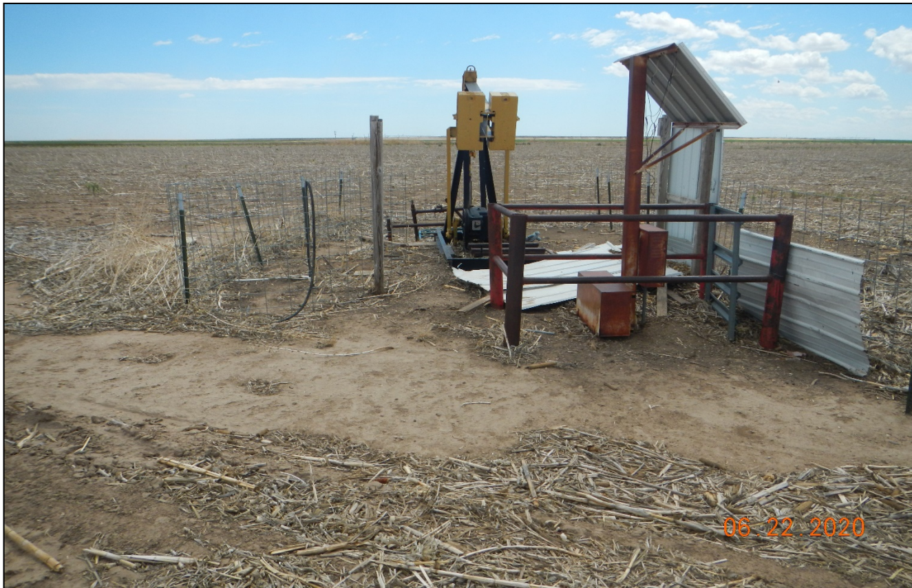
Photo 6. Facing east at the well.