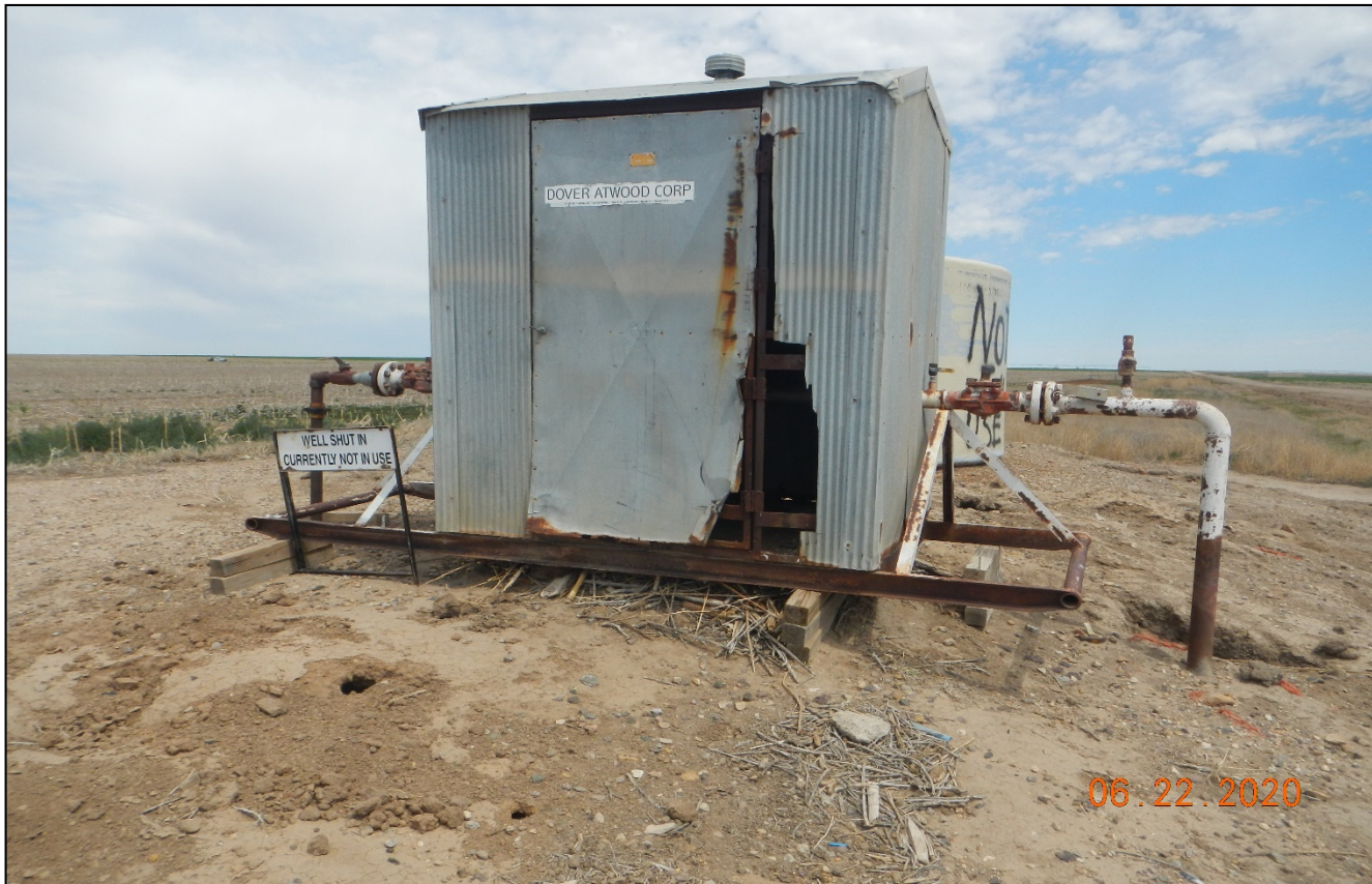
Photo 2. The meter shed is not maintained and remains unstable. Erosion has occurred underneath the meter shed which is a safety concern..