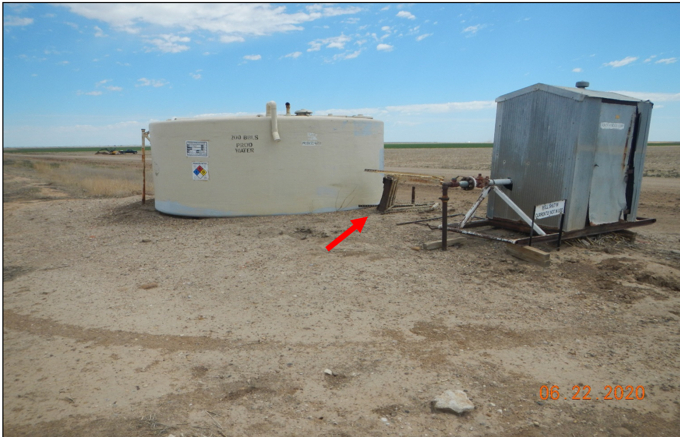
Photo 3. Corrective actions of the previous inspection were not performed. There is no berm around the 200 bbls tank. There is unused equipment at the location (red arrow).