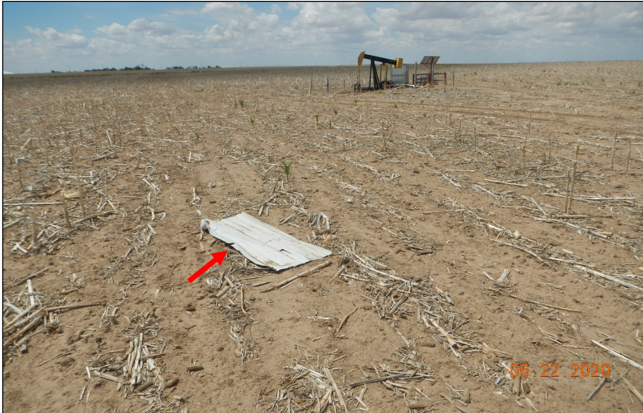
Photo 5. Facing southwest toward the wellsite. There is metal tin debris from the wellsite observed northeast of the well (red arrow).