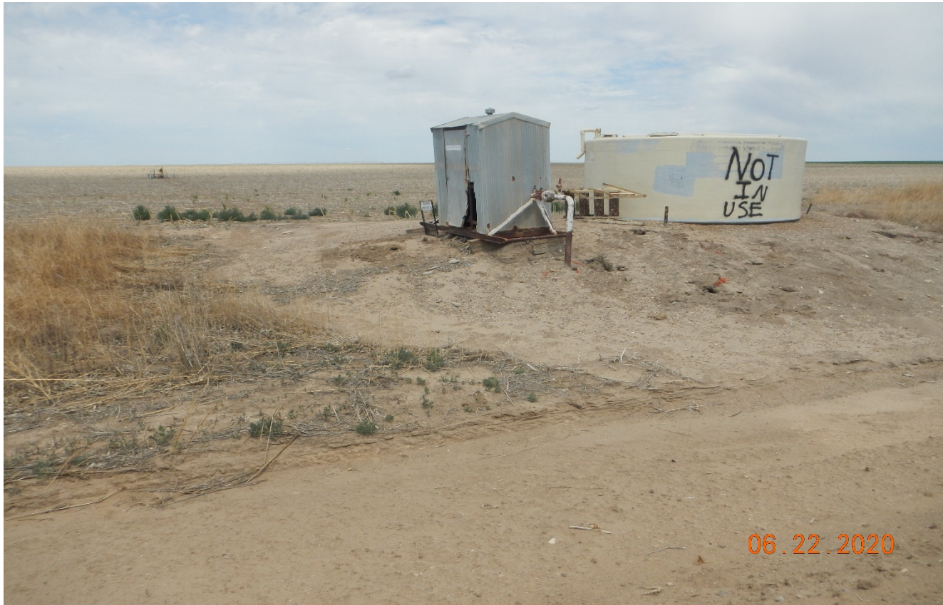
Photo 1. Facing west toward the PW tank and meter shed located adjacent to CR-49 and 575' east of the well. No operator sign is visible from the county road but a sign was observed on backside of tank. Meter shed still appears to be unstable and there is no berm around the tank. Corrective actions were not completed.