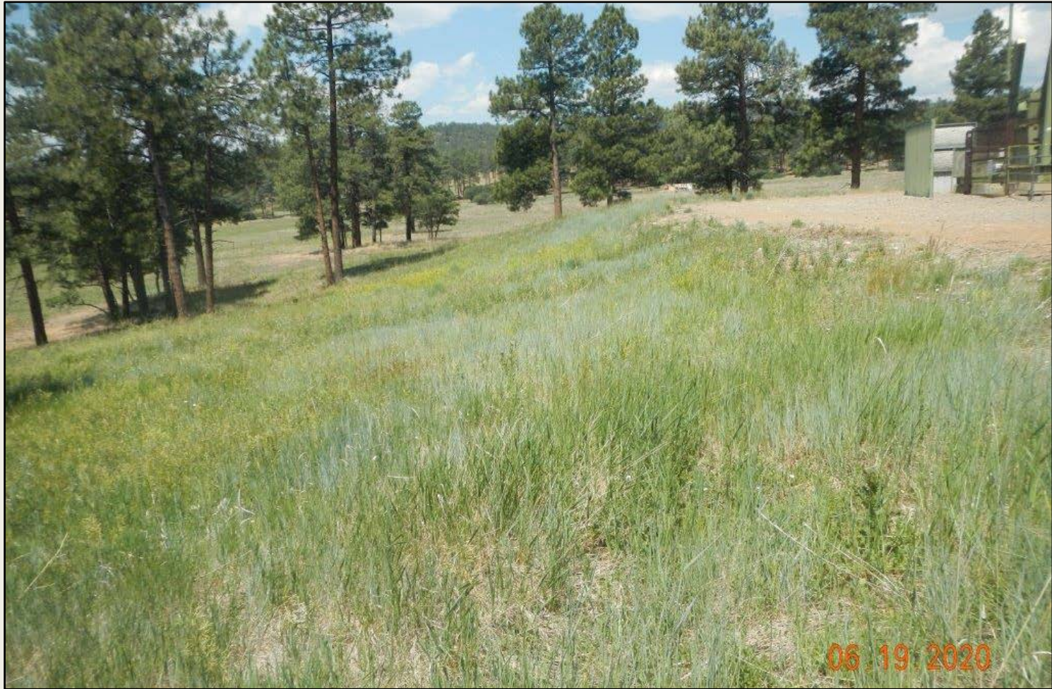
Photo 2. View of the southern fill slope from the southern corner facing northwestward. Revegetation is progressing, largely with smooth brome and western wheatgrass.