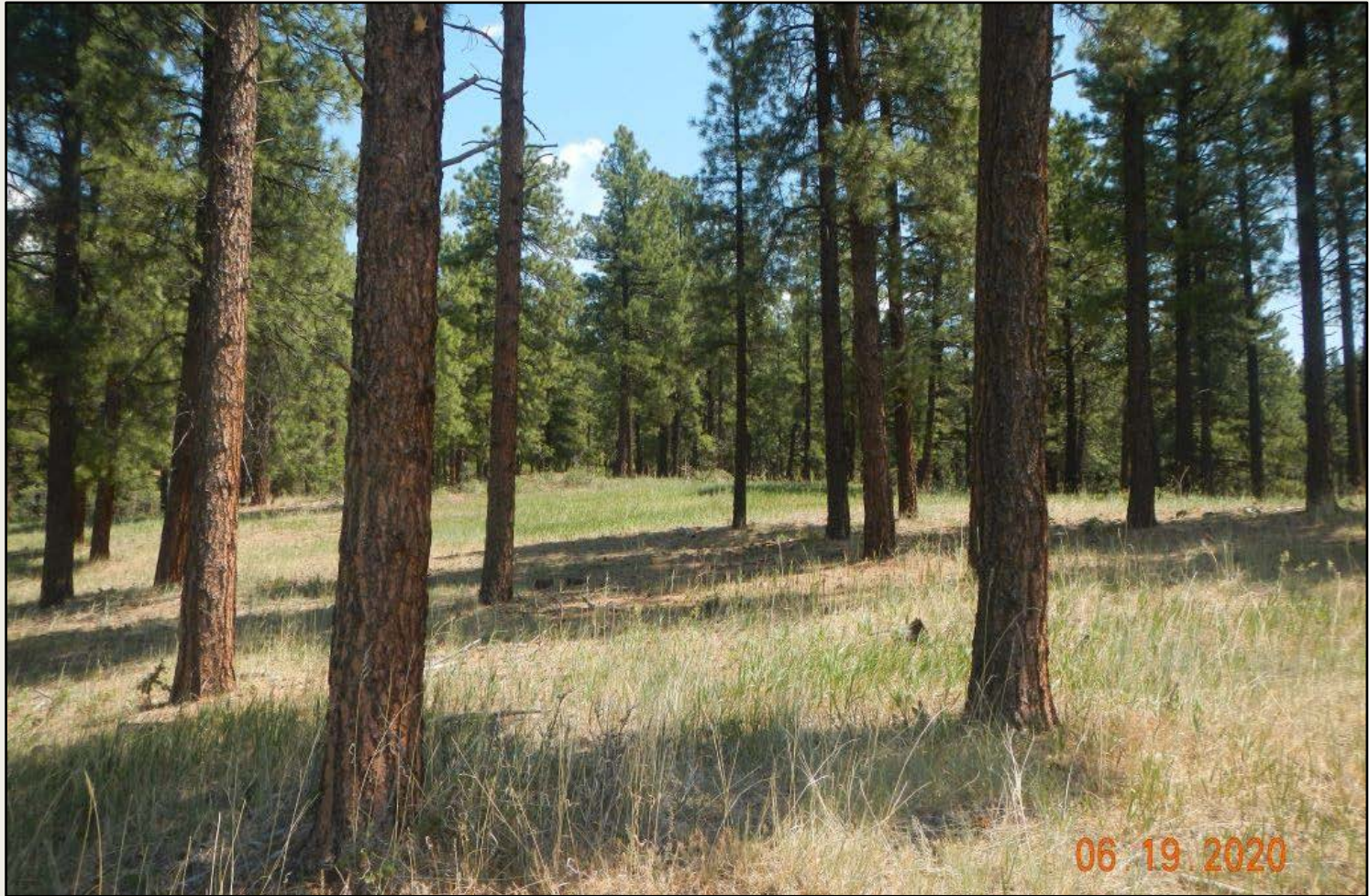
Photo 5. View of the reference area, comprised of ponderosa pine woodland with a grassy understory of smooth brome and western wheatgrass, as well as gambel oaks.