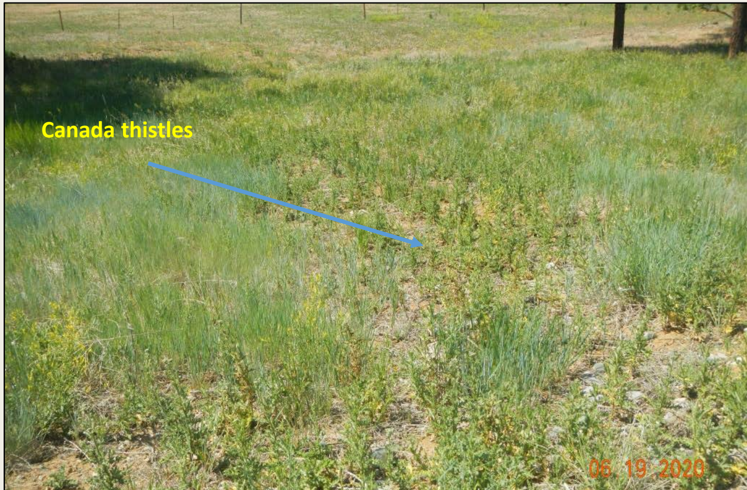
Photo 3. View of Canada thistles growing within the southern project area. Approximately 1000 individuals observed.