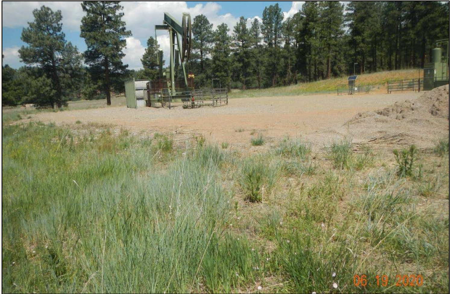
Photo 1. View of the project area from the southern corner facing center.