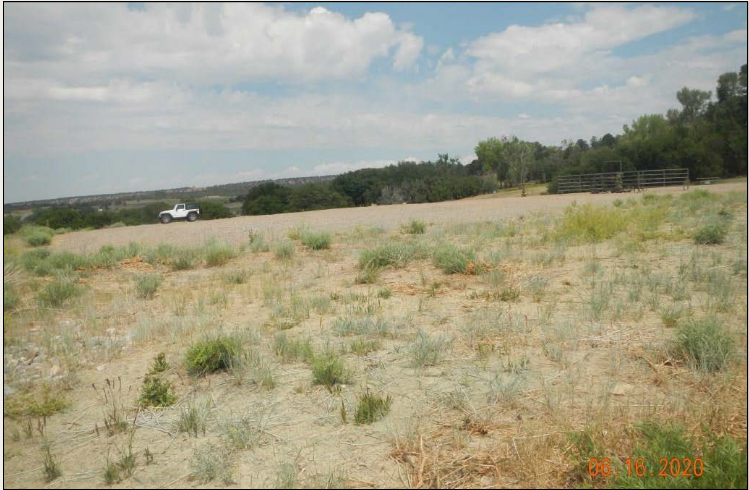
Photo 1. View of the project area from the southeastern corner facing center.