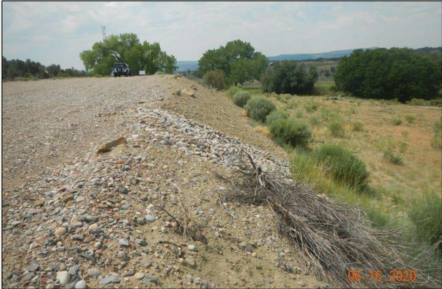
Photo 2. View of the western fill slope from the northwestern corner facing southward. Sparse revegetation observed on well pad fill slopes, stabilization measures are needed.