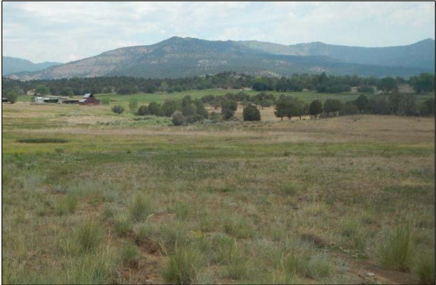
Photo 4. View of the reference area, comprised of open grass field with grasses such as western wheatgrass, Indian ricegrass, and smooth brome.