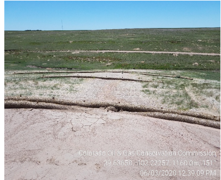
6. Waddles and Netting