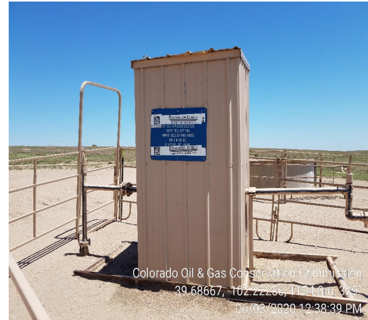
2. Gas meter