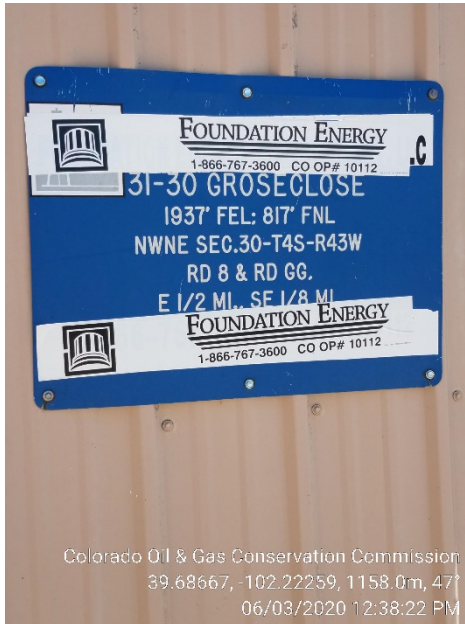
1. Lease sign