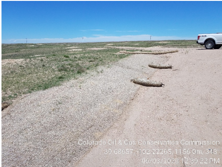
7. Waddles and Netting