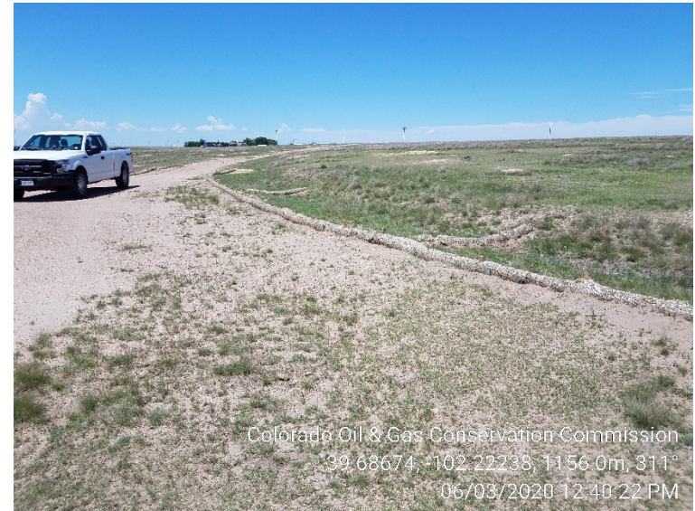
10. Waddles and Netting