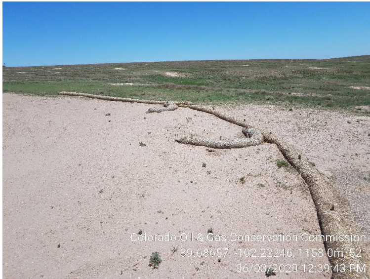
9. Waddles and Netting