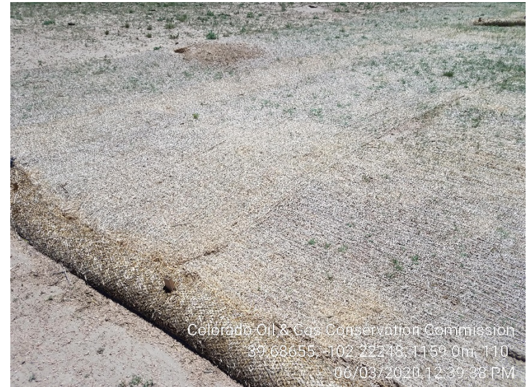
8. Waddles and Netting