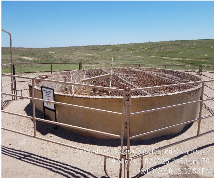
5. Water tank w/Wildlife Screening