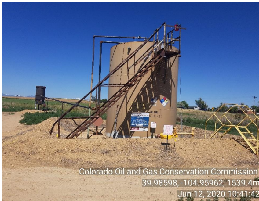
Colorado Oil and Gas Conservation Commission 39.98598, -104.95962, 1539.4m Jun 12, 2020 10:41:42