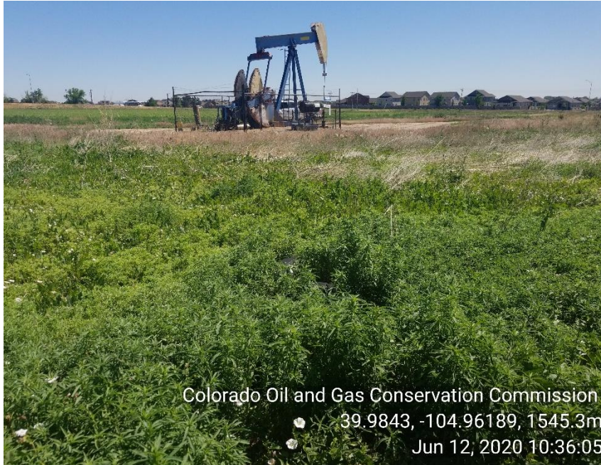
Photo 5 Weeds on location and gut line anchor not properly marked