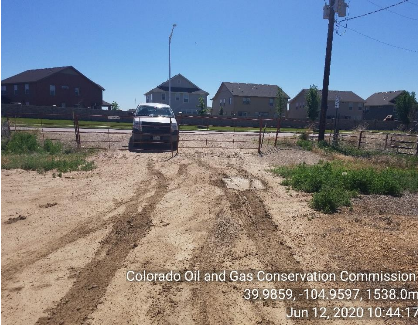
Photo 11 no tracking pad to entrance to production facility from York street.