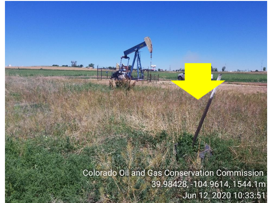
Photo 2 Weeds on location and gut line anchor not properly marked