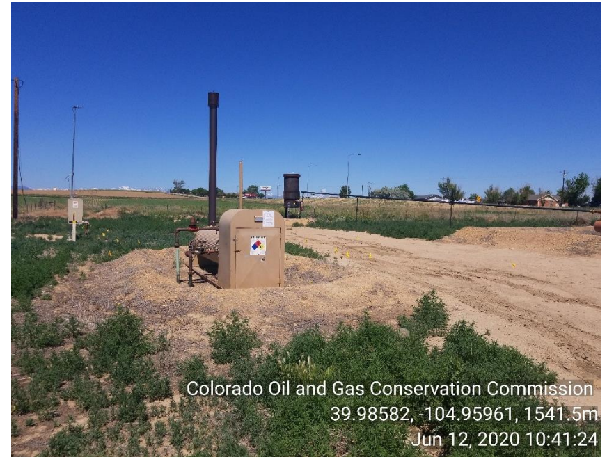
Photo 8 Weeds on location.