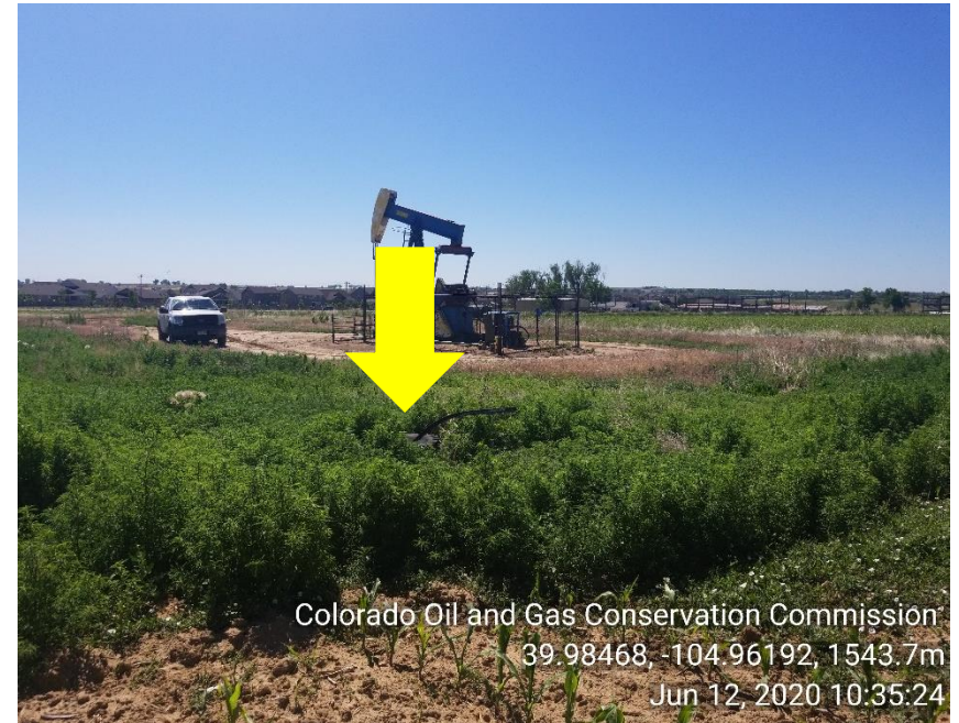
Photo 4 Weeds on location and gut line anchor not properly marked