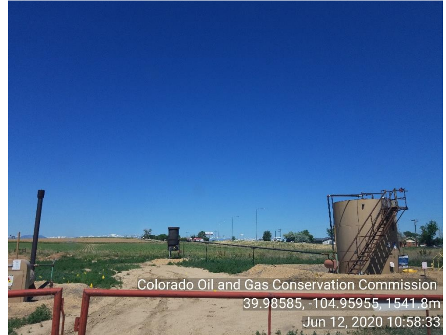
Photo 12 New 3in line ran from production tank to ECD