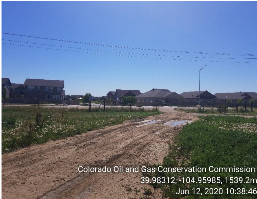
Photo 7 no tracking pad on lease road entrance . Deep ruts on access road no proper BMP's