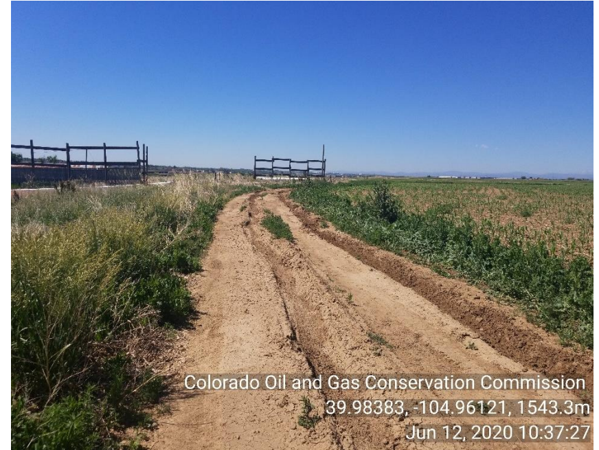
Photo 6 Weeds along road access and deep ruts in road no proper BMP's