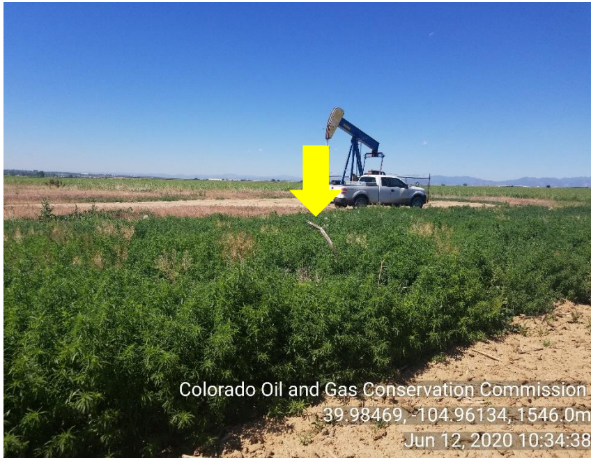
Photo 3 Weeds on location and gut line anchor not properly marked